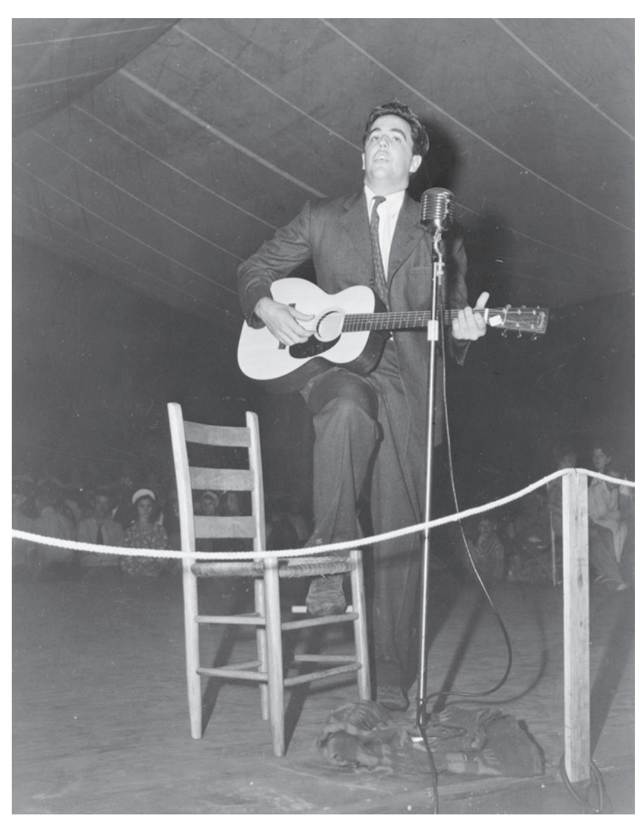
Figure 4. Alan Lomax playing guitar on stage at the Mountain Music Festival, Asheville, North Carolina, {\bf 1938}