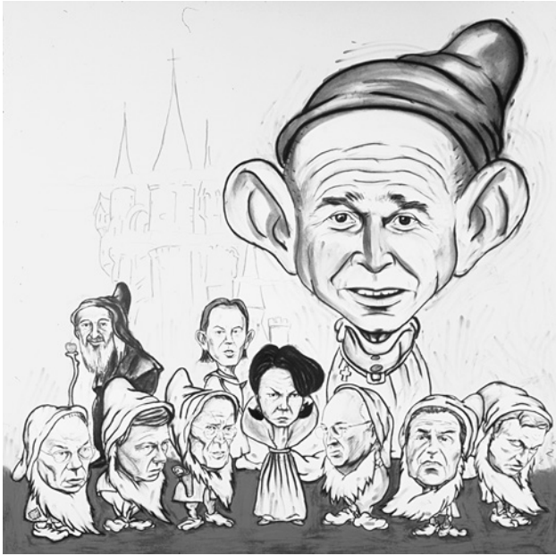
FIGURE 3.4 Enrique Chagoya, Untitled (Snow White and the Seven Dwarfs) , 2004. Courtesy Enrique Chagoya.