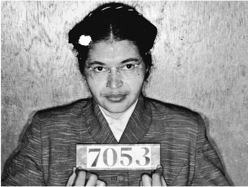
FIGURE 2.1 Rosa Parks's iconic arrest photo, February 21, 1956.