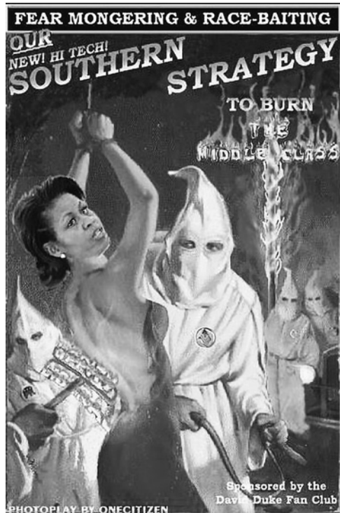
FIGURE 4.1 One Citizen, Fear Mongering and Race-Baiting: Our New! Hi Tech! Southern Strategy (To Burn the Middle Class) , Sponsored by the David Duke Fan Club, 2008.

lingering influence on the national political culture. It recollects the traumatizing “southern horrors” elaborated by Ida B. Wells, which linger in black historical and cultural memory, by visualizing the extremist violence and abuse of the black body in the South in the national imaginary. In hindsight, this image in the Daily Kos seems further ironic in light of the actual outcome in the election, which unsettled and sidelined the typical stronghold of the southern strategy in national politics.