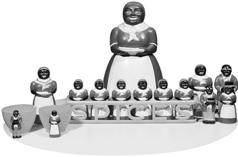
FIGURE 1.1 Aunt Jemima kitchen items by F&F Mold and Die Works.