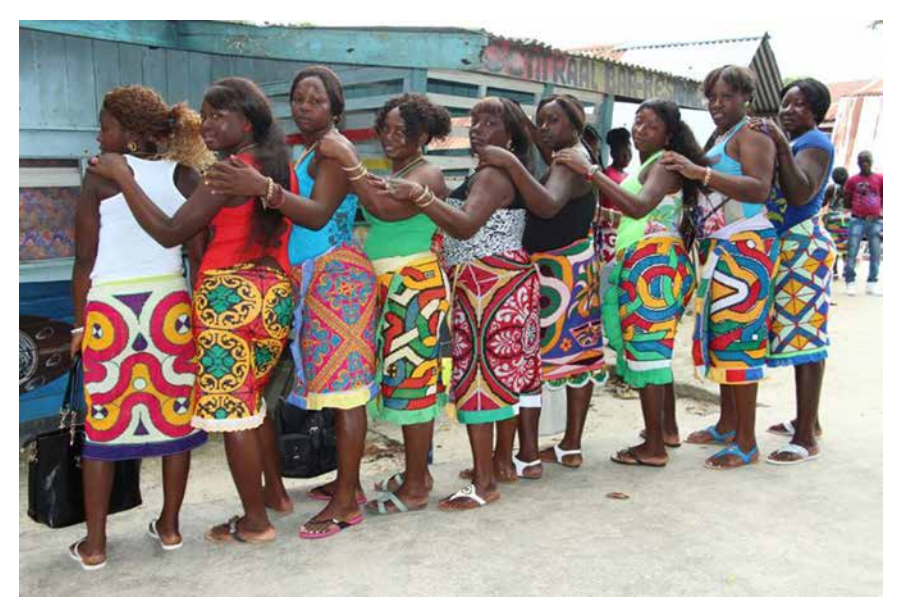
Figure 5.3 Maroon women showing off the latest fashion, wrap-skirts sewn in crossstitch embroidery. (Photo posted on Facebook in 2015 by Steven Alfaisi.)

Saamakatongo, based on the responder's own often-impromptu spelling. Daily postings of people posing for the camera constituted a rich scrapbook of new styles and novel kinds of garments that could then be followed up by emailed questions. And Google searches for "Maroon clothing" led to lively YouTube videos and sites devoted to Maroon cultural events and beauty contests.<sup>27</sup> It became clear that Western promoters upped the sensationalist nature of some of the showmanship, but the embroidery designs and techniques were the women's own.