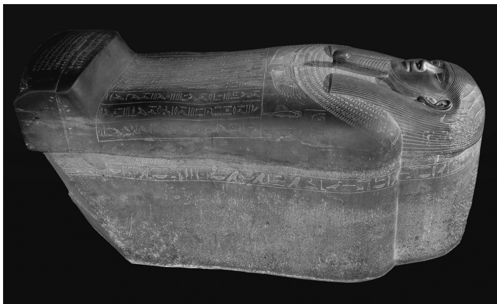
Figure 20.2 Anthropoid amphibolite sarcophagus of King Tabnit of Sidon (c. 525–475 BCE), containing his mummified remains. Istanbul, Topkapi Palace Archaeological Museum 800.

Other aromatic woods have been recovered in both inhumation and cremation burials from the first-millennium BCE central coastal Levant. The burial of the late sixth- to early fifth-century BCE King Tabnit of Sidon in his famous re-inscribed anthropoid sarcophagus (Figure 20.2) 26 saw the king’s mummy or semi-preserved corpse tied down to a wooden plank the length of the body, no doubt intentionally selected for its royal role. Several other sarcophagical burials in the same necropolis produced similar wooden planks, perforated by holes. All these were identified by the nineteenth-century excavators as made from sycamore wood (Hamdy Bey and Reinach 1892: 147). 27 It is unclear on what basis this identification was made, and to my knowledge this has not been confirmed by more recent scholarship. 28 But if these purpose-made wooden corpse platforms were indeed made from sycamore, this term might (even in modern times) refer either to the Platanus orientalis or Ficus sycomorus , both of which are native to the region, large enough