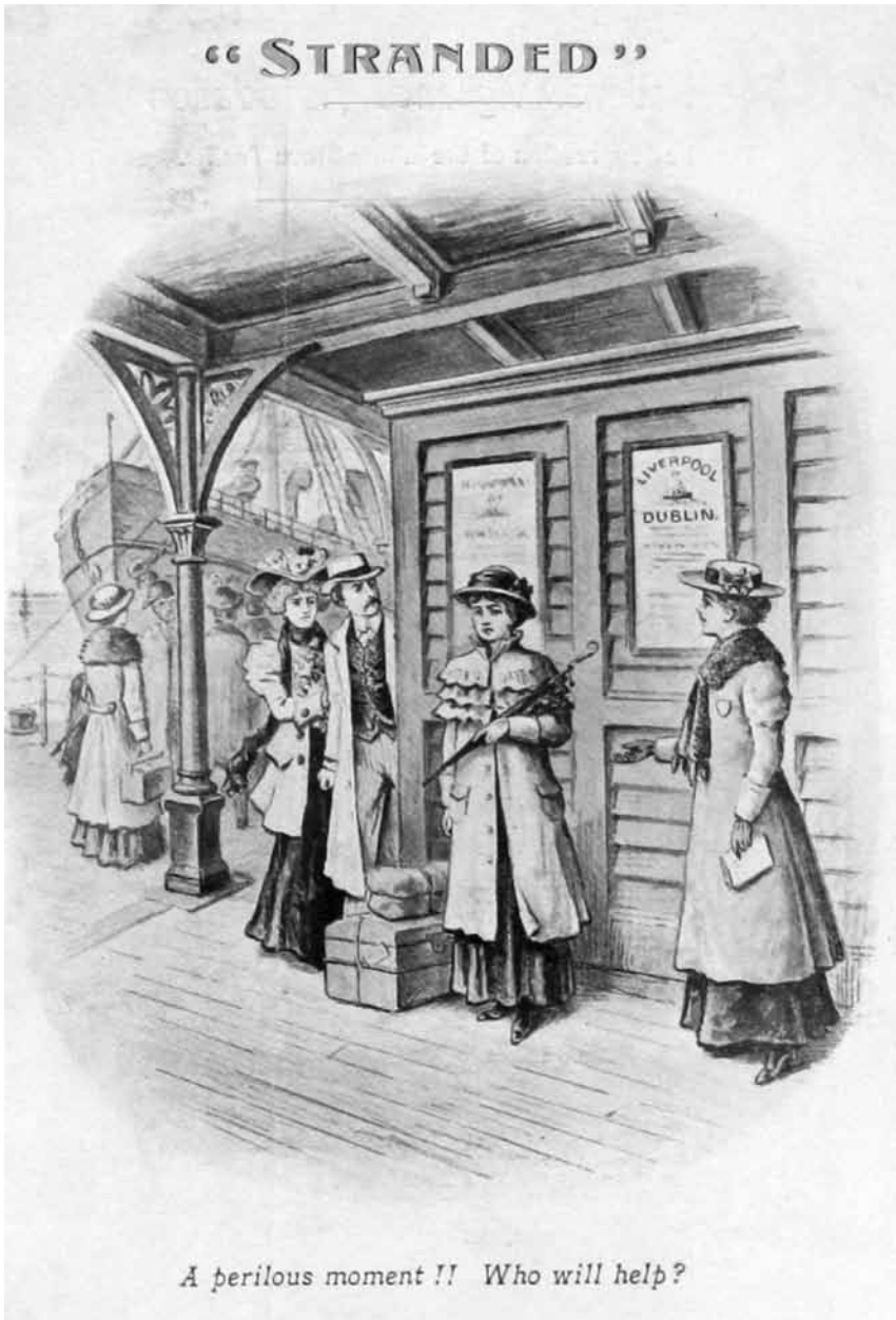
Figure 2 'Stranded': National Vigilance Association Charity Dinner Pamphlet, November 1908 (Liverpool Record Office, Liverpool Libraries)