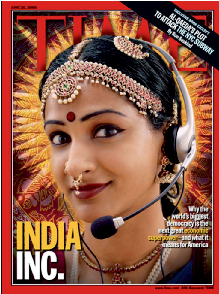
Figure 1: Cover of June 26, 2006, Time Magazine featuring an Indian classical dancer as a call-center worker.

In this chapter, I take a closer look at the affective logics that have crystallized around the now iconic Indian classical dancer. I refer to her as a modern courtesan to capture the gendered and heteropatriarchal imperatives that have situated her as a global emblem of a transnational Indian identity, particularly in democratic and pluralistic North American settings. Culling together ethnography, film and media analysis, and feminist critiques, I trace the cultural formations which connect the romanticized Hindu temple dancer to the modern