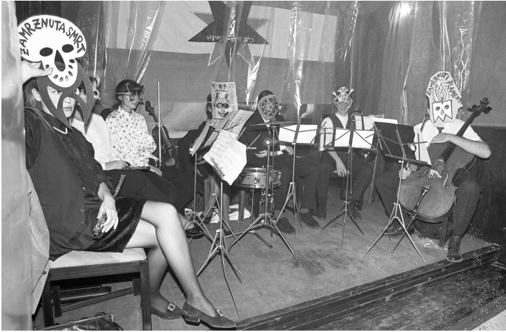
Figure 1: Led Art collective, New Art Forum ensemble for contemporary music, and Mikrob, Potop (Flood), 1993, performance, Novi Sad. Photo by and courtesy of Vesna Pavlović.

radio audience increased significantly, and people realized that anyone could contribute.