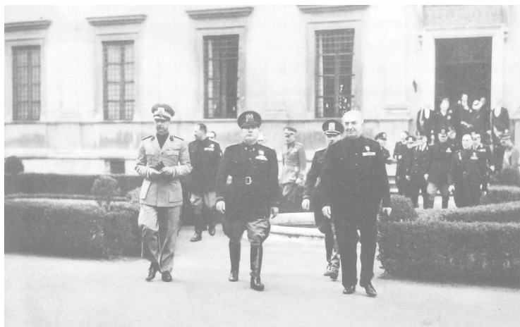
Figure 2: Guests, led by the president of the Academy of Italy Luigi Federzoni (right) alongside Mussolini (center), moving towards the concert in the gardens of the Villa Farnesina.