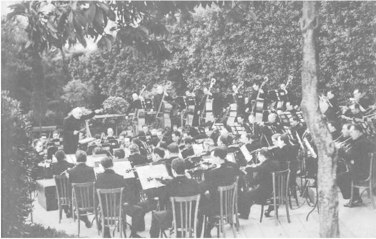
Figure 4: Orchestra of the Accademia di Santa Cecilia under the baton of conductor Bernardino Molinari.

massacre of French troops by Sicilian patriots (which is already announced in the overture by the thematic choice). A few days before Italy's invasion of France, the parallelism was explicit, although not exploited by the press.