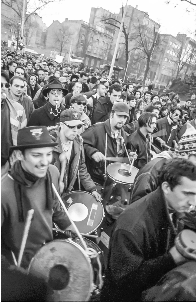
Figure 2: Student protests, 1996, Belgrade. Photo by and courtesy of Vesna Pavlović.

performance of the Symphony for Whistles, Trumpets, and Drums directed by the composer Zoran Hristić in the closing ceremony of the civil and student protests. 71