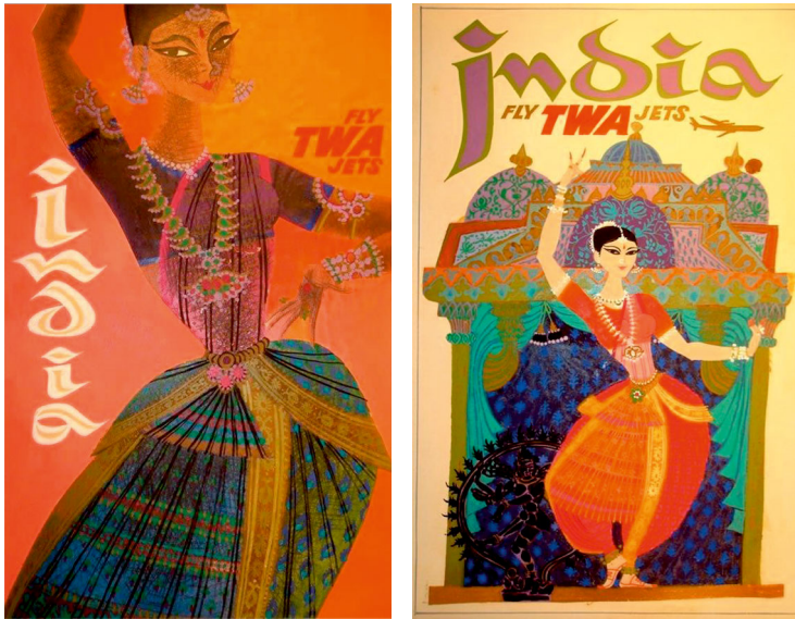
Figures 2 and 3: Trans World Air advertisements (1960s) featuring a female Indian classical dancer as a symbol of Indian tourism. Artist credit: David Klein.

both in India and in all the spaces and places where India is evoked. 13 The Indian classical dancer and her counterpart in film cultures has animated and mobilized identity politics in ways that have become increasingly urgent with the ascendance of the Hindu nationalist Bharatiya Janata Party (BJP), led by Prime Minister Narendra Modi and his rhetoric of “India First.”