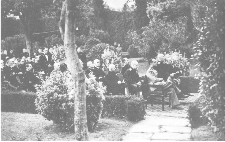
Figure 3: Guests (including the Duce, in the front row) attending the concert performed by the orchestra of the Accademia di Santa Cecilia in the gardens of the Villa Farnesina.

Listened to by the Duce with “keen interest,” 34 Luzio’s speech ended on a nationalist tone, declaring that the ceremony was an “omen of power, of glory to which the renewed nation yearned.” 35 The guests then viewed the exhibition and attended a brief concert in the gardens of the Villa Farnesina with the orchestra of the Accademia di Santa Cecilia under the baton of conductor Bernardino Molinari—a fundamental figure in Roman musical life whose enthusiasm for fascism was well known.