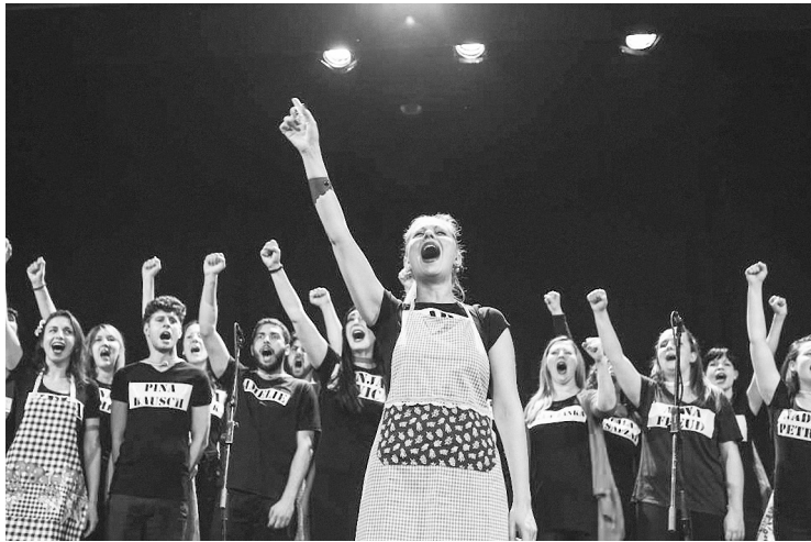
Figure 4: Horkestar on regional tour: Festival of self-organized choirs, 2018, performance, Zagreb.

Similar choirs were also formed throughout the region, including the lesbian-feminist choir Le zbor in Croatia in 2005, Prrrroba made of ex-Horkeškart members in Belgrade in 2007, the female choir Kombinat in Slovenia in 2008, Raspeani Skopjani in Macedonia in 2009, the lesbian-feminist choir Le wHore in 2010, and the anti-fascist choir Naša pjesma (Our Song) in 2016 in Belgrade. These self-organized collectives have been more than choirs; as creative platforms, they have been carrying and spreading socially engaging messages, calling for solidarity and humanity, stressing the importance of musical association and the (out-)loud expression of resistance and social criticism.