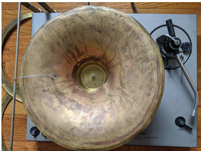
Fig. 4. Setup for encyclical .

Because both flotsam and jetsam have fairly static textures that evolve slowly over time, I was able to elicit many near-equivalent sounds from the revolving bell flare assemblage. The airy textures of jetsam were almost identical to the bell flare “played” by a very thin strand of metal just brushing the surface. With strands of increasing rigidity and girth, the more dynamic jetsam textures emerged, including the shrieking and screeching, which were nearly indistinguishable from sharp metal springs applied forcefully to the revolving bell flare. flotsam proved more difficult, and yet with a combination of similar provocations and the addition of a superball — apart from the turntable, the only part of the setup not derived from a pre- or de-constructed trombone — I was once again able to find sonic textures that made the new flotsam duo sound like the old.