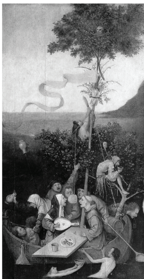
Fig. 1. Detail from Hieronymus Bosch, Ship of Fools (1490–1500)