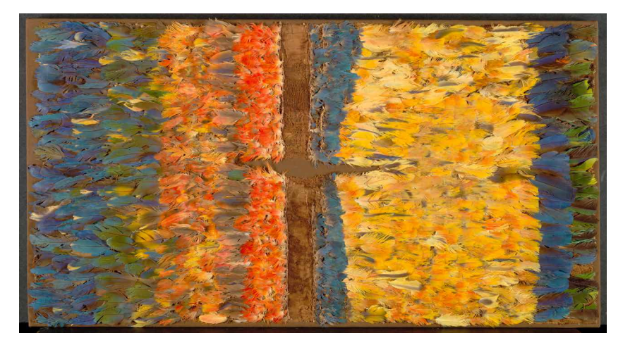
Figure 5 Feathers sewn to cotton tabby ground, Andes, c. pre-sixteenth century. The Cleveland Museum of Art, accession number 1992.105 (CC BY 4.0).

to his use of Indigenous guides, Knivet survived in Brazil through varying levels of collaboration and coercion. He was often entirely reliant on the decisions of local guides or regional leaders (headmen) for food and shelter, and adopted Indigenous strategies for his own survival. Living among the Tupi-speaking Tamoios for eleven months, Knivet recalled going 'naked as the Canibals did' and saved himself from wild animals with the 'knife, that I had about my necke tyed with a string, as the Canibals use'.<sup>14</sup>