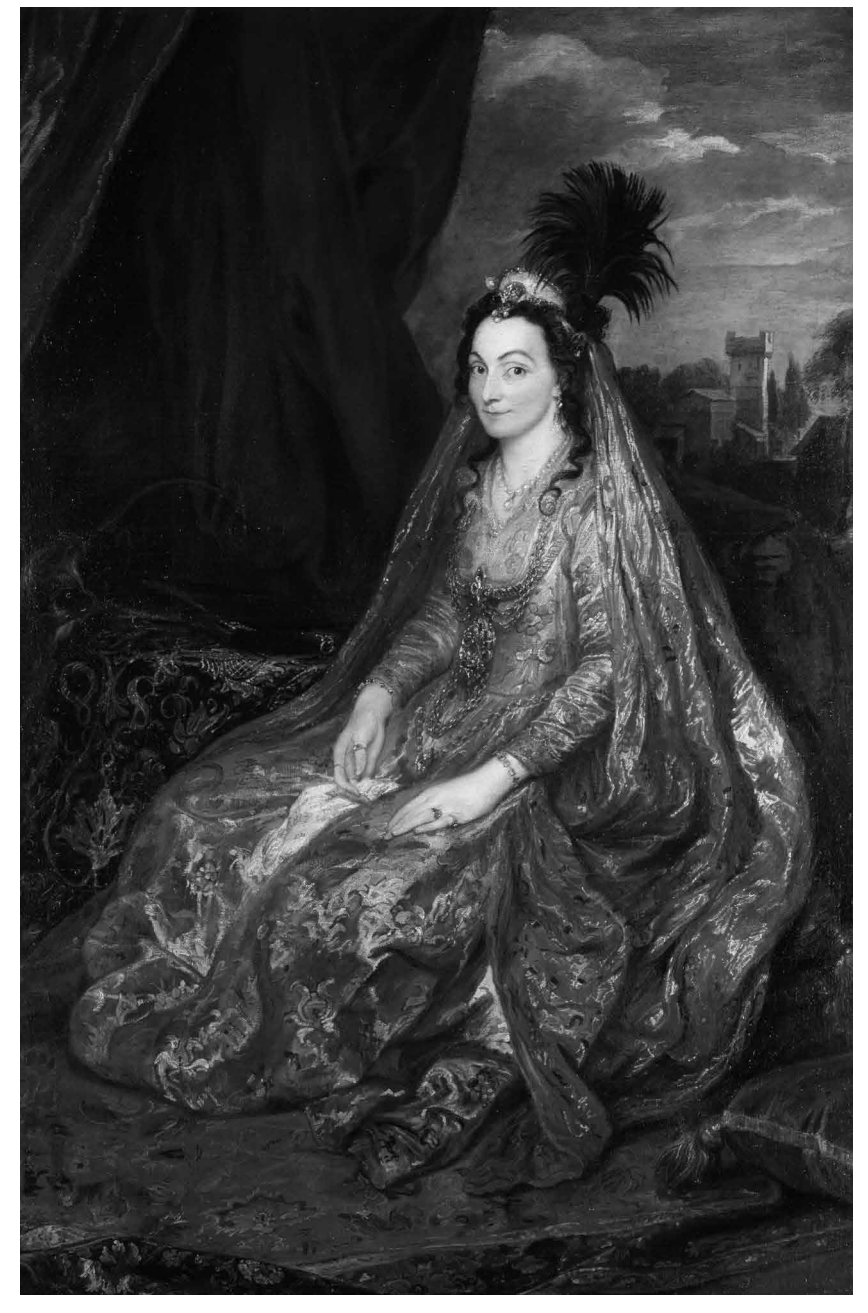
Figure 8 Teresia Sampsonia, Lady Shirley by Sir Anthony Van Dyck (c.1622).