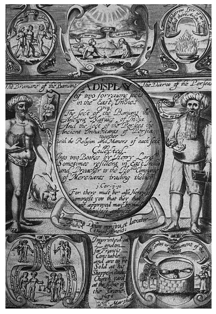
Figure 6 Henry Lord, A Display of Two Forraigne Sects in the East Indies (1630). Exeter College, Oxford.