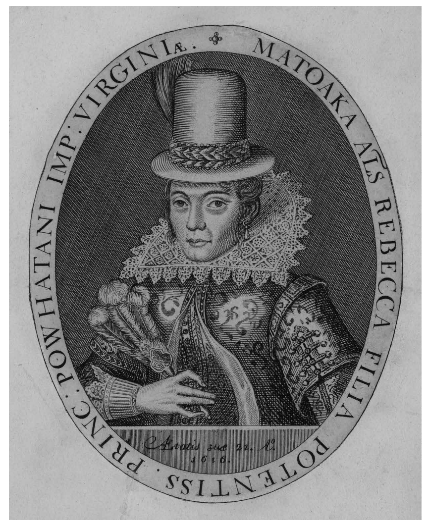
Figure 9 Pocahontas/Matoaka by Simon van de Passe (1616). Reproduced in The Generall Historie of Virginia, New-England, and the Summer Isles (London, 1624; STC 22790).

first Anglo-Powhatan war, the colonist George Percy recounted that he had been sent to 'take Revendge upon the Paspaheans [Paspahegh] and Chiconamians [Chickahominy]'.<sup>9</sup> Percy's lieutenant captured a 'queen' of