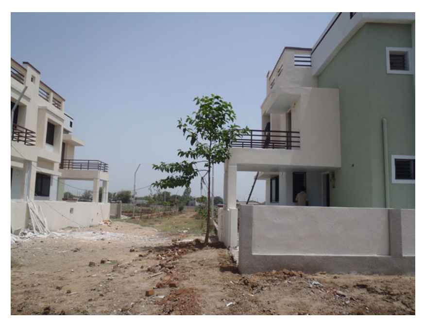
FIGURE 2.1. Sprawling outskirts of Anand, with newly constructed houses, plots waiting for development, and mostly unpaved roads.

which residents of the wider Anand district travel to visit offices and attend court. Its growth has been gradual but significant. In the 1950s, Anand was still the size of a village, with a population of 25,767 residents (Thakar 1954). By 1962, the town had grown to an estimated 40,000 residents. Thereafter, according to census data, the population kept growing gradually, to 83,936 in 1981 and to 198,282 in 2011. As the town grew, it turned into a sprawling urban conglomerate that now includes several adjoining villages and various newly developed residential and commercial areas. This "Urban Agglomerate Anand," as it is referred to in the census, had a population of 288,095 in 2011. (For an overview of the town's growth since 1991, see table A.06).