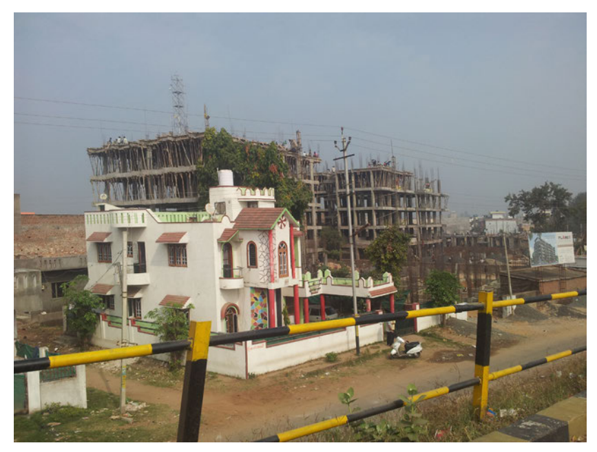
FIGURE P.1. View from the overpass, Anand.

(which, I learned later, are the temporary homes of temporary laborers—both Hindu and Muslim—working in Anand's thriving construction industry).