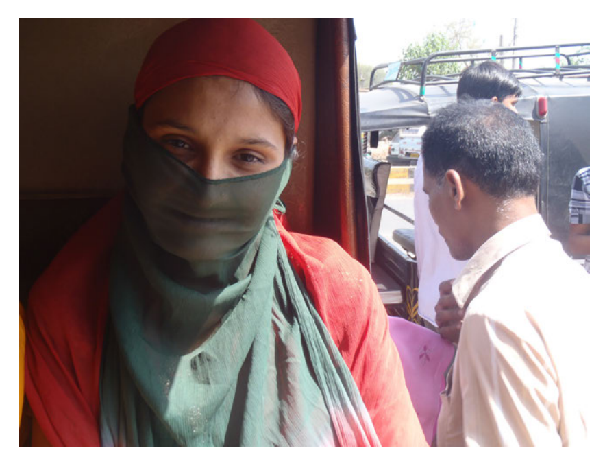
FIGURE 4.1. Resident of Anand traveling to the nearby town of Petlad in a shared autorickshaw, face covered with a dupatta to protect against dust on the road.

THESE SCENES FROM a day of travel-along research demonstrate that urbanization and residential segregation have not erased the possibilities of maintaining economic and social links with people and places in the wider region of Charotar. For landed business families like these, members of an urbanized Muslim community in Anand, their occupations remain closely tied up with the surrounding region, and with various social networks. Their investments also symbolically reaffirm a link to the land itself, so that the everyday rural-urban exchanges of the landed business families can also be regarded as a concrete substantiation of Vohras belonging to the Charotar region.