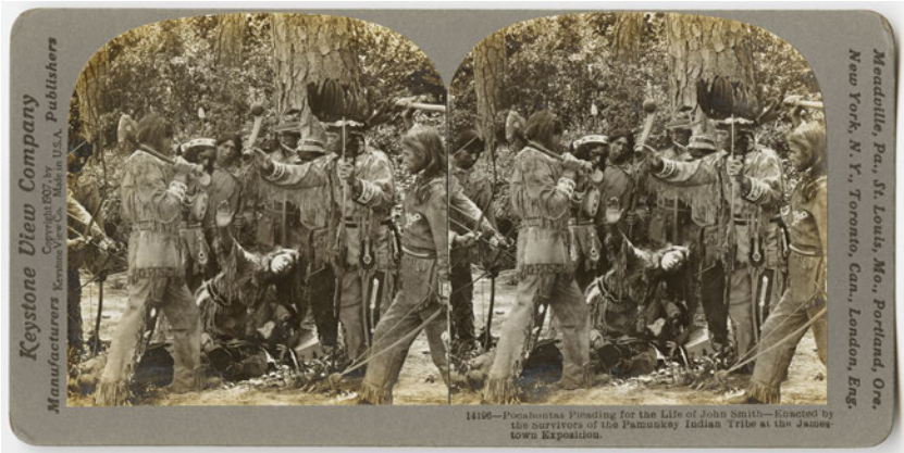
FIGURE 3. Stereocard image of the Pamunkeys' performance of "Pocahontas Pleading for the Life of John Smith" at the Jamestown exposition, 1907. Published by the Keystone View Company.