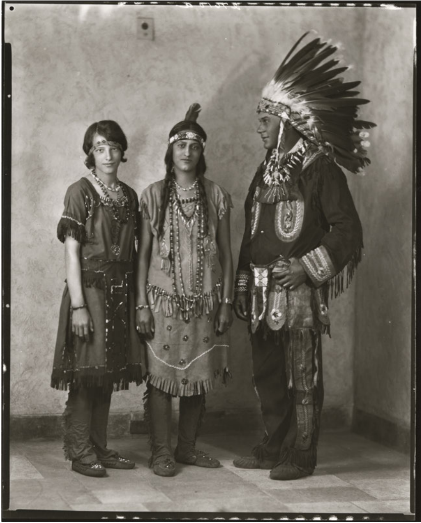
FIGURE 2. Pamunkey Indian Group, The museum notes that this photograph was most likely taken on the same day as 2002.645.27.