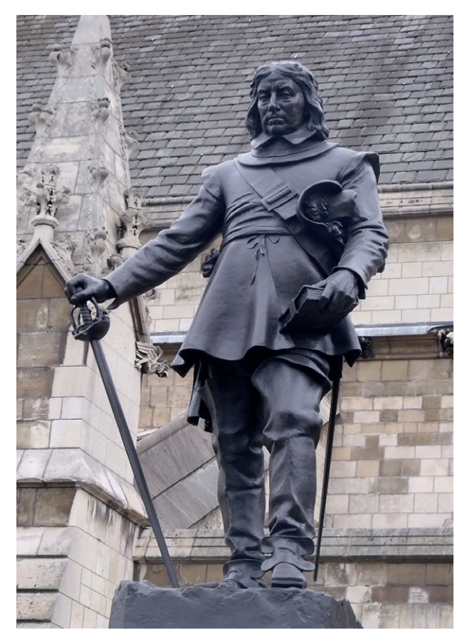
Figure 12.2. Statue of Oliver Cromwell outside the house of commons, Westminster, designed by Hamo Thornycroft and erected in 1899.

This may be the reason for the O.D.N.B. 's success as a preeminent source and tool for research – that it was planned as a synthesis of views, old and new, respectful of its inheritance though never flinching from contemporary judgement. Matthew told contributors to be 'wise, liberal and just', not iconoclastic and revisionist for their own sake. Of course, it is easier to deal with changing historical interpretations in print than it is when those interpretations are captured once and for all time in oils, or stone, or in a photograph. The depth and subtlety so obtained in an extensible work of replaceable words, and at such length, is impossible to achieve in mute images, representations and objects which thereby incite more extreme responses. But the hybrid nature of the O.D.N.B. , the balance that it has found between past and present interpretations, gives some indication of the spirit required in other areas of public life. Commemoration and memorialization must reflect history and biography as understood then as well as now. We should respect and keep faith with the views of previous