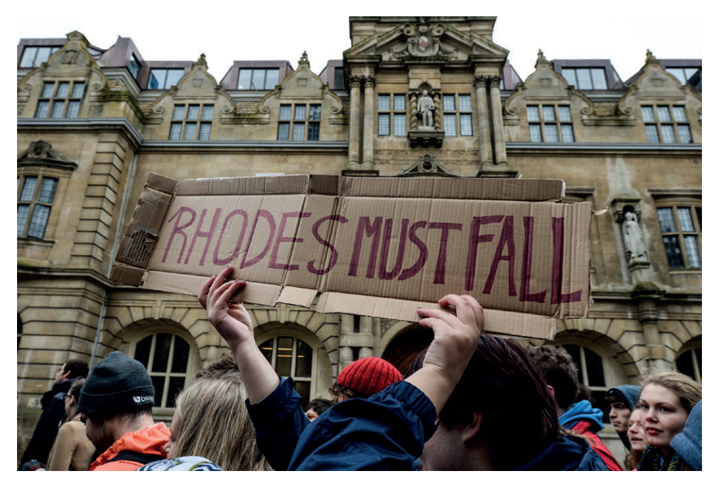
Students campaign against the decision of Oriel College, Oxford not to remove the statue of Cecil Rhodes from its High Street facade, 9 March 2016.