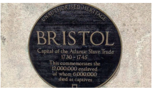
Figure 12.1. Statue of Edward Colston by the sculptor Edward Cassidy, erected in The Centre, Bristol, in 1895, and the 'unauthorised heritage' plaque affixed to its base which remembers the millions of victims of the Atlantic slave trade.