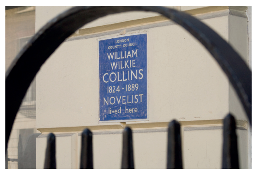
Figure 11.2. Wilkie Collins was rejected for a blue plaque in 1910 after the clerk of the L.C.C. advised that his writings were 'not of a high order'. His reputation having revived, his rectangular plaque went up in Gloucester Place, Marylebone, in 1951.

Other changes of emphasis over time have affected the number of plaques to women and to figures belonging to minority ethnic groups. It is perhaps unsurprising that only four of the original thirty-five plaques erected by the Society of Arts were for women. More startling is the fact that as early as 1907, this imbalance was perceived as enough of a problem by the L.C.C.'s chief clerk Laurence Gomme for him to write a paper listing some of the notable women who could be commemorated – and some of them were. Even today, the proportion of women commemorated accounts for just 13 per cent of the overall total; this compares with 10 per cent included in the Oxford Dictionary of National Biography, as revised in 2004. The first person from an ethnic minority to be commemorated with a blue plaque was Mahatma Gandhi, in 1954; twenty-five years later, just four others had joined him. Under the G.L.C. in the mid 1980s, this rapidly doubled, and subsequent collaboration with the Black and Asian Studies Association helped to take numbers into the twenties. The current total of plaques to black and minority ethnic figures is thirty-four, which accounts for less than 4 per cent of the overall total: efforts to boost the number of nominations in this area are ongoing.