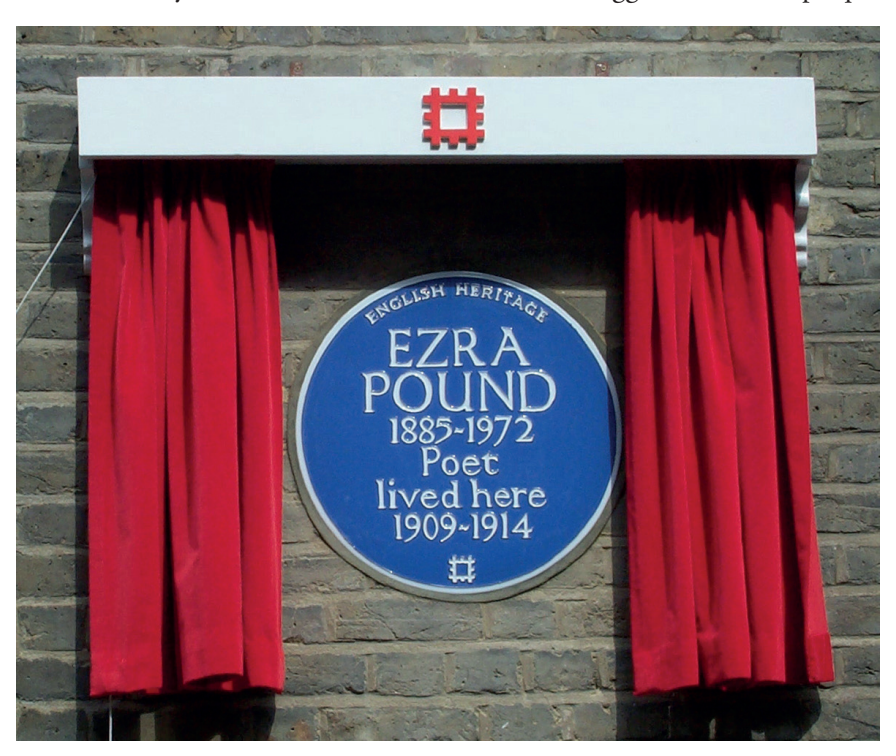
Figure 11.3. The unveiling of Ezra Pound's plaque in Kensington Church Walk took place in 2004.

The case of Ezra Pound, whose reputation as a poet presently appears unassailable, is more complex. He was first considered for a blue plaque in 1988 by English Heritage, who considered that 'in view of Pound's involvement with Fascism and his support for Hitler and Mussolini, it was too soon to take a dispassionate view of the case for commemoration'. In 1999 it was decided that despite the 'severe stain on his character ... his significance as a major poet of the 20th century was sufficient to justify commemoration'. A plaque to Pound duly went up in 2004 at his former home in Kensington Church Walk. The case is illustrative not only of the need for well-informed consideration of evidence, but of the importance of the passage of time arriving at a dispassionate assessment of historical significance. It was a point that was understood from the early years: in 1903 Lord Rosebery, former chairman of the L.C.C., suggested that no plaque