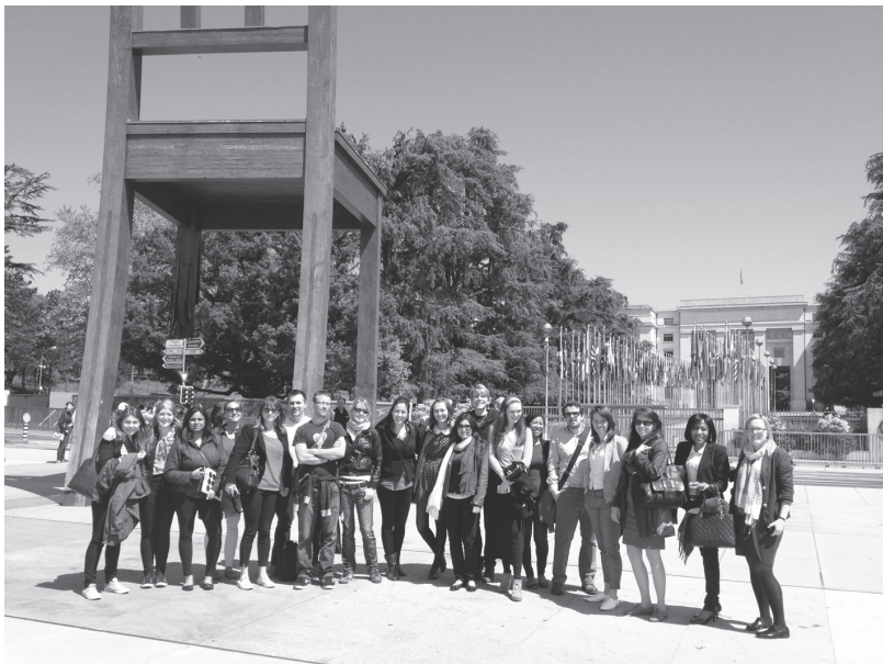
Student field trip to Geneva, 2013.