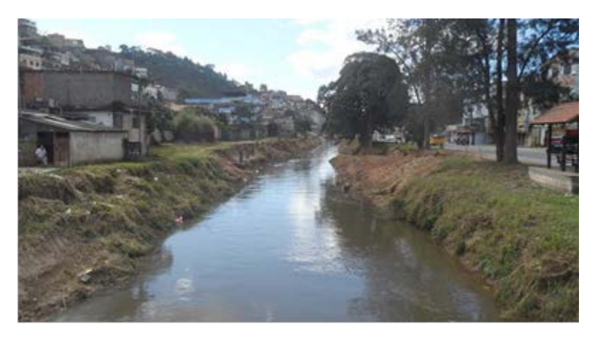
Figure 1: Looking north, the straightened River Bengalas in Nova Friburgo, 2013, with the homes of Rua Ferroviária on its western bank.

It can thus be argued that, rather than the homes of the Rua Ferroviária lying too close to the river – thus placing them at high risk of serious flood – the inverse is true: the river now lies too close to the homes. While repeated canalisation and alteration of the river course had been taking place in Nova Friburgo's centre since the early days of the settlement, its meanders through this northern end of the city were not removed until the Vargas regime of the 1940s, when it was redirected into a purpose-built canal through the centre of the valley, with the railway (and accompanying houses) to its west (see Figure 1). Industrial and road development followed, with the river eventually pushed close enough to the Rua Ferroviária for its residents to be deemed directly 'at risk'.