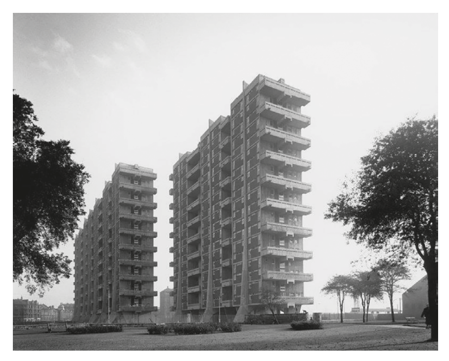
Figure 9.1. Queen Elizabeth Square pictured shortly after completion in 1965.

in the original. There was no children's play area and no 'kickabout' for football (small red ash pitches found in many of the housing estates in Glasgow). There was a play area across a busy road from the blocks and another more 'modernist' playground within the wider housing estate.