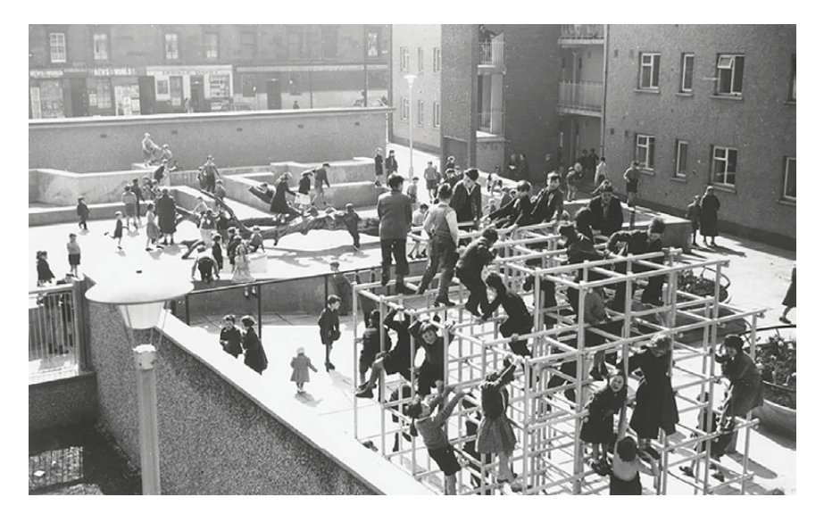
Figure 9.3. 'The jumps', a 'modern' experimental playground.

As children outgrew this traditional playpark, they would travel further afield and play at 'the jumps', a planned play area in another part of the redeveloped Gorbals. The play equipment closely resembled the sort of modernist play areas found in post-war housing estates across the UK.<sup>75</sup> The architectural profession increasingly took into account the changing attitudes to child development and the importance of play. Playgrounds like 'the jumps' arguably provided a safe space for children to build resilience in terms of 'risky' play, which Hurtwood suggested was essential for children.<sup>76</sup> Paul remembered 'the jumps' creating what he described as 'a sense of bravado' and compares it with parkour, suggesting that the children became 'like acrobats'. Crucially, the jumps enabled the children to take risks and challenge themselves: 'Go on – do it – do it – jump it – and you did'.<sup>77</sup> In contrast to Jephcott's findings that children were not keen on static play equipment, according to Paul the children of the