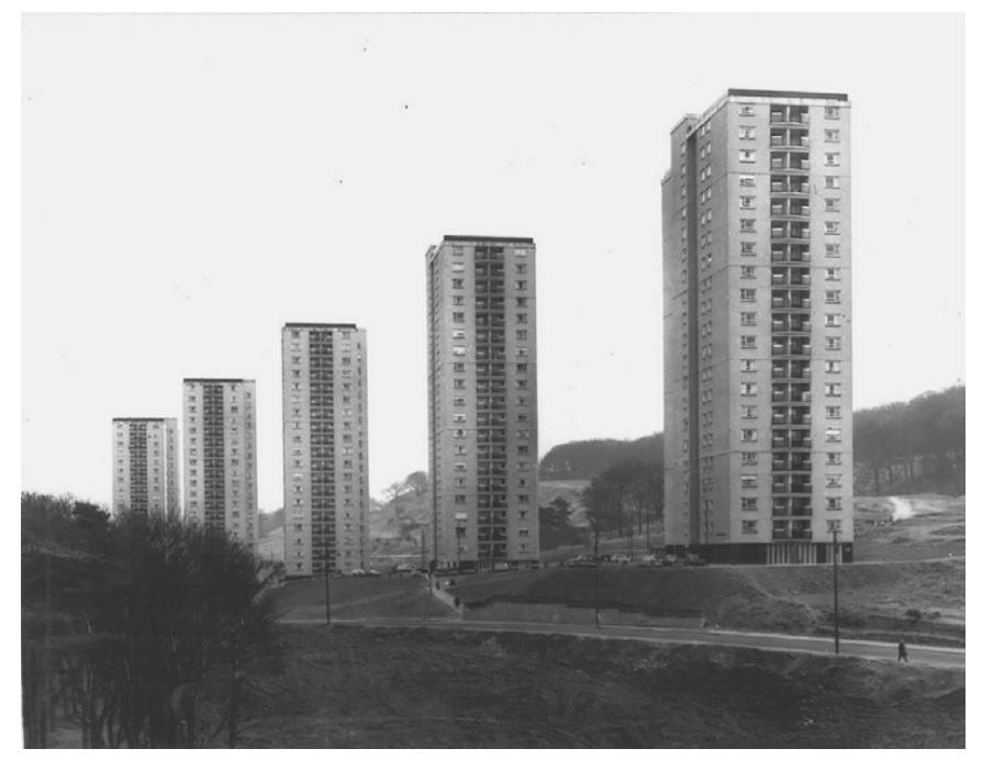
Figure 9.2. Mitchellhill in Castlemilk.