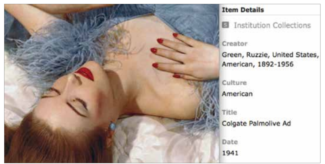
Figure 1. Example of an image and associated metadata elements