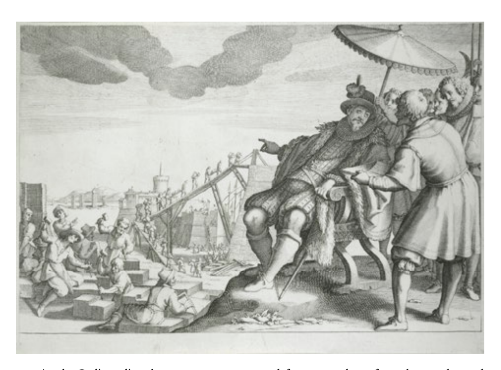
Fig. 5. Jacques Callot, after Matteo Rosselli, Fortification of the Gate of Livorno by Order of the Grand Duke, Harvard Art Museums/Fogg Museum, Gift of William Gray from the collection of Francis Calley Gray, by exchange, Photo ©President and Fellows of Harvard College, S3.91.2

As the Italian elites became more removed from actual warfare, they embraced ways of incorporating a martial aesthetic within their clothing. The popularity of the codpiece was an early manifestation of this phenomenon and a striking conjunction of the martial and hypermasculine. It has been noted that its prominence was relatively short-lived but its heyday in male fashion coincided with other celebrations of warfare and male muscularity in the visual arts and festive life. By the mid-seventeenth century, however, the Medici court seemed less focused on projecting its bellicose nature, perhaps a sign of the confidence of the Grand ducal regime. Equally, the courtly taste for festive war games that glorified noble participants began to dwindle and these events were increasingly replaced by more controlled military displays (Pollak 2010, 280-6). Indeed, in 1688 a publication dedicated to the Medici was deemed necessary to drum up support for the oncepopular sport of Florentine football (Bini 1688). The rise of military uniforms across Europe in the seventeenth century marked a clearer distinction between the appearances of soldiers and civilians, putting a stop to the more ad-hoc assemblage of styles that could be appropriated to express the combative powers of elite men. Fashion during the century leading up to this point is therefore noteworthy for its public promotion of the idealised masculine attributes of strength and bravery.