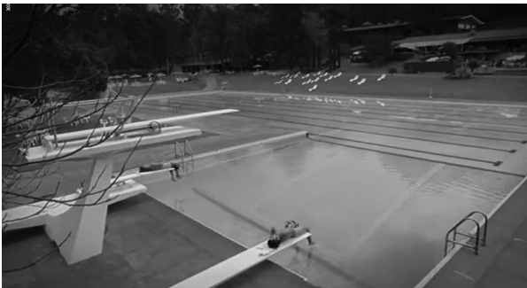
Still, Y tu mamá también

This scene is grotesque, it plays with the abject nature of semen, and it thrives on an audience knowing what a character does not. But it represents semen, that is, semen is made visible. The viewer of the film sees the semen dangling from Ben Stiller's earlobe like a long earring. In the Mexican film and box office success, Y tu mamá también , a scene includes two boys, each on his own diving board at a private club, masturbating and ejaculating into a swimming pool.