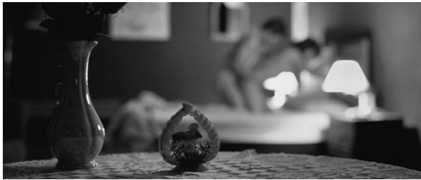
Still, Not Suitable for Sex (2012)

Viewers are witness to what Eve Kosofsky Sedgwick might call “the freshness of slow learners” (1999, p. 22). Once they begin to have sex, the sex is missionary. Stevie remains partially clothed—her polka-dot brassiere remains on. While the brassiere is undoubtedly sexy, as might be expected of the romantic comedy, it is still functional rather than merely aesthetic or erotic. The sex is quick; the scene itself lasts about 30 seconds. Afterwards they both appear sweaty, but it is clear to viewers that they are beginning to fall in love. This falling in love will be exemplified best by the remaining sex scenes, all of which happen during her period of ovulation—a relatively short window to be certain—and the sex becomes more playful and more pleasurable. They change positions, the sex is no longer, at least not only, the utilitarian reason of sex: procreation. Orgasms are achieved. Pleasure is had, an important reminder to the viewer that sex can be, and often is, pleasurable—even when procreative.