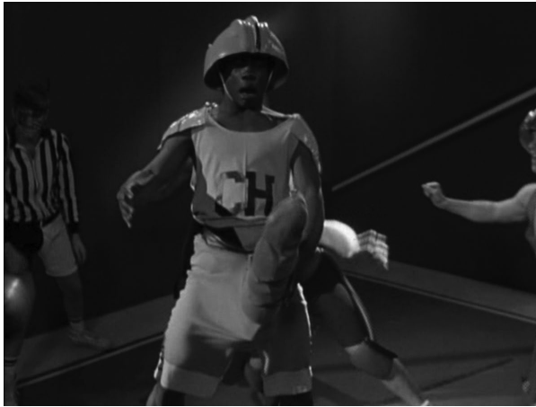
Still, Flesh Gordon and the Cosmic Cheerleaders (1990)

In Flesh Gordon and the Cosmic Cheerleaders , the explanation of the fallibility of the phallus continues. Viewers are witness to a sporting event, a cross between soccer and basketball, wherein the players use their penises to hit the ball. Their teams are replete with heroic penises that “stood high and proud.”