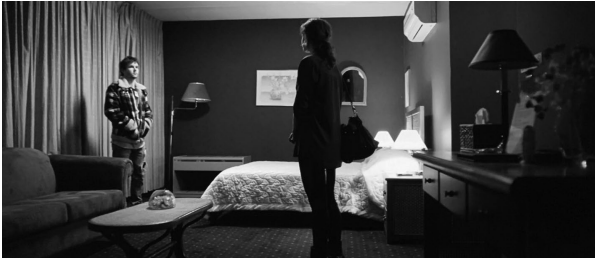
Still, Not Suitable for Children (2012)