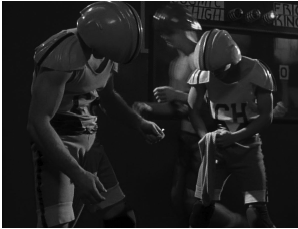
Still, Flesh Gordon and the Cosmic Cheerleaders (1990)

men could not perform their manly responsibilities. To put it bluntly all strange planet women became hornier than hell.