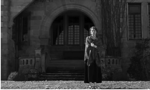
Still, Lady Chatterley (2006)

A similar image is found in Pascale Ferran's adaptation, Lady Chatterley (2006), wherein Lady Chatterley is found standing in front of Wragby. She is dressed in warm clothing and the camera has panned over the autumnal colours that stand in front of her. The branches that crawl up the walls of the home are without colour.