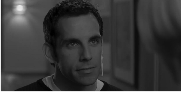
Still, There's Something About Mary

This is precisely the case in There's Something About Mary , in which Stiller's character masturbates before a first date and the ejaculate seemingly gets lost—not realizing that it is dangling from his ear. This semen is then mistaken for hair gel and is quickly applied to Cameron Diaz's character's hair.