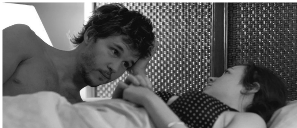
Still, Not Suitable for Children (2012)