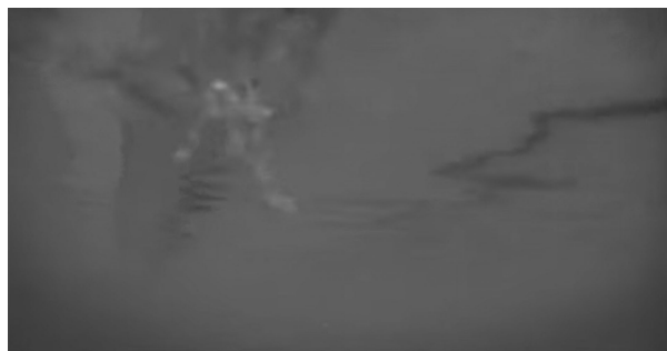
Still, Y tu mamá también