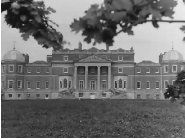
Still, Lady Chatterley's Lover (1992)

hard not to see that they are returning in the autumn and not the spring when everything returns to life. This becomes all the more telling once one has seen the film adaptation for television by Ken Russell (1993), wherein the scene of return is marked by dreariness and an overwhelming sense of brown taking up the bulk of the image, with autumnal leaves, orange and red, overhead.