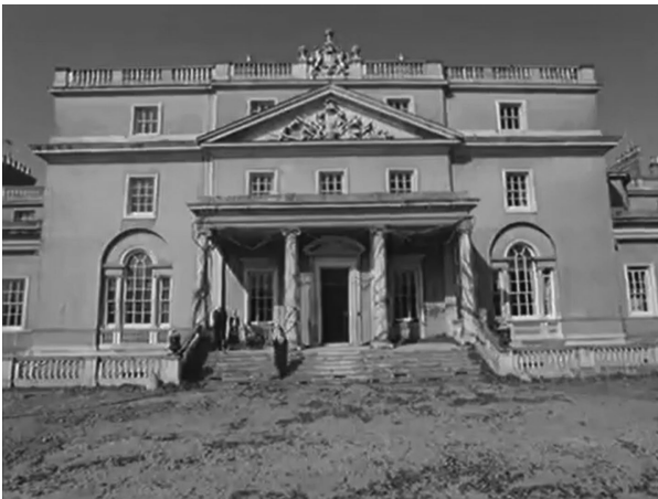
Still, Lady Chatterley's Lover (1992)

Minutes later, following a discussion amongst townsfolk about how Sir Clifford's father had died when Clifford returned home paralyzed and how it will be so tragic for the parish to no longer have Chatterleys, once more Wragby is shown as being brown, the branches climbing the pillars dead, the ground covered in refuse.