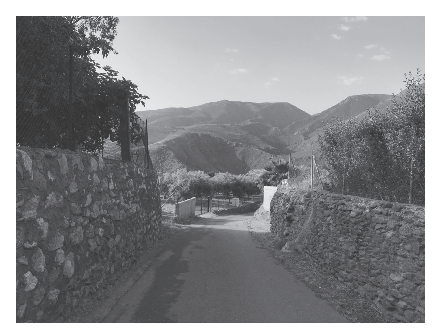
FIGURE 1: One of the roads heading out of town between farmhouses, with olive groves ahead.

friend's farmhouse, and the open-air summer discotheques. My orgiveño relatives had started a business in town, but they still kept working their small plots of land on the side. Depending on the time of year, during some visits I was able to help with the olive, orange, or almond harvests. In the huerto, sitting in a circle of local women hulling and shelling almonds, or in the kitchen brimming with blue and green accented ceramics, cooking with my father's cousin, Tia Paca's daughter whom I refer to as Tia Conchita, I took in many stories. There was the latest town gossip-Manuel up the street has accused another neighbor of stealing water by not following the rotation of water rights from the acequia, the community-operated irrigation channels—and there were tales about my father's early childhood one time at the beginning of the Civil War he was out playing in the street with other children when a bomber flew overhead and though he hid quickly the explosion sprayed shattered glass, a piece of which cut his leg. This explained why, as I had heard in Miami, while he was