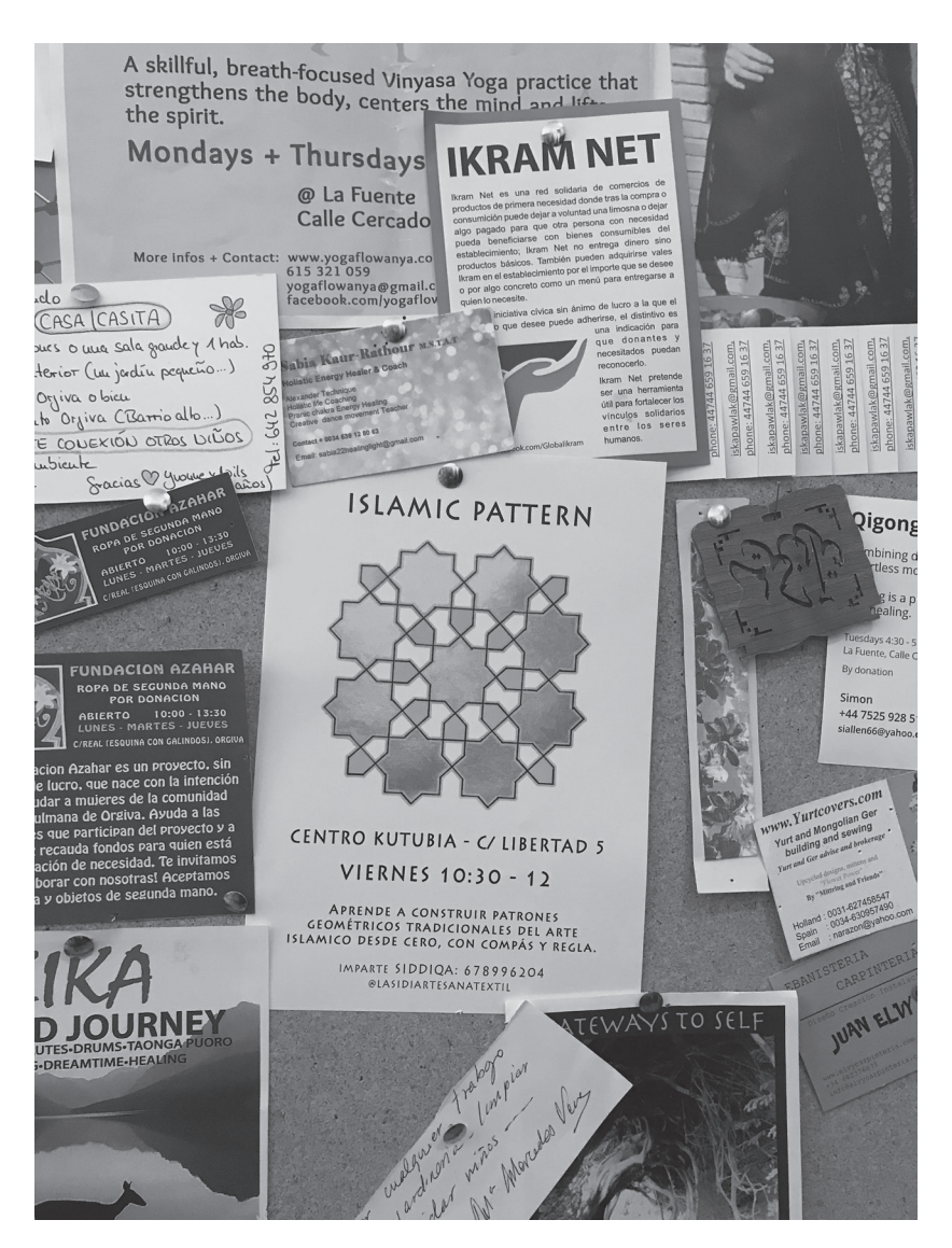
FIGURE 6: A slice of life in the "New Age Alpujarra": a detail of the bulletin board at the main halal restaurant, Café Baraka, announcing alternative and Muslim activities and services.