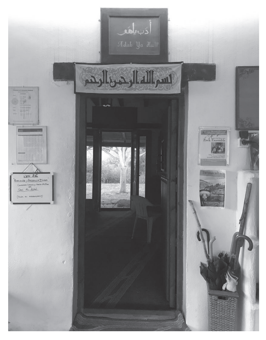
FIGURE 9: The entrance to the Sufi dargah on the outskirts of town; the flyers on the right announce a concert of Turkish Sufi music benefitting the children of Palestine, and a lecture on permaculture and the Muslim agricultural tradition of al-Andalus.