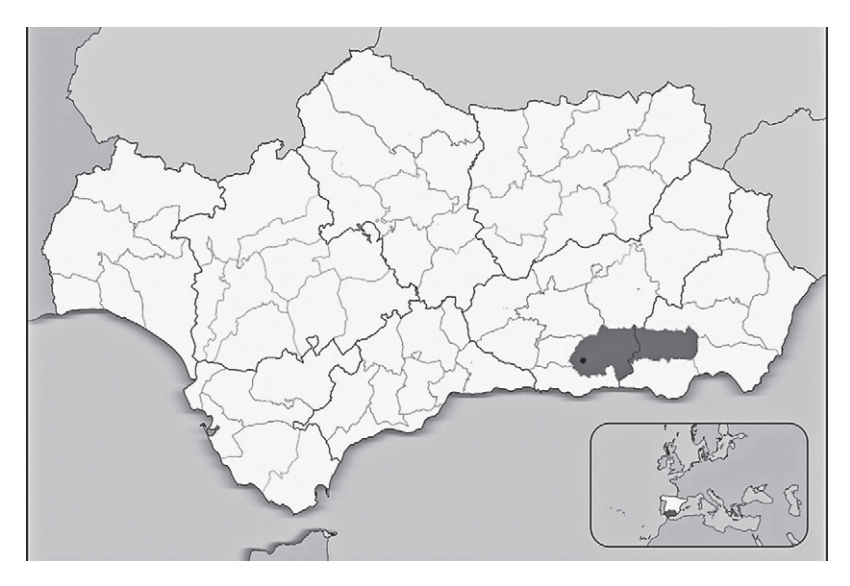
FIGURE 3: A map indicating the location of Órgiva within the Alpujarra (darker in the larger map) and Andalucía.