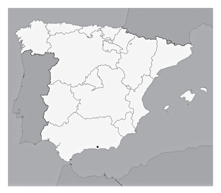
FIGURE 2: A map indicating the location of Órgiva within Spain (with the coast of Morocco and Algeria below).

The manifold narratives about Órgiva sometimes run counter to each other, but these ambivalences and contradictions reveal how tolerance is worked out and how more sustainable tolerance can be achieved. A deeper form of tolerance that is more likely to endure is based on both the recognition of mutual worthiness as human beings and of each side's compromises, interests, and types of power. The various communities that live in Órgiva are engaged in a process of assessing the gains and losses of different ways of coexisting. Although written and especially televisual narratives about the town use terms such as "tolerance" and "multiculturalism" to mask tensions and power differentials, by recognizing that toleration is an ongoing negotiation of what will and will not be accepted—of what is established as halal versus haram to use Islamic terminology—we can identify the points of contact that create robust, respect-based tolerance.