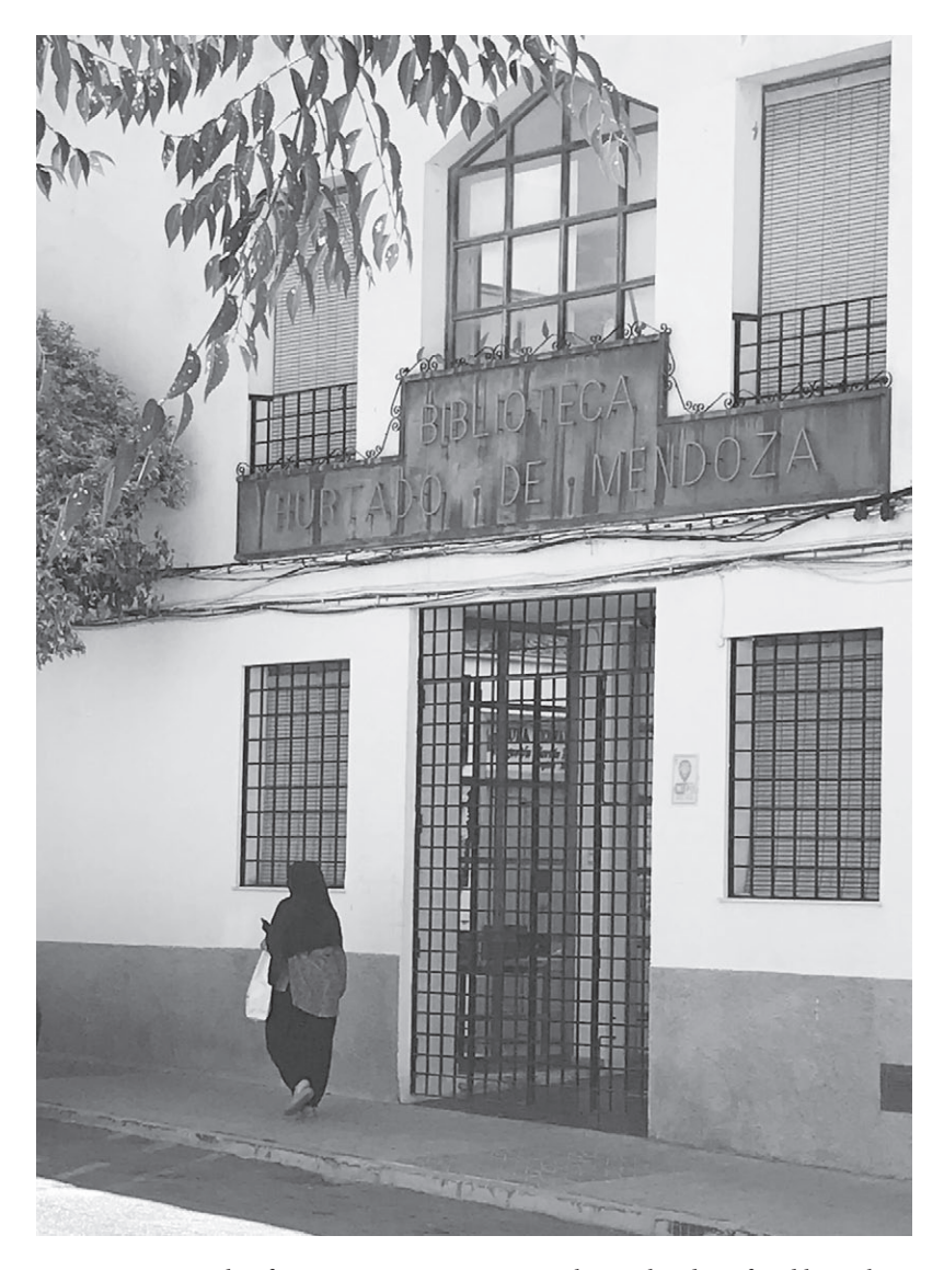
Figure 10: A North African immigrant, wearing a longer headscarf and long skirt, passing in front of the town library.

scenario would not be easily imaginable. The level of tolerant coexistence in the town is sufficient for her to imagine conversion to her family's religion as a possible, and agreeable, future for her daughters.