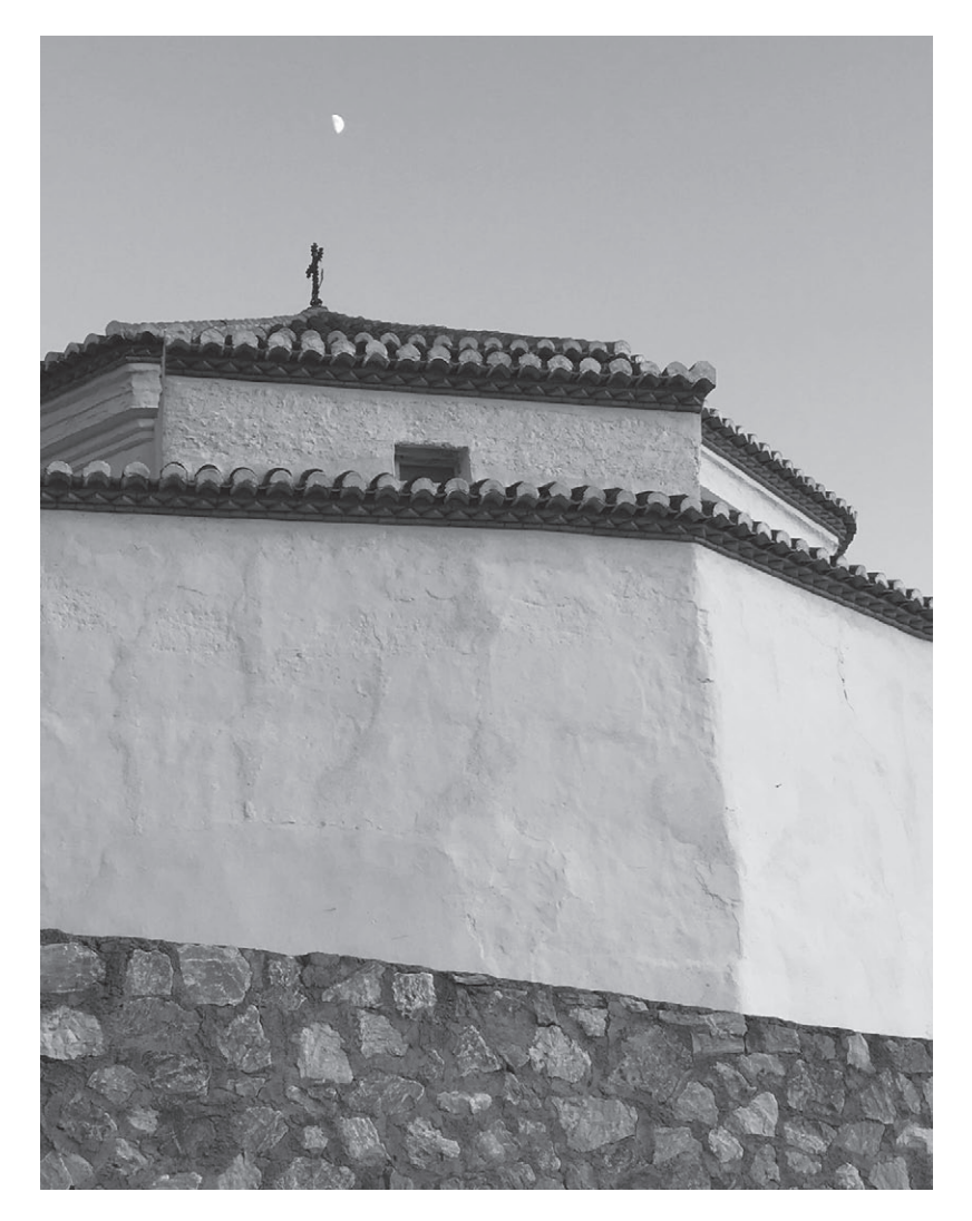
FIGURE 8: The Ermita de San Sebastián , a Catholic chapel on the edge of town that may have once been a ribat (a combination of Muslim monastery and military outpost) and some believe to be the tomb of a Sufi saint.

member of the Órgiva Naqshbandi group about whose tomb the dargah was connected to, he said that in this case dargah simply referred to a religious meeting place, and not necessarily a tomb. Another Sufi community member mentioned that the farmhouse that had become the dargah belonged to a Naqshbandi community member, who lent it