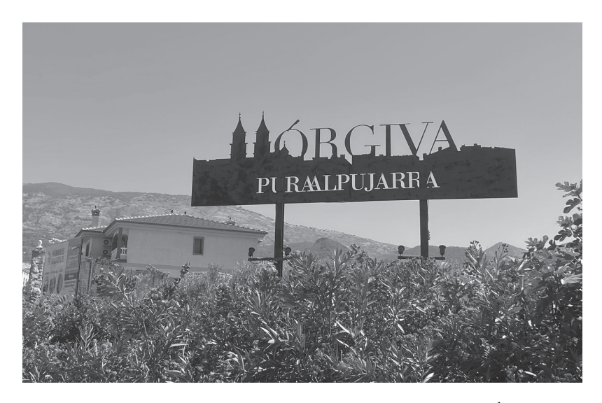
Figure 4: The sign on one of the main roads into town, announcing "Órgiva, Pura Alpujarra [Pure Alpujarra]."