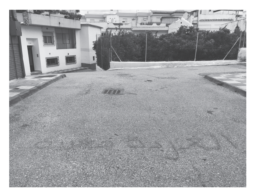
FIGURE 11: The Arabic graffiti stating "al-ghurba sa'iba" meaning "life as an émigré/being a stranger is difficult."

The phrase al-ghurba sa'iba and its variants reflect the mythology surrounding the harraga , that is, the tendency to romanticize those who make it to the other side. The risky act of clandestine migration is often presented as a bold, heroic action that is accompanied by the bitterness of having to stay away from home until one's legal status is normalized by acquiring new travel documents. The phrase glorifies the male rite of passage of clandestine immigration as a bold act that condemns the migrant to long for home in order to help his family through remittances. Those struggling in North Africa may understand the voicing of this sentiment as a warning that migration is not as wonderful a solution as it may seem to be, or they may view the difficulties of al-ghurba as a desired privilege. Either way, and for both migrants and those thinking about leaving, the phrase demonstrates that al-ghurba is an integral part of North African life.<sup>29</sup>