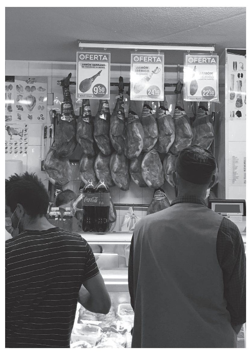
FIGURE 12: An orgiveño and a convert to Sufi Islam wait their turn at the meat counter of a local grocery store that sells both cured jamón (hanging from the wall behind the counter) and halal meat.