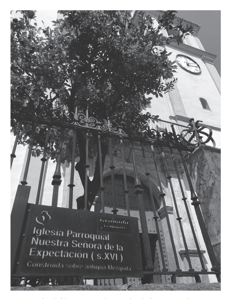
FIGURE 5: A detail of the entrance to the town church; the sign states that it was built upon a former mosque.

place in the Granada tourism sites. The main vestiges of the past in Órgiva's built environment are the church and a chapel (previously a mosque and a Muslim monastery, respectively), a modest palace, and the ruins of a Muslim fortress.<sup>29</sup> Tourism in Órgiva either caters to Spaniards and foreigners looking for easy access to nature and