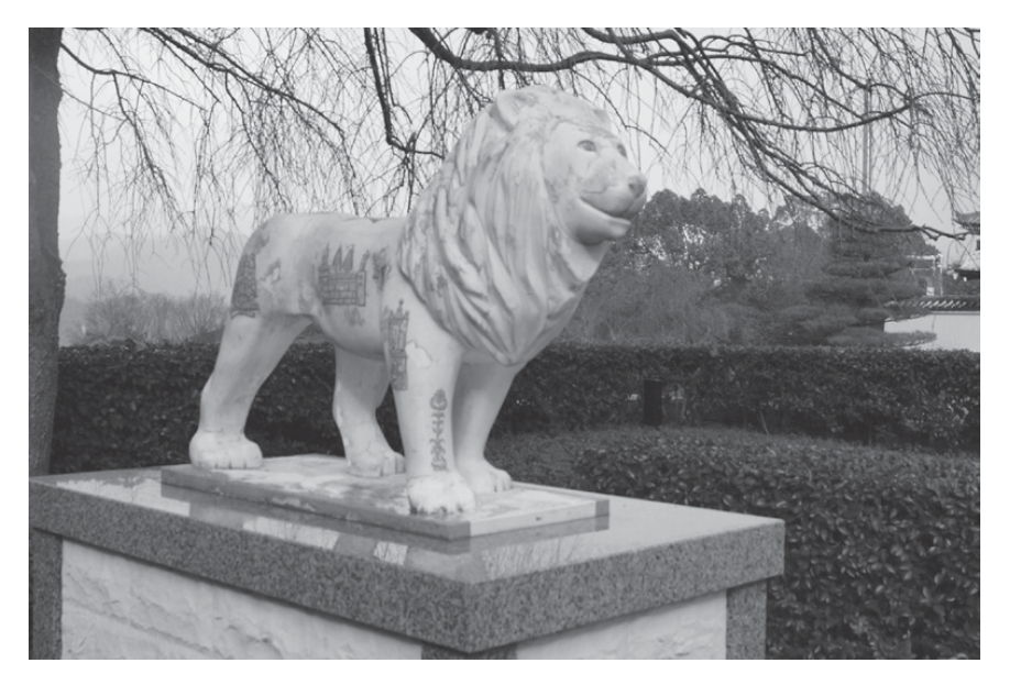
Figure 3.4 Jerusalem Lion symbolizing overseas activities and world peace.

only true and complete form thereof) will spread to the world reinforces this point. So does the presence and involvement in what are essentially Japanese rituals, of foreign dignitaries whose appearance serves to reaffirm (at least in the eyes of members) the universal stature of their movement. Likewise the sight of Agonshū leaders going to Auschwitz and Jerusalem to conduct rituals to pacify spirits and bring peace to the troubled regions of other nations through Japanese-style rituals sends out a message to members. The incorporation of motifs such as the Bhutanese Hall at Yamashina and the placing of an Agonshū stupa in Jerusalem also show how Agonshū's engagement with the world is one replete with symbolic meanings, in which Agonshū (and through it, Japan) can go out and save the world via its Japanese-centred interpretation of the causes and solutions of problems, while assimilating the wider world into Japan and domesticating it.