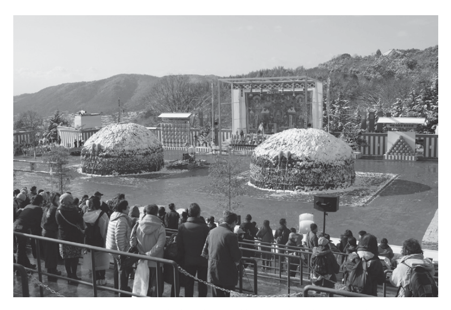
Figure 3.2 Hoshi Matsuri pyres before the ritual begins.

Central to the event are two large pyres on which gomagi are burnt in the ritual goma process (Figure 3.2). Initially there was only one pyre but as the event grew two pyres became necessary to accommodate the growing number of goma sticks. Located in the kekkai (the ritual arena, marked off by four bamboo gateways and with a huge altar on which are numerous offerings and a copy of the shinsei busshari casket) the two pyres represent respectively the realization of one's wishes ( hōshō ) and the liberation