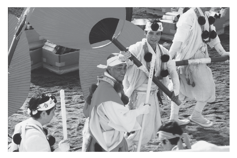
Figure 2.2 Kiriyama Seiyū performing at the Hoshi Matsuri.

members give their time to help organize the crowds, direct traffic, assist at the ritual events and look after the stalls at the site. Agonshū magazines encourage such practices by carrying reports by members who have served in such ways and who uniformly present positive accounts of their experiences while giving thanks to Kiriyama for caring for them and giving them the opportunity to do such things ( Agon Magazine 2012: 35–83). Such reports in themselves serve as internal Agonshū mechanisms heightening the founder's charisma; not only do members celebrate their participation in rituals but they view it as the result of the benevolence of their founder, who thus is even more exalted because of this generosity.