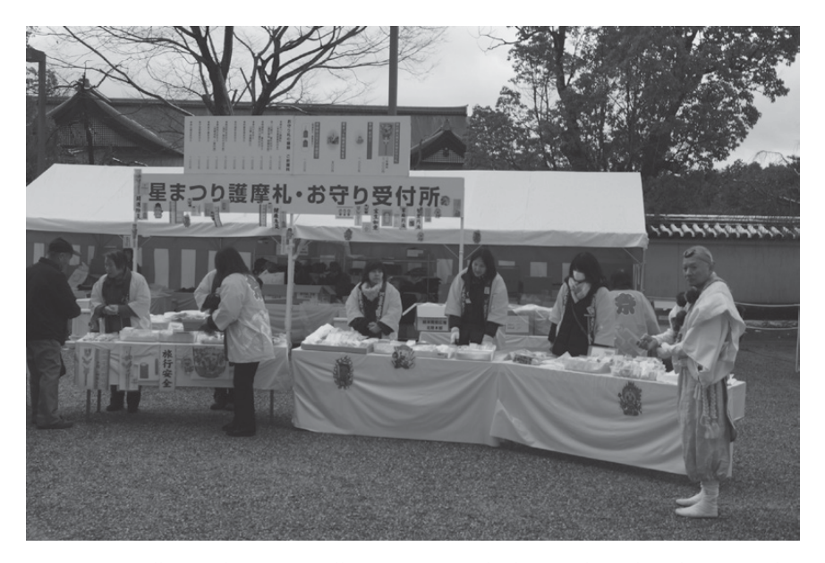
Figure 2.3 Stall at Hoshi Matsuri selling omamori and other amulets.

Such activities – along with the fees members pay for membership and to have various rituals performed (see also Chapter 3) – are nothing special to Agonshū as they are found widely at Buddhist temples, Shinto shrines and many other new religions as well. They are a reflection of the wider importance of economic activity in the support structures of religious movements and institutions. Yet, at the same time, the extent to which Agonshū has used such means and engaged in commercial activities, and combined them with others such as publicity and proselytization, clearly indicates an