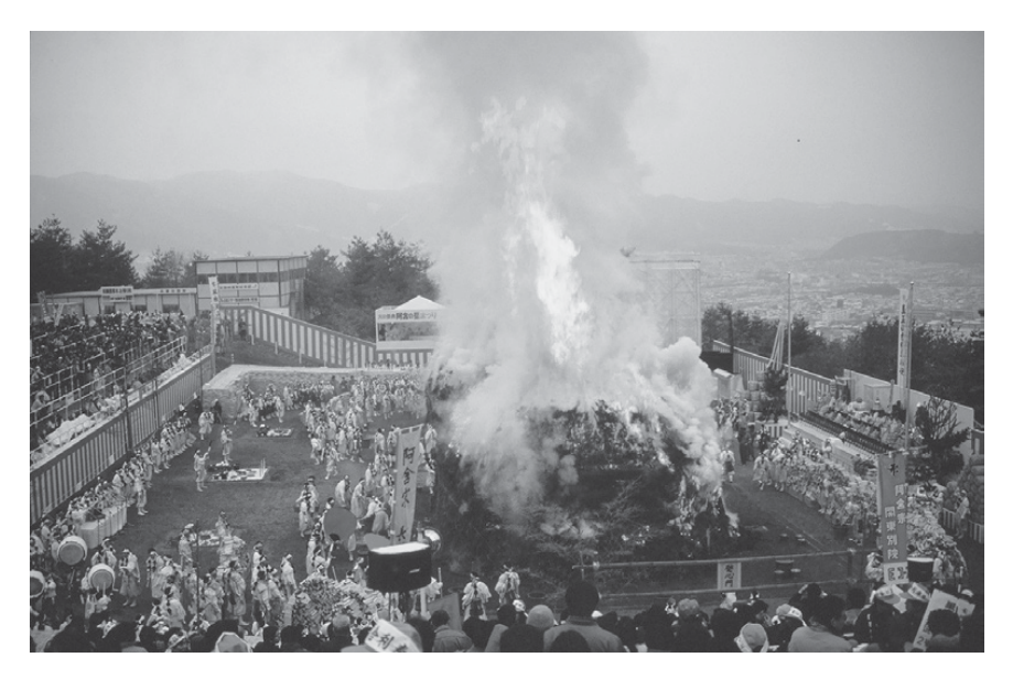
Figure 3.3 Hoshi Matsuri performance.

In the 1980s the two pyres were referred to by Buddhist terms: the taizōkai (womb world) and kongōkai (diamond world). These two realms – the womb and diamond – represent the two mandalas prominent in esoteric Buddhism that signify the potential for enlightenment in this phenomenal realm (the womb), and the practices leading to enlightenment (the diamond). These symbolic designations and meanings are indicative of Agonshū's roots in Shingon Buddhism and Shugendō, and are, according to Agonshū officials, still present even though the Hoshi Matsuri has been depicted since 1993 as a combined Shinto-Buddhist ritual.<sup>44</sup> The two pyres have subsequently