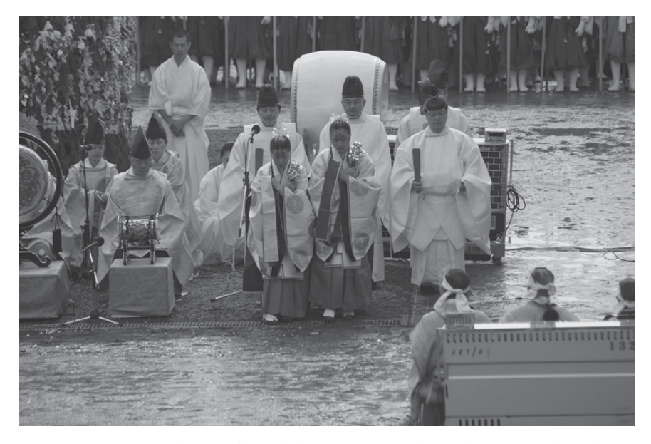
Figure 5.2 Shrine maidens ( miko ) and Shinto priests at the Hoshi Matsuri.

accompanied by music, chants and Agonshū practitioners in yamabushi garb, to the main ritual arena (kekkai). The Agonshū report thus conveyed the message that Kiriyama, although dead, was still alive and it reinforced this by using the title he had when alive. The casket containing the relics was draped in a gold cloth and before it were placed Kiriyama's personal ritual implements. The arena was covered with a layer of snow but, according to the magazine report, as the relics were brought down to it, the snow stopped, the clouds cleared and the sun burst through.<sup>40</sup> The relics were then ritually enshrined on the altar in an extended process in which Shinto priests offered prayers and invocations, Shinto shrine maidens performed traditional Shinto kagura ritual dances and various yamabushi practitioners made offerings. A yamabushi mondō (dialogue) was broadcast outlining Kiriyama's achievements in life and attributing all manner of innovations, spectacular spiritual deeds and accomplishments to him. Fukada Seia, as Agonshū's chief ritualist and kanchō, oversaw the process although, as we noted above, Kiriyama's empty chair indicated who the presiding spirit was - a point affirmed in the subsequent Agon Magazine report that stated that Kiriyama's spirit had presided over the whole affair and that everyone present had felt the spiritual power of the 'second Buddha's vibration' (Agon Magazine 2017, 3/4: 20, 34).