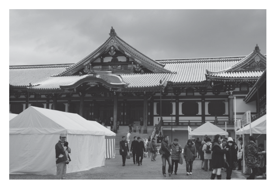
Figure 2.1 Agonshū main temple in Yamashina (Kyoto prefecture).

New movements and leaders face many challenges in trying to develop a following and spread their messages. The avenues through which they can do this, from