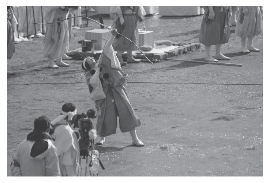
Figure 3.1 A female Yamabushi performing during the Hoshi Matsuri.

This made Agonshū attractive to women who wanted to develop themselves in spiritual terms and who were put off by the apparent gender prejudices of established Buddhism and some of the older new religions. Agonshū's own statistics indicate that more women than men are officially designated as kyōshi, teachers in service of the movement. In 1996 Agonshū reported that it had 259 such teachers of whom 113 were male and 146 female (Bunkachō 1997: 96). In 2016 there were 133 male and 173 female kyōshi (Bunkachō 2017: 97). In events such as the Hoshi Matsuri, female participants are highly visible at important points in the ritual process; it is a female yamabushi who shoots a series of symbolic arrows into the air to drive out evil spirits as a precursor to the ritual lighting of the goma pyres (Figure 3.1). The administrative chief ( rijicho ) of Agonshū has for many years been a female, Wada Naoko, and she has played a significant role in Agonshū, and especially in the period since Kiriyama's death, she has delivered talks and overseen major ritual occasions (see Chapter 5). Her status, along with the visible presence of female practitioners at Agonshū events and centres, serves to demonstrate that Agonshū does not discriminate between males and females. All are subject to karma and all are equally able to cut themselves free of it.