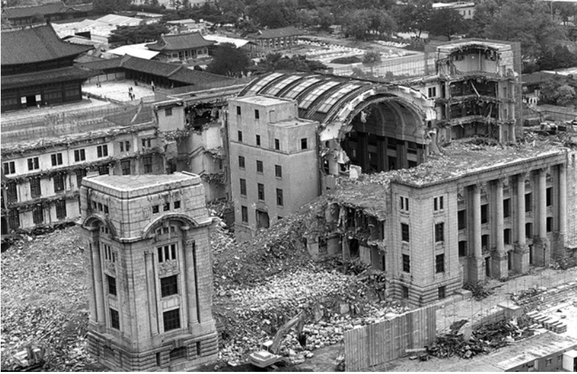
FIGURE 3.1. Demolition of the former Japanese governor-general building, Seoul, 1996.

legacies of the previous era, including the punishment of those responsible for the 1980 Kwangju massacre. The campaign initially took off with a clear signal to dismantle the authoritarian remnants. A secret military club called Hanahoe (Group of One), whose members were responsible for the December 12 coup of 1979 and the Kwangju massacre of 1980, was disbanded in 1993, and the building that had housed the former Japanese general government was demolished in 1996 (figure 3.1). 22 Most remarkably, two former presidents, Roh Tae-woo and Chun Doo-hwan, were indicted for their roles in the December 1979 coup d'état and the brutal massacre of the people of Kwangju in 1980, respectively. 23