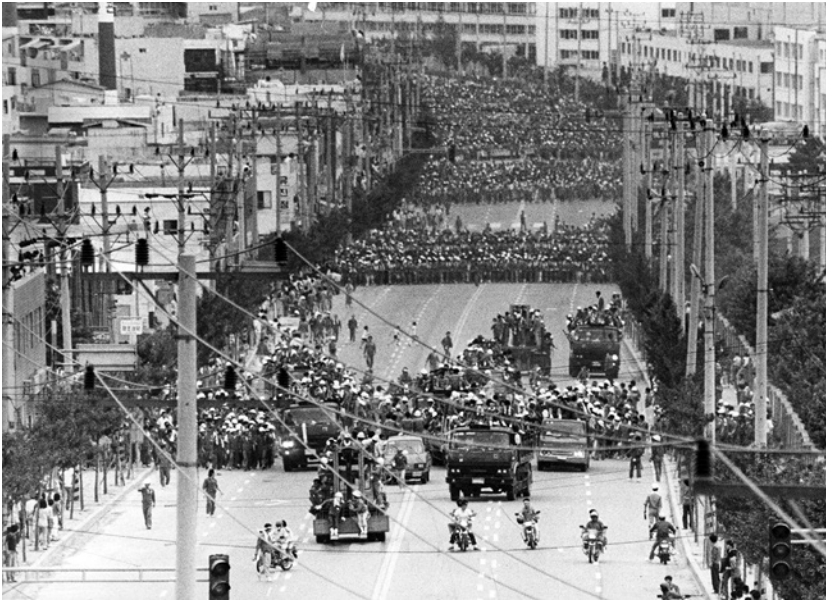
FIGURE 1.1. Hyundai workers demanding to recognize their union and wage increase in Ulsan, August 18, 1987.

from the 1990s, the citizenship of more recent social movements has been claimed exclusively by the middle class.