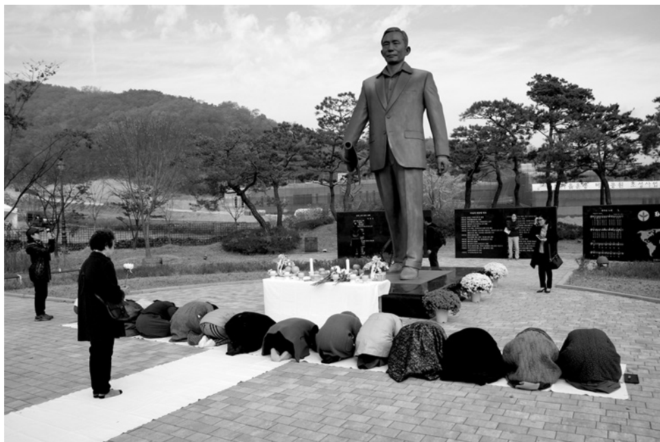
FIGURE 3.2. Participants of the commemorative ceremony of Park Chung-hee bowing before his statue, Kumi, North Kyöngsang Province, November 14, 2016.