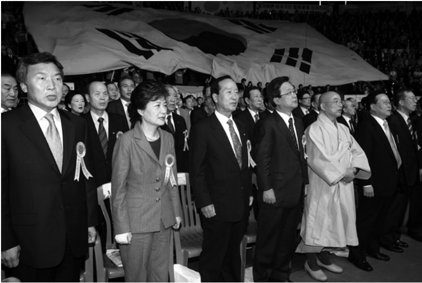
FIGURE 4.3. Former president Park Geun-hye ( second from left) attending the first anniversary of the founding of the Nationwide Coalition of the New Right, Changch'ung Stadium, Seoul, November 9, 2006.

of the minjung movement and all of its attendant historiography, that one had been vaccinated from Marxism or more generally leftist ideas, became a source of political legitimacy in the intellectual community. In particular, having overcome their erstwhile capitulation to the lure of chuch'e sasang has been the political cache of the representative figures of the New Right. 21