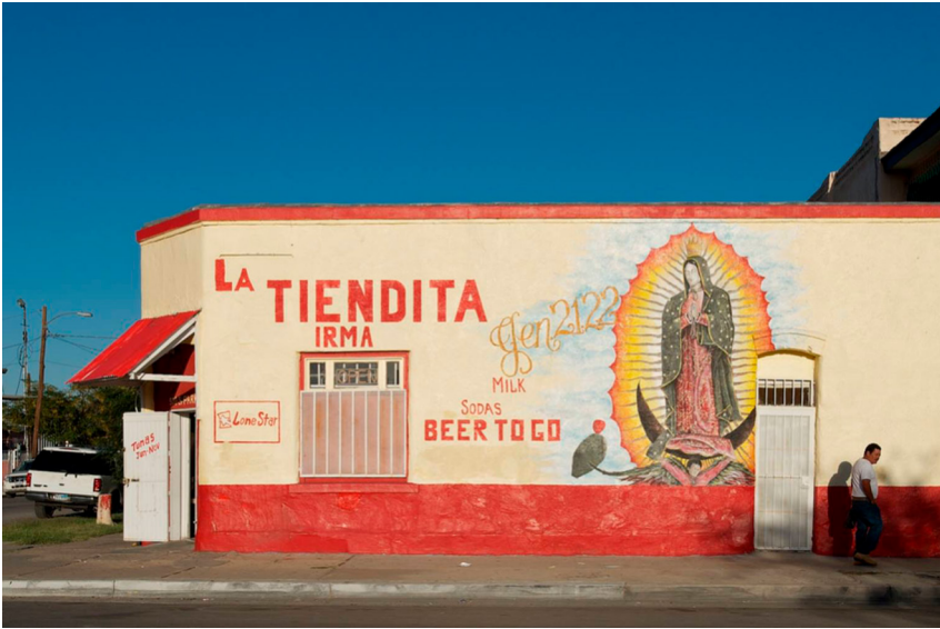
Figure 2: La Tiendita de Irma, mural by anonymous local artist.

typical of the Época de Oro of Mexican cinema (1936–1956), whose films marked the early Mexican– American borderland broadcast and media in general. The residential areas of El Paso’s south side are also characterised by houses painted with vibrant, saturated colours – whether as a uniform colour block or with frames in contrast – a feature that becomes even more evident in the oldest parts of Chihuahuita, where the one-storey buildings are smaller and closely packed together. Here, the Mexican architectural heritage also emerges in the widespread use of wrought metal railings and window bars – traditionally painted white – and the presence of religious icons and ex-votos hanging on external walls.