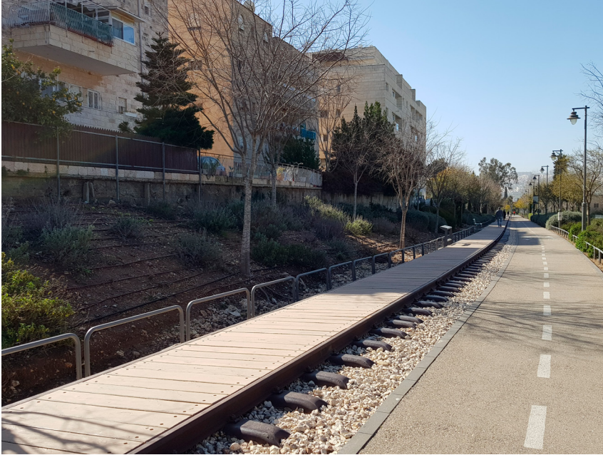
Figure 4: Buildings and backyards adjoined to the TTP limit accessibility to the TTP, section 3.

main reasons: they do not generate greenhouse gas emissions, they encourage physical activity – thereby promoting good health – and they take up minimal space. 55 The construction of walking paths and bicycle lanes in the TTP was planned in the aim of connecting the neighbourhoods. Moreover, the bicycle lane was intended to connect to the new Jerusalem Metropolitan Park, which begins near Malha Station and extends for 25 kilometres around Jerusalem. The fieldwork shows that there are bicycle and pedestrian paths along nearly the entire TTP. Exceptions were found in section 4, where a short section is a shared walking path and bicycle lane due to a small access road to private houses that runs parallel to the TTP, and in section 5, which has a shared path due to its declaration as an urban natural site.