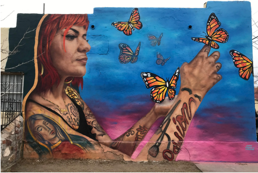
Figure 6: A mural depicting a Chicana woman purposely oriented toward Mexico, featuring Mexican heritage symbolic iconographies, at the corner of Tays Street and Delta Drive, © El Paso Inc, 2019.

the binational metropolitan area to celebrate its transnational nature. Living and working between El Paso and Ciudad Juárez, the couple realised several murals in the south side through the 2010s; nonetheless, Sister Cities/Ciudades Hermanas conveys a most effective intrinsic meaning and its underlying purpose was to be a “straight-up political comment on the borderland”. 60 The location of the wall painting is fundamental: it can be found on Father Rahm Avenue – the axis of the south side’s community – at the junction with El Paso Street, and it is visible right after crossing the Paso del Norte border bridge from Mexico. The mural is part of a larger project called Make Shift , funded by El Paso’s Museum and Cultural Affairs Department, for the realisation of several murals depicting everyday life and residents of the barrio, as well as representing a “homage to [local] artisans and farmworkers”. 61