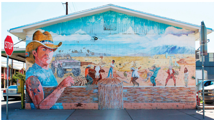
Figure 4: El Chuco y qué? (1991) blends Mexican American Pachuco culture and more traditional borderland imagery, 2018.