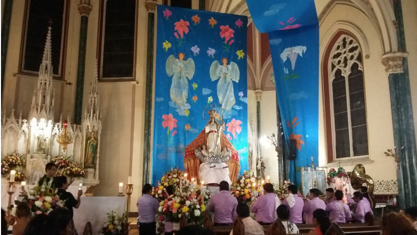
Figure 4: Singing of the mañanitas and morning mass at All Saints Church during the celebration of the Virgen de la Asunción (Saturday)

selves as Piastecos and Catholics. Thus, photography and photo sharing on social media becomes another way of demonstrating the territorialisation of spaces.