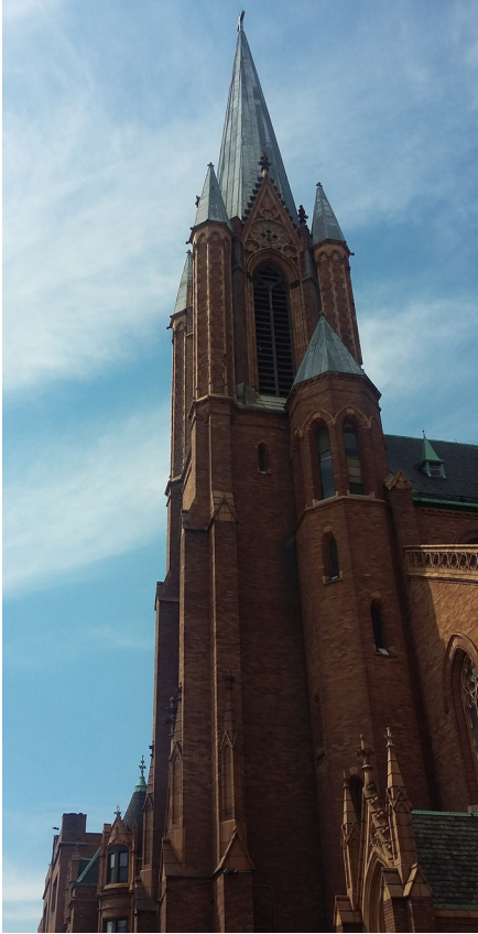
Figure 1: Façade of All Saints Church, Williamsburg, Brooklyn, New York City

even managed to establish businesses where they sold products from their country of origin or took up some commercial activity that they had carried out in their place of origin before migrating. However, these same migrants also began to bond with other immigrant groups, from whom they copied some or many of their behaviours or attitudes, marking the process of cultural overlapping of territories.