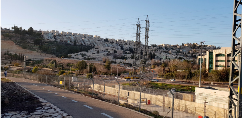
Figure 3: Section 5 near Malha neighborhood. The topography in Jerusalem can also play a role in limiting accessibility to the park, as seen in this case.

parks should support multiple age groups 5454 . Building a ramp at the entrances to the TTP would, therefore, attract more people who would otherwise find it hard to access. The fieldwork found that section 2 has the highest number of entrances – all of them with a ramp. Section 2 is adjacent to the German Colony and Baka, both predominantly affluent Jewish neighbourhoods. The large number of entrances in this section was possible thanks to a small road that runs along both sides of the TTP, enabling the construction of many entrances without restrictions. In contrast, other sections of the TTP are limited because they are blocked by backyard walls or buildings (Figure 4).