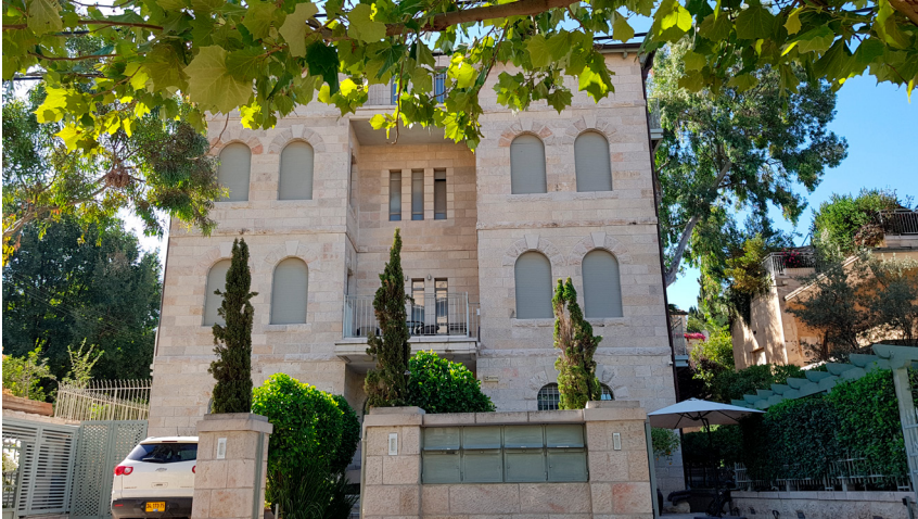
Figure 8: “Ghost apartments” adjoined to the TTP in section 2 – Baka. Many of the apartments in the German Colony and Baka are owned by foreign residents who come to live in these apartments for a short period every year. On most days of the year, these apartments are sealed off, which is noticeable from the closed shutters.

floors to these buildings and can thus sell these additional units at market prices. The new redevelopment project applies to social housing buildings. The advertisement for this project reads “Luxury project for the whole family” (Figure 7). If we examine the real estate prices in this section of the TTP we can see that between 2010 and 2020 house prices increased by 154%. 63 Specifically in the German Colony and Baka, new residents are mostly American and British Jews who buy second homes in Israel for the holidays. 64 Many of these houses and apartments are nicknamed “ghost houses”, since they remain empty for most of the year (Figure 8).