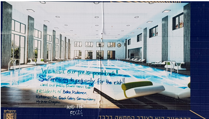
Figure 6: Graffiti on the signboard of new construction project, HaMesila (The Train-Track). The writing says: “We want our public pool back!! Swimming is not only for the rich!! And our public fitness room too!! Residents of Baka, Katamon, Katamonim, Greek Colony, German Colony, Makor Chayim”.

called HaMesila (The Train Track). The construction site is surrounded by a wall with an advertisement that reads “Luxury Residence” alongside the photo of a future private swimming pool (Figure 5). Until a few years ago, this site was a public swimming pool called Brehat Yerushalaim (Jerusalem Swimming Pool), which operated from 1958 to 2018. Feelings of alienation and resistance on part of some of the residents, who feel this development is taking away what belongs