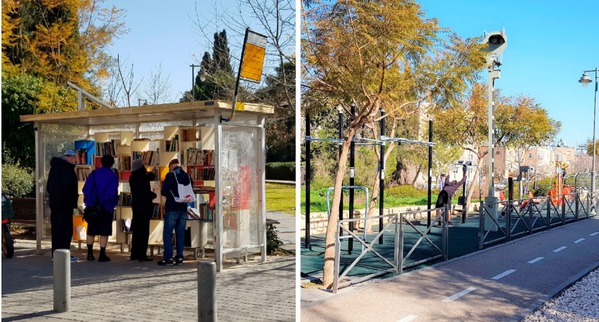
Figure 9: On the left, a public street library (in section 2 of the TTP) and on the right, an open-air sport facility (in section 3 of the TTP). Similar facilities can be found in different locations along the TTP.

different community centres. These community centres organise various activities in the park throughout the year, such as music performances, plays and story hours for children, marches for various purposes, and activities that promote the environment and the local community. Moreover, the Jerusalem Municipality also organises events that take place in the TTP. Some of the major sporting events that take place there are the Jerusalem Marathon, with over 10,000 participants passing through sections 1 and 2, and the Cycling in the Capital City event, with over 7,000 cyclists passing through all sections of the TTP. Furthermore, in the last few years, the Hebrew Book Week event has taken place in section 1 of the TTP.