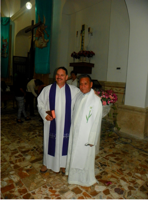
Figure 5: The priest of All Saints Church meets his counterpart in Piaxtla in 2015 © Emilio Maceda Rodríguez.

his visit, the immigrants from Piaxtla who had managed to obtain documented immigration status, had the economic resources that allowed them to travel back and forth between Mexico and the United States, and sought to get involved in activities and projects in their community had a strong influence. These immigrants are defined in this research as transmigrants, i.e. migrants who have a transnational link and