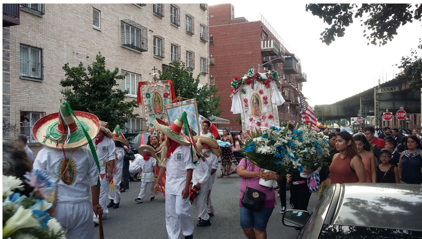
Figure 3: Procession of the icon at the celebration of the Virgen de la Asunción (Friday).

who also celebrate the Virgen de la Asunción , and who gather to accompany the image of the Piastecos during the procession tour, along with the other faithful, who may or may not be from Piastla. At the centre of the procession walks the steward together with the banner of the Virgen de la Asunción and the people who are going to deliver offerings, such as the hair or the crown, accompanied by banners of the Virgen de Guadalupe and a group that plays wind band music. At the end of the procession comes a group of dancers from Piastla called Los Tecuanis de Piastla , who have maintained this tradition in New York City and have popularised it over the past 30 years.