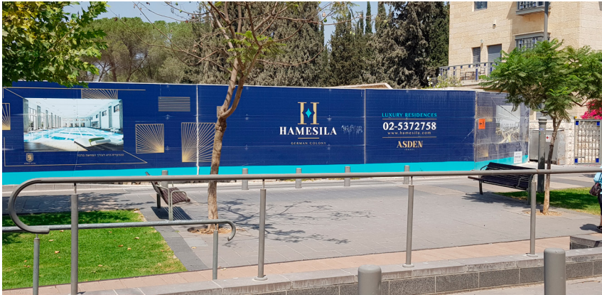
Figure 5: A new residential construction site, HaMesila (The Train-Track), built adjoined to section 2 of the TTP in the German Colony.