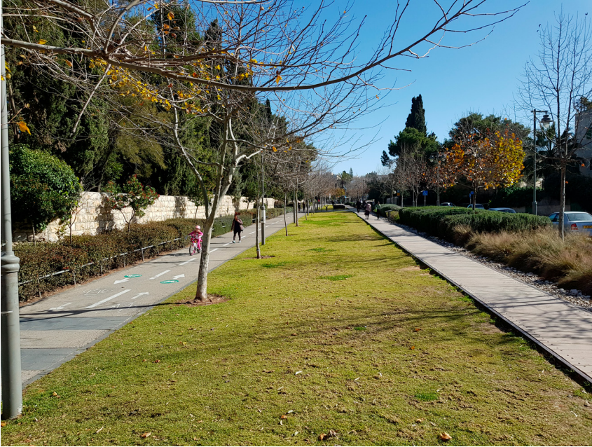
Figure 1: The Train-Track Park, section 2, northward facing view. On the right side, the original railroad track that has been converted into a walking path. On the left side, a bicycle lane.

tal and health hazards. Over the years, various redevelopment plans were put forward, but it was only in 2008 that plans to redevelop the site into a new urban park were approved. Two years later, in 2010, the construction of the TTP began. It was opened to the public in 2012, with its last instalments being completed three years later in 2015. Employing the slogan ‘From Backyard to Central Core’, the TTP passes through eight residential neighbourhoods that are a good representation of the human mosaic of Jerusalem. Indeed, after years of noise, pollution, neglect and division, the area had become a backyard, and the new TTP project sought to reinvent this area and turn it into the heart of its surrounding neighbourhoods to connect and unify, rather than divide and separate. Some were sceptical of how an unattractive area that acts as a physical and mental border between neighbourhoods could become a source of appeal and unity. Yet since its opening the TTP has become an area of transnational movement and encounters in between the adjacent neighbourhoods.