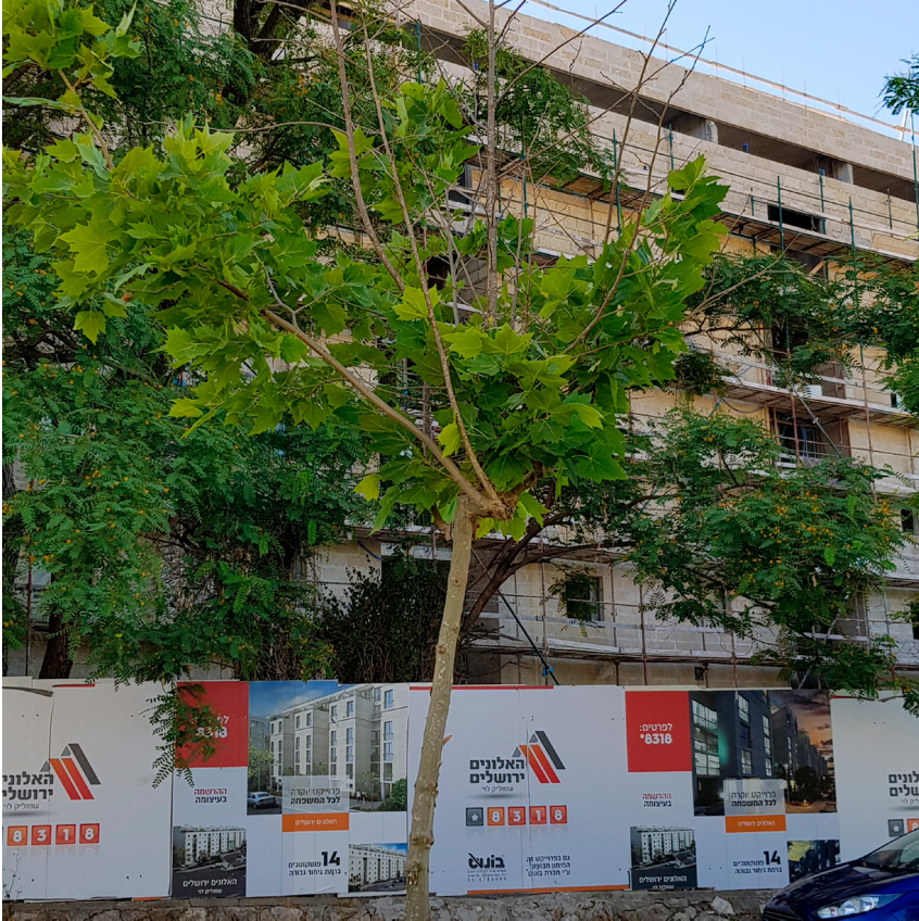
Figure 7: A new Israeli National Outline Plan 38A project adjacent to the TTP in section 2 – Baka neighborhood. The signboard reads, “Luxury project for the whole family” and “14 high-end cottages and penthouses”.

to them and changing the neighbourhood, can be found in different graffiti written on some of the signboards surrounding the construction site (Figure 6). Interestingly, after a few months the signboard with the graffiti was replaced with a more simplistic, discreet, photo-free signboard. It is significant to note that the signboard for this new development is all in English, which indicates that this development is intended to attract foreign buyers and internationally oriented parts of the population.