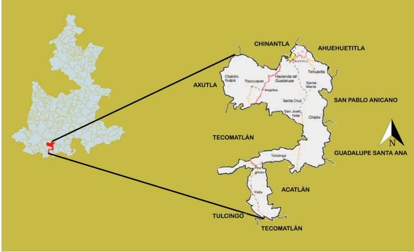
Figure 2: Map of Piaxtla Municipality in the Free and Sovereign State of Puebla, Mexico. Topographical information 1:250 000 © Own elaboration with data from INEGI (2005). Marco Geoestadístico Municipal, version 3.1.

The main economic activities that take place in the municipality are commerce and services. The characteristics of the local soil limit agricultural production, and according to data from INEGI only 11% of the land is suitable for agriculture, with corn being the main crop. 13 There is also a salt mine that is exploited in a rudimentary way, and a craft workshop that produces candles with beeswax. Based on these conditions, the level of marginalisation in this local population is not surprising. This has caused most of Piaxtla's inhabitants to be dependent on remittances of money made by migrants, which is why migrating, in this community, has become so important, and has made it possible to establish strong transnational links.