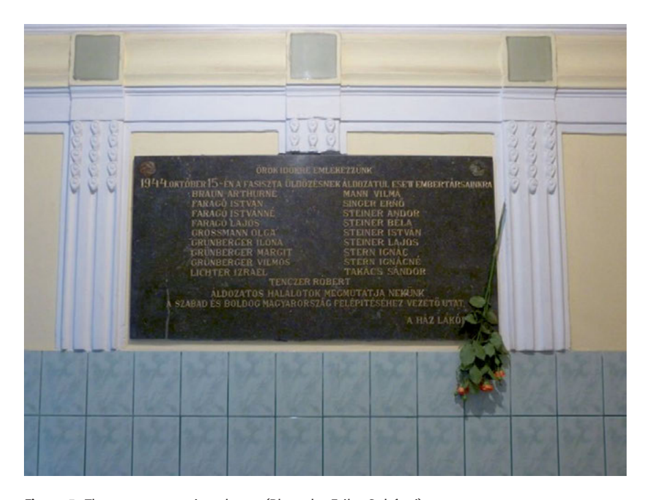
Figure 5: The commemorative plaque.

about their findings."<sup>152</sup> The fact that police investigators came to the crime scene on October 16 and took minutes (even though those were later lost), i.e. the fact that during the short orderly period after the Arrow Cross coup this event drew the attention of the police, suggests that the massacre was not a plotted political penal action to break Jewish resistance but a straightforward common offence of armed robbery. This could also explain why Piroska Dely's group returned to the location of the events.<sup>153</sup>