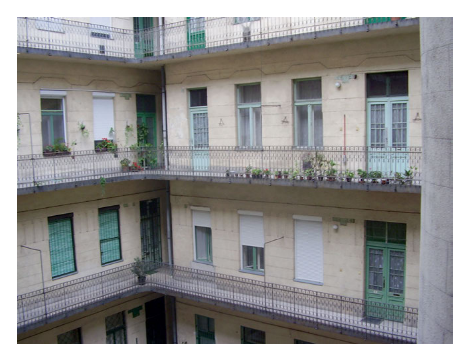
Figure 2: House.

ment building with one street entrance and a set of storefronts from the street side (see list of illustrations in appendix 10).