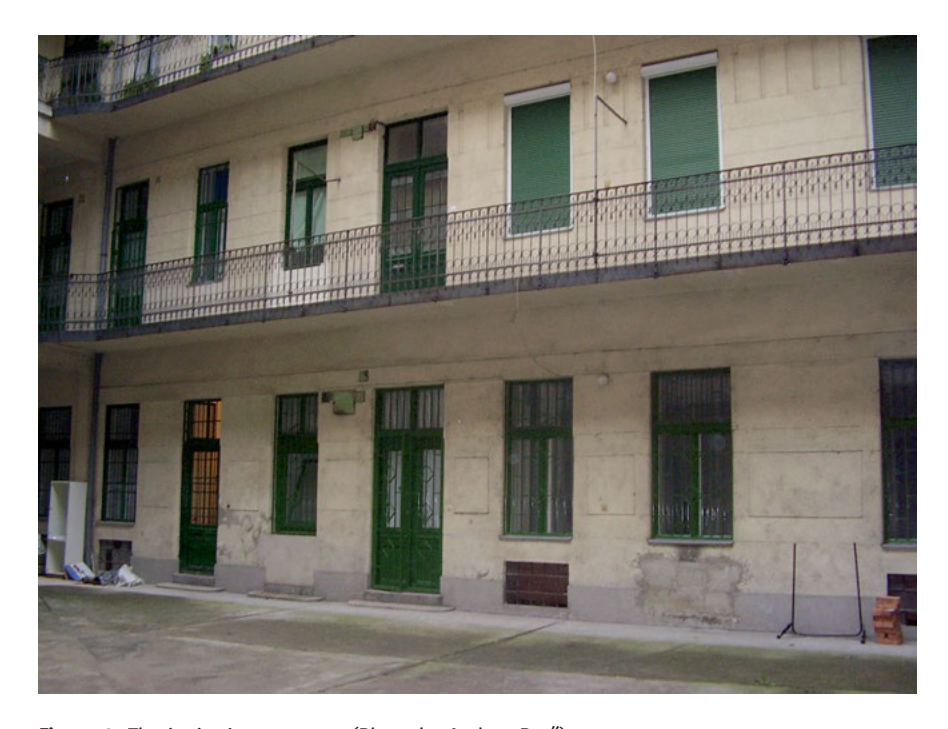
Figure 4: The janitor's apartment (Photo by Andrea Pető).

live in the building. These families that arrived between November 1944 and January 1945 had many children and were mainly clerks of the Beszkárt ( Budapesti Közlekedési Társaság – Budapest Transportation Services) who were notorious for their support for the Arrow Cross Party. They obtained the larger, nicer, more valuable apartments. From 1945, due to flat shortages and an increased influx of inhabitants from the rural areas, a system of joint tenants and lodgers was established. The Jewish families living in the house usually had an elderly relative or a solitary old Jewish woman share their apartment as a lodger. Among the Christian tenants there was no such system in place. The building itself was nationalized in 1952 and its Jewish owner received no compensation. The family left the country after the 1956 revolution and the relatives now live in Israel.