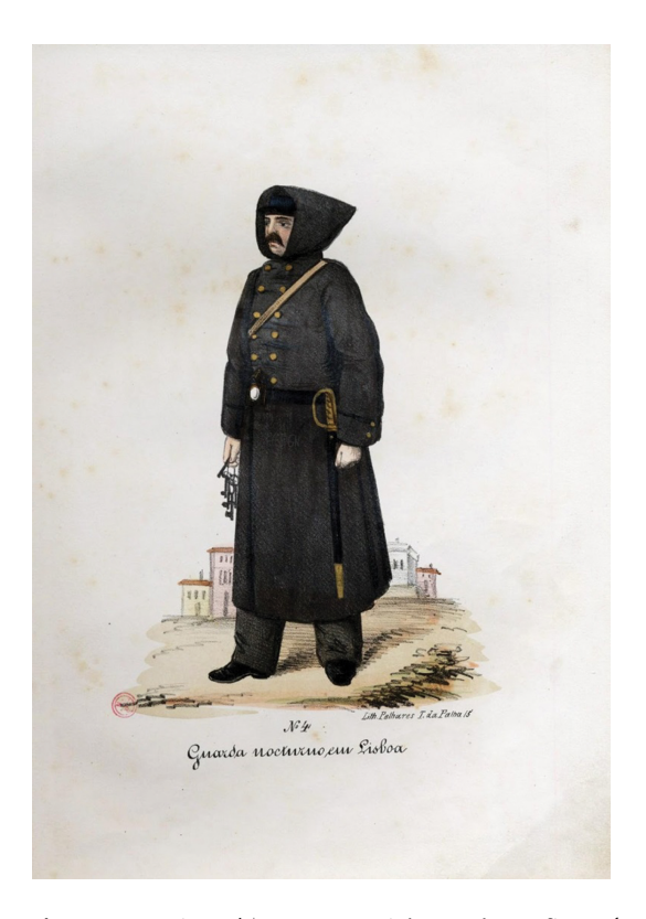
Fig. 4.3: SEQ Figura \* ARABIC 3: Night watchman figure (189-)

nineteenth century because in the same royal document, it was said that this function did not necessarily have to be performed by police elements but by an "individual or individuals proposed by them." From the outset, therefore, it was not a public service but a complementary service which could be recognised as necessary precisely because of the lack of policing. In 1883, a Portuguese Parliament was deliberating on the need to formalise this profession and give it the necessary benefits. Although there are records that speak of the need of guards to work exclusively at night from the mid-seventeenth century, as was the case with Quadrilheiros [civil night watchmen], <sup>32</sup> (Fig. 4.3) at the end of the nineteenth century, the ratification of the profession was still in discussion.