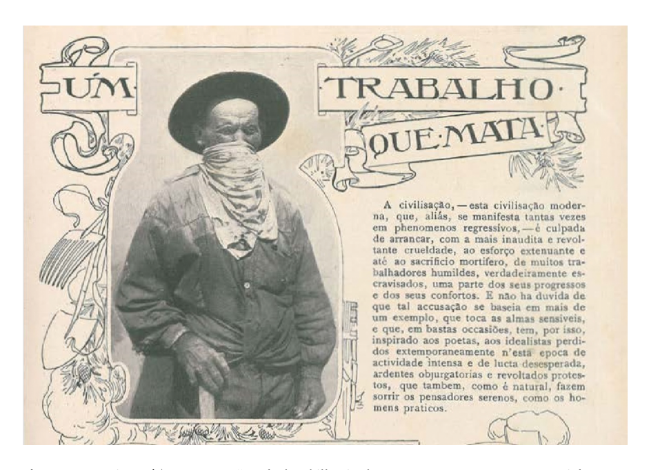
Fig. 4.2: SEQ Figura \* ARABIC 2: "A Job that kills" in Ilustração Portuguesa, n.º169, Lisboa, 17 de Maio de 1909.

In the same line, the 1911 National Survey<sup>20</sup> was supposed to summarily investigate the work conditions in the textile industry, which was counted among the most important sectors in Portugal and had export ambitions to the African continent.<sup>21</sup> This was the first official survey addressing the night work and its conditions that the employers offered to take part in. It was done in the aftermath of the establishment of the Republican Regime (1910) and was consistent with efforts of the regime – from Socialist inspiration – to evaluate the work