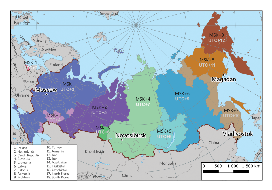
Fig. 10.1: Time zones map of Russia, since December 2020. Created by Artem Borozenets on the basis of the sketch by Asya Karaseva and Maria Momzikova.

time zones closer to Moscow, MSK and MSK + 8 subsequently. In 2011, it passed the Federal law №107-FZ "On timekeeping" which secured the timekeeping in Russia as a state duty and cancelled daylight saving time, making previous summer time the new time across the country. The latter decision caused public discontent in many regions expressed in protest groups in social networks, online petitions, letters to authorities and even the rallies. In the autumn of 2014, the state, except seven regions, switched to the previous winter time (1 hour back) and returned to the 11 time zones model. Among the excluded seven regions, five did not change the clocks at all and two moved them 2 hours back, getting closer to Moscow time. This change was the last nationwide time alteration. Since then, time zones have changed only on a regional level albeit with the approval of the federal government. These selective changes led to different experiences and local meanings of the time reform in the regions. For example, Vladivostok did not have any change in time difference with other Russian regions, and the time reform there meant the earlier nightfall in summer. In Magadan in 2014-2016, the time difference with other Russian regions was reduced by an hour, which caused citizens' petitions and public discussions on the matter, and the time reform was more about how the change in the time distance heavily affected living and working everyday rhythms of its inhabitants.