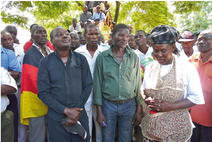
Fig. 6.1 Prayer time at a madjerman reunion in the Jardim 28 de Maio on February 4, 2014.

In Angola, there are no madjerman , or rather there is no equivalent term, and no cohesive organization representing former worker-trainees as a whole. Instead, two single-story brick houses in the Luandan suburbs,