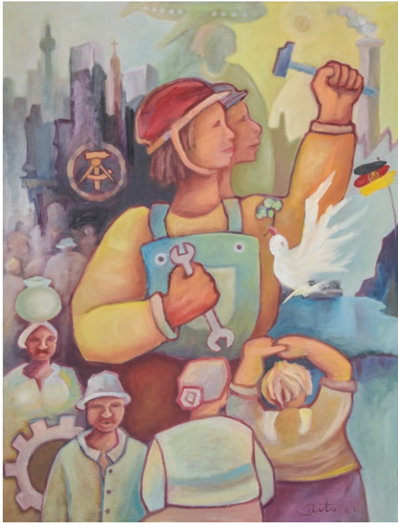
Fig. 8.1 Remembering the GDR , painted by Dito Tembe, 2021

Remembering the GDR strikingly illustrates the dualities that have been the central theme of this book. The city scene on the left features a gray Berlin winter's day, while the right side of the image shows the sun bathing a factory and its workers in warm light. The upper half of the image depicts the East German cityscape as Dito remembers it, while the bottom half shines light on figures who appear to be Mozambican. These moods, people, and places, even if they sometimes appear contradictory at first sight, played an important role in the lives of the worker-trainees, and accordingly take their place together on one canvas. In the same vein, this book embraces the dualities of the migrant experience, bringing them into one narrative through a lens of dichotomies: the state and the individual, working and consuming, integration and exclusion, loss and gain, the past