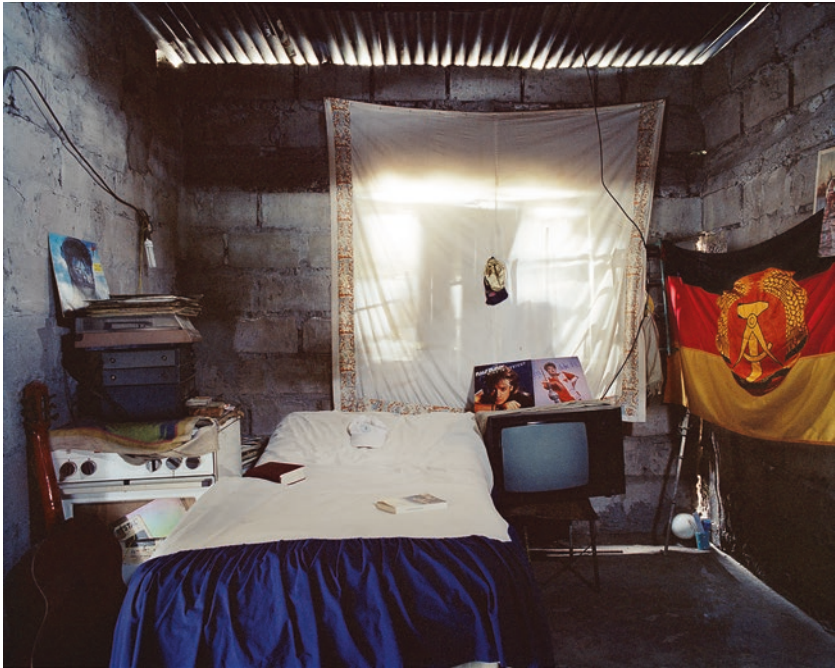
Fig. 7.3 The bedroom of a returned worker.

their experiences during the civil wars in Angola and Mozambique and their (mostly) failed reintegration into post-conflict economies. Few former worker-trainees have become part of Mozambique's new middle classes. The Angolans have fared marginally better. In this context, drawing on positive memories of East Germany must be seen in the light of the difficult reintegration workers subsequently experienced.