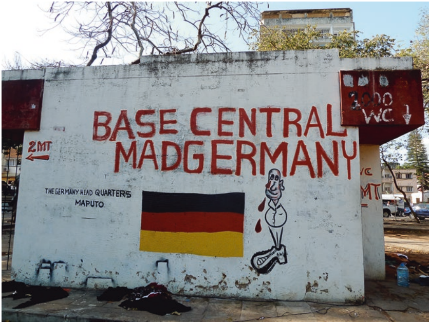
Fig. 7.2 The Base Central , office, and central congregation space for the mad-german in Maputo, in the Jardim 28 de Maio (Garden of the 28th of May) in August 2011. Since the photo was taken, the park has become gentrified.

government that were in part withheld during the 1980s. After two decades, protest has become a way of life for many in this group. If you stop and take the time to speak to any of the protesters, you will soon be told nostalgically about the golden times in East Germany and learn how the former migrants draw on their experience abroad to aspire to similar living and working conditions at home.