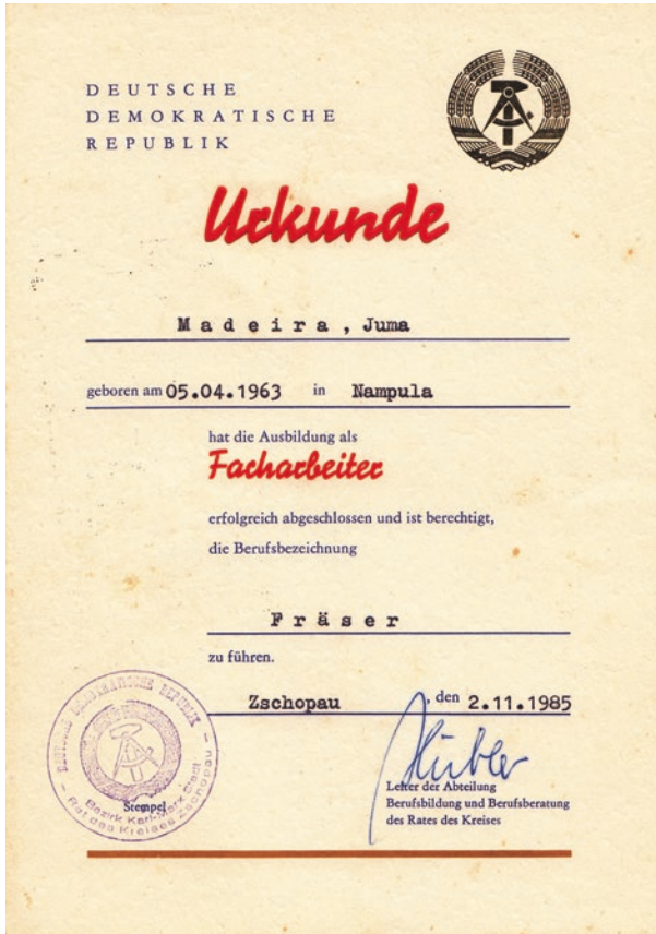
Fig. 4.2 The same certificate in German.

The text of the report in Fig. 4.4 reads: