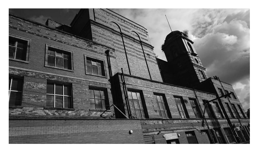
Figure 5.1 Spinners Mill, Leigh.

Spinners Mill is a prime example of this rich blend of local cultural activity. Across its 2900 square metres that spans four floors, it houses a number of community organisations, including the Heritage Centre, Leigh Film Factory (community cinema), and Leigh Hackspace, leading many to call the space the 'millage' where a number of like-minded Leigh locals can meet and share their craft. As part of its business model, Spinners also offers affordable rent for local businesses: it advertises this on its website as 'a hub for local Leigh companies to develop and serve their community' (Leigh Spinners Mill website, 2022). The provision of affordable studio space also enables the creation of a cluster of micro businesses that reflect a range of cultural practices. For example, Spinners Mill is home to A Will and a Way, an established acting school run by actor, Will Travis; Supernatural Diaries, an escape room in the mill run by psychic medium Tony