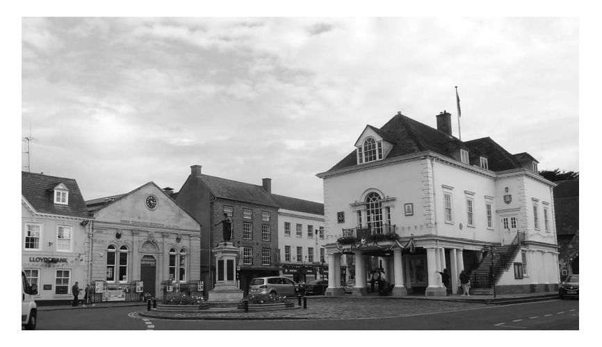
Figure 2.3 Wallingford Corn Exchange on the market square.