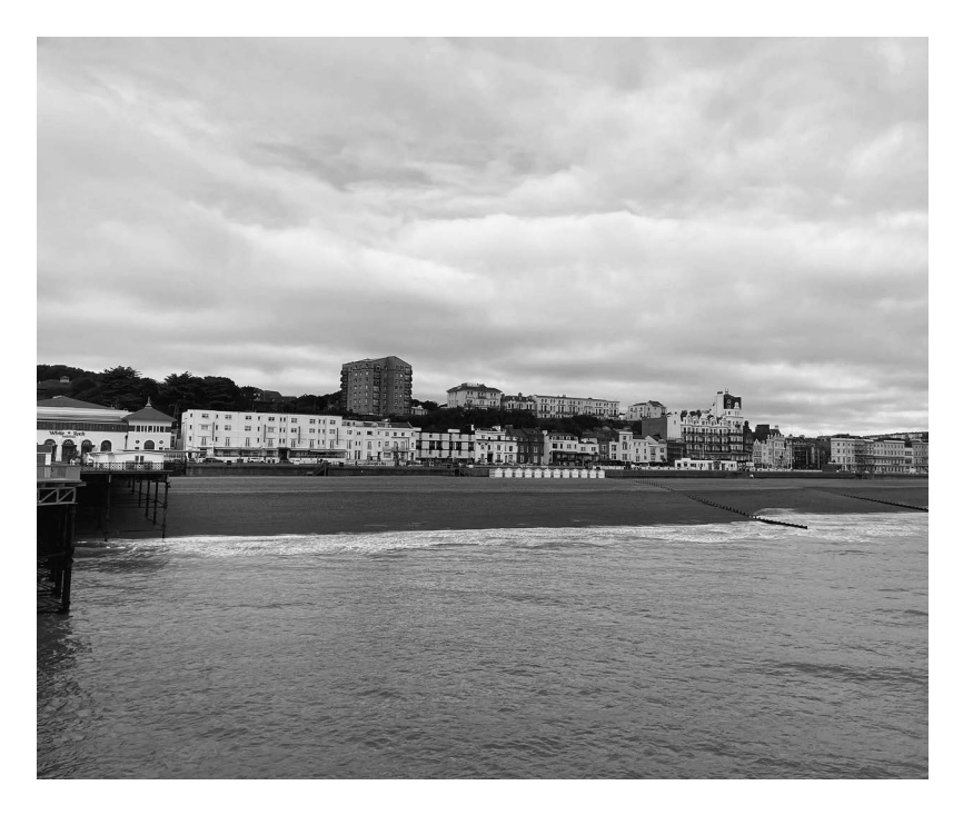
Figure 4.1 Hastings Pier.

Museum where Hastings' iconic net huts stand – once used to dry fishing nets to save them from rotting; or queuing for doughnuts, candy floss, and ice cream. As autumn approached and then winter, the seafront became quieter, the light became lower, and the crazy golf shut along with the fairground. On one visit, lines of fencing had been put up in front of an ice cream stall. A handful of people, hoods shielding them from the rain, slowly wandered outside the many fish and chip shops along the front, deciding which one to pick. The arcades – still open but empty – created haunting illusions of big wins, as sounds of money cashing out and celebratory flashing lights played on a loop. Along the promenade I passed a few cyclists and some runners. One lone figure stood on the pebbled beach – backlit by the low sun, making them look like a statue. I walked onto the pier (Figure 4.1) – an expanse of empty decking where a couple of seagulls hovered and landed – and looked back at Hastings on my right and St. Leonards on my left. I was able to take in the whole stretch of the town and at that moment was reminded of what numerous members of the Stables