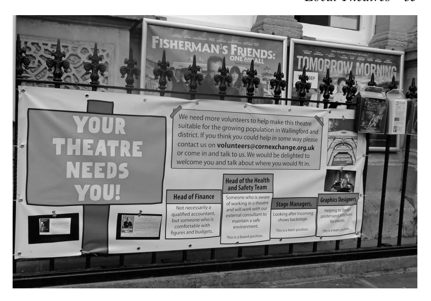
Figure 2.5 Sign on Corn Exchange inviting new people to volunteer, September 2022.