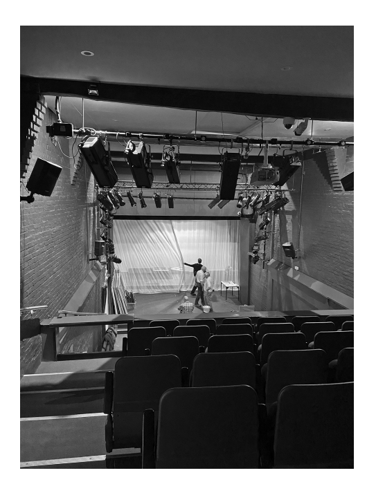
Figure 4.3 Stables Theatre backstage crew.

Through these conversations, the Stables can be understood as bringing together some of the complexities of volunteering within the town—where lines of creativity and cultures of care entangle. For its volunteers, the Stables acts as a local space of care, generosity, sociability, and feeling useful in retirement. But also functions as space where