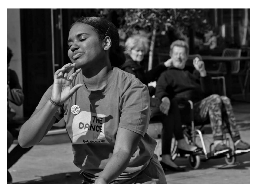
Figure 2.2 Love Slough – The Dance WE Made by Casson & Friends.