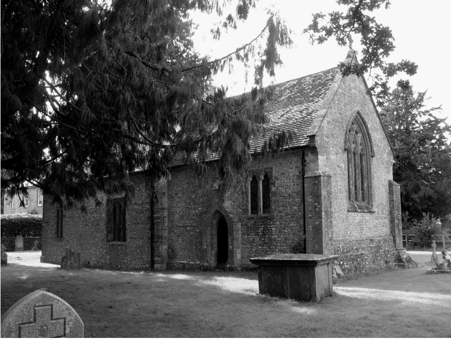
Figure 1.1 Holy Trinity Church and churchyard in Chilfrome, Dorset, in August 2010. The Old Rectory is just visible in the background.

no pictures of the house from this time, but photographs from the mid-1960s, one of which is shown in figure 1.2, show a substantial ivy-covered building surrounded by mature trees and large gardens. The cottage in the grounds was soon occupied by John and Mary Humphries, a younger married couple who were employed as gardener and cook respectively.