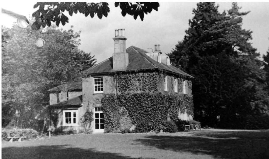
Figure 1.2 The Old Rectory in 1965.