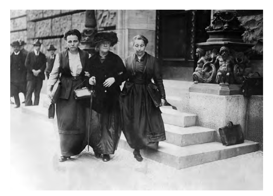
Figure 4.4 Clara Zetkin (1857–1933) with Lore Agnes (1876–1953) (left) and Mathilde Wurm (1874–1935) (right).

In Austria, the exhibition 'Sie meinen es politisch' 100 Jahre Frauenwahlrecht in Österreich' (They Mean it Politically: 100 Years of Women's Votes in Austria) and accompanying book also stressed the agency of women, feminists and socialists alike, in achieving suffrage and included the women revolutionaries within the tradition of women's political activism.<sup>115</sup> It is notable that these exhibitions were curated in consultation with feminist scholars, including Kerstin Wolff (Archive of the German Women's Movement, Germany) in Frankfurt, and a team of leading labour and suffrage historians including Gabriella Hauch and Birgitta Bader-Zaar in Vienna.