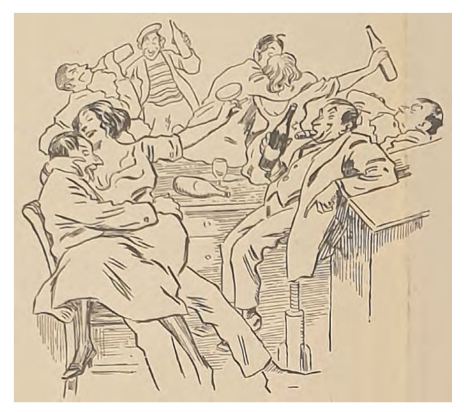
Figure 3.1 Propaganda poster against the Munich Republic of Councils showing drunken revolutionaries indulging in orgiastic pleasures, 1919. Reproduced with permission of the Plakat- und Flugblattsammlung, Münchner Stadtbibliothek/ Monacensia.

workers playing a prominent role.<sup>32</sup> In October 1918, sailors' mutinies broke out in Wilhelmshaven and Kiel, as was already the case throughout the Habsburg Monarchy in the course of the summer of 1918. The sailors were quickly supported by the local working population. Soldiers' and workers' councils soon spread to the rest of the country. The empire collapsed and on 9 November 1918, the Social Democrat Philipp Scheidemann announced the foundation of the Republic from the balcony of the Reichstag. While the Kaiserreich expired without bloodshed or a sudden surge of violence, the battle over the city palace ( Berliner Schloss ) on Christmas Eve 1918, and further street fighting in the early months of 1919, nearly put Berlin in a state of civil war. Indeed, the left-wing forces of the Independent Social Democratic Party (USPD) and the newly formed Spartacists wanted to carry on with the revolution and called