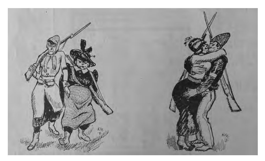
Figure 3.4 Cartoon mocking Red female soldiers in the Finnish satirical paper Nya Fyren , no. 5–7 (1918).

because the enemy in the civil war was a fellow citizen, possibly even one's neighbour or relative. The propagandists used stereotypes to create boundaries between the 'acceptable' and the 'detestable'. This dichotomy increased a sense of solidarity among 'normals' and eased the exclusion of 'abnormals'.<sup>108</sup> In White newspapers, four stereotypes were used to represent Red women. Nurses were called 'Sisters of free love', implying that they were on the front solely in order to indulge in sexual excesses. Finnish women who dated Russian soldiers were 'Russian brides' and were seen as traitors to the nation's purity. Red mothers were labelled as 'sources of evil' since they had raised sons who became rebels. They were even accused of being culpable for the whole war as a Red woman was 'the exact opposite to everything that she as a mother and as a wife should be. Such a woman should not be allowed to raise her children'.<sup>109</sup> The female soldiers were called tigresses as they were considered to have lost contact with their femininity and humanity and turned into beasts as they grabbed rifles. Immorality, be it sexual or otherwise, was common to all four stereotypes. Untrue rumours were spread, for instance, that Red nurses killed White patients in hospitals,<sup>110</sup> and female soldiers were disgraceful cowards and traitors: