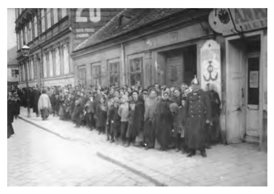
Figure 2.3 Women and children queuing for bread in First World War Vienna, exact date unknown.

Those who did participate in anti-war protests after 1914 typically had some prior experience of class struggles, albeit less through the socialist parties and unions organized by men and more through community-based forms of confrontation with authority.<sup>33</sup> During the war, this also made them well-placed to experience feelings of solidarity with teenagers, war cripples and soldiers unwilling to go back to war after periods of leave, as well as enemy POWs.<sup>34</sup> Those women who stayed working in the traditionally female-dominated textile industry instead of moving into munitions, for instance, in parts of Saxony,