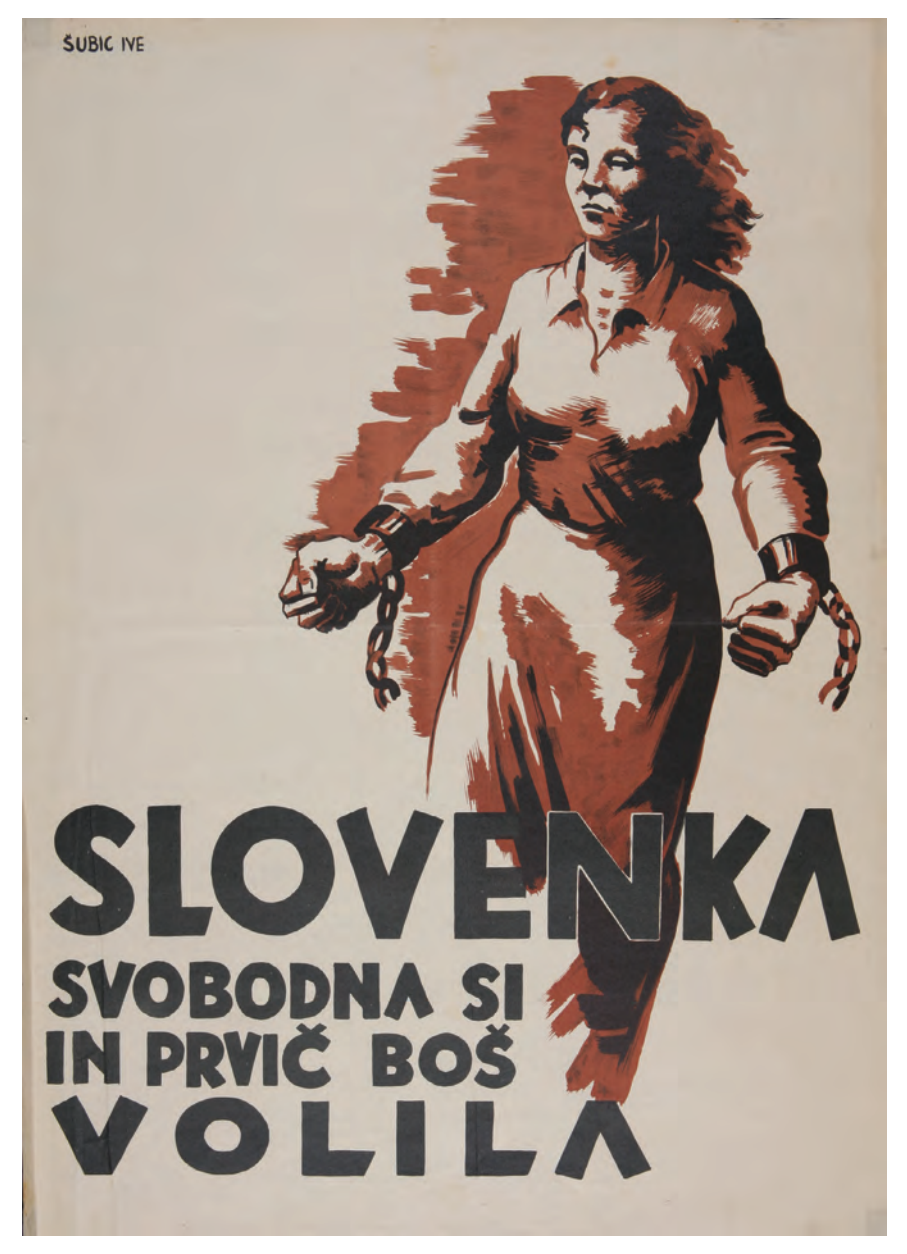
Figure 4.1 Ive Šubic: 'Slovenian woman, you are free and you will vote for the first time', poster, 1944. Reproduced with permission of the National Museum of Contemporary History of Slovenia.