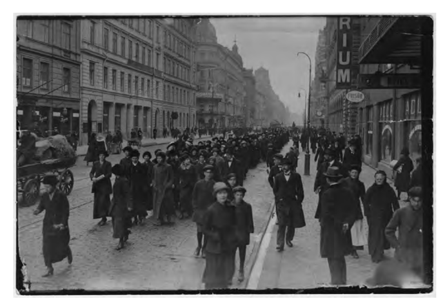
Figure 2.5 Women's 6,000-strong hunger march, here passing along Vasagatan, one of Stockholm's central thoroughfares, en route to the Milk Central, 26 April 1917.

events and the activities by other women these had triggered around the country, as well as the big demonstration in front of the Riksdag on 21 April – downed tools and set out on a march to the Milk Central to protest against the high prices for dairy products. They poured out of the Stockholm shoe factory, the Munich brewery, the Tobacco monopoly, the Barnängen textile factory, the Liljeholmens jersey factory and many others – until they were 6,000-strong.<sup>117</sup> A newspaper reported that even 'a large number of workers' wives and half-grown girls with braids on their backs' joined the large mass of women.<sup>118</sup> The Swedish hunger demonstrations are today considered to be the largest social protest movement in the country's recent history.