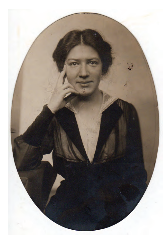
Figure 5.2. Käthe Leichter (1895–1942).

Even though a councils' republic had not been established in Austria, many socialists in Red Vienna saw a society in the making according to their ideas. For many it was a piece of 'revolutionary reality in its own right', as Ilona Duczynska had called it.<sup>31</sup> And this had to be defended in the increasingly polarized society of the First Republic. In 1931, Leichter warned readers in a pamphlet of the dangers of fascism: women would lose their political rights in a clerical-fascist or National Socialist state and be reduced to childbearing machines who had to bring forth children for the fighting fronts and factories of a coming war.<sup>32</sup>