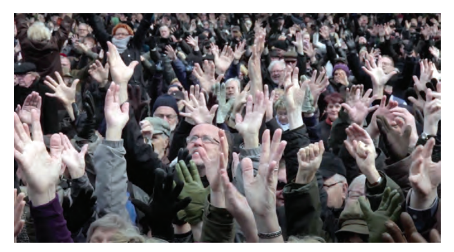
Figure 6.4. This picture is a still frame from the documentary film Fellman's Field (in Finnish Fellmanin pelto ) by Kaisa Salmi. In 2013, artist Kaisa Salmi directed a performance called Fellman's field – monument of 22,000 people. The event was attended by more than 10,000 people from all over Finland. The immersive performance was based on the events in the civil war's largest prison camp, where 22,000 Red prisoners spent several days in poor conditions on this same field waiting for their hearings. Reproduced with permission of the artist Kaisa Salmi.

In Finland, the civil war has also been dealt with through various immersive events. For example, artist Kaisa Salmi produced Fellman's Field – A Living Monument of 22,000 People as a work of performance in Lahti on 28 April 2013. Here it was staged in the same field where 22,000 Red women, men and children had waited for their interrogation and sentencing for six days in April–May 1918. The performance was attended by thousands of people, united by a desire to remember the victims of the civil war and reconcile the injustices that took place. The reception of the event was controversial. Some thought it was tearing open old wounds for no good purpose.<sup>65</sup>