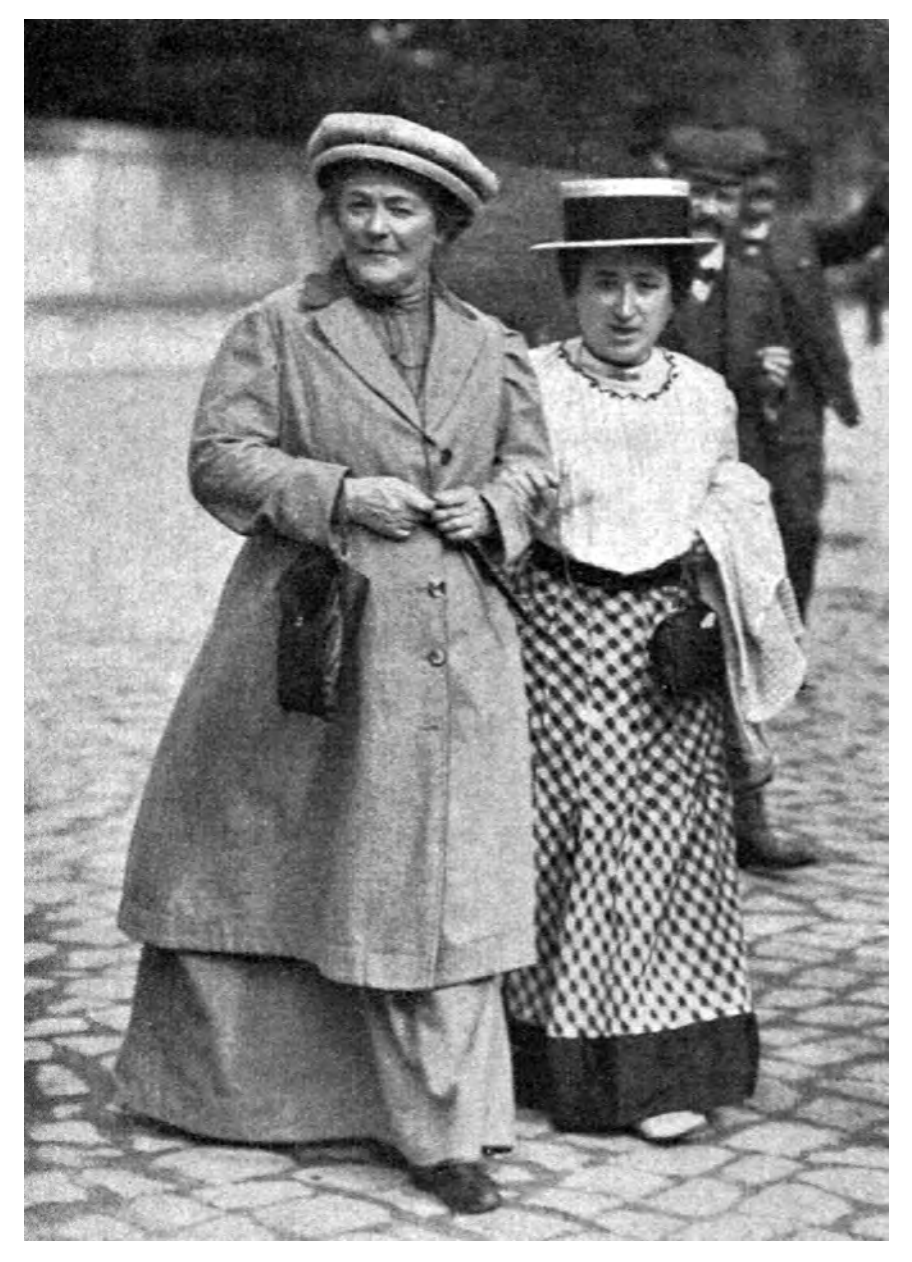
Figure 4.2 Clara Zetkin (1857–1933) with Rosa Luxemburg (1871–1919), 1910.