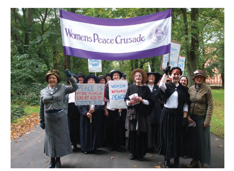
Figure 6.5. Peace Crusade Choir, 2018.

In Manchester, England, in 2014, a group of local volunteer researchers decided to explore alternative narratives of the years 1914-18 using the city and the surrounding textile towns of the North-West as examples of local and individual sites of resistance to the war. Many of the anti-war women in the North-West were under surveillance by the Special Branch and MI5, and a number of women were imprisoned as a result of their anti-war activities. Of course, there was sizeable opposition to the war across the country and a local, regional and national network of anti-war activists existed, but this research enabled an exploration of the networks of local resistance in more depth and the creation of spaces to commemorate this resistance. The research shone a light on the largely forgotten Women's Peace Crusade (WPC) which, although a national campaign, spread like wildfire through the industrial north: one of its main protagonists was Selina Cooper from Nelson. Firstly, a film was made about the Crusade with more than 100 volunteers from Manchester, Blackburn, Bolton, Rochdale, Oldham and Nelson who acted in the film, and twenty researchers who pored over local archives and newspapers to discover some of the socialist women active in each town: Lydia Leach from Blackburn, Elsie Winterbottom from Oldham, and Gertrude Ingham and Selina Cooper. As part of a process of commemoration, a group of