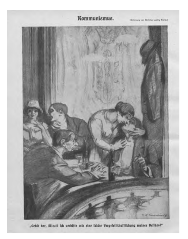
Figure 3.6 Cartoon ' Kommunismus ' in the Austrian satirical paper Die Muskete , 13 March 1919, equating the socialization of property with free sexuality and/or women with property.

The Social Democrat Hilja Pärssinen, a member of the Finnish Parliament since 1907, had to flee the country to Russia and then Estonia after the defeat of the