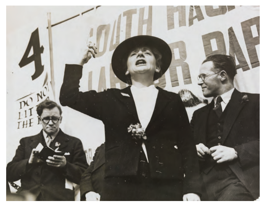
Figure 4.5 Ellen Wilkinson (1891–1947), MP, speaking at Labour's London May Day Celebration in Hyde Park, 1939. Wilkinson was Labour Party MP for Middlesbrough East (1924–31) and Jarrow (1935–47) and Minister of Education (1945–7).

ideas. In Manchester there was a competition for a 'womanchester' statue which was won outright by a public vote for Emmeline Pankhurst whose move to London in 1906 and pro-war stance were hardly mentioned. At the time of writing, there is a small but vocal campaign to get recognition for the other five shortlisted women: Margaret Ashton, 1856–1937, who was the first woman councillor, suffragist and pacifist; Elizabeth Gaskell, 1810–65, novelist and champion of the poor; Louise Da-Cacodia, 1934–2008, anti-racist campaigner and activist; Labour politician and suffragist Ellen Wilkinson, 1891–1947; and eighteenth-century entrepreneur Elizabeth Raffald, 1733–81.