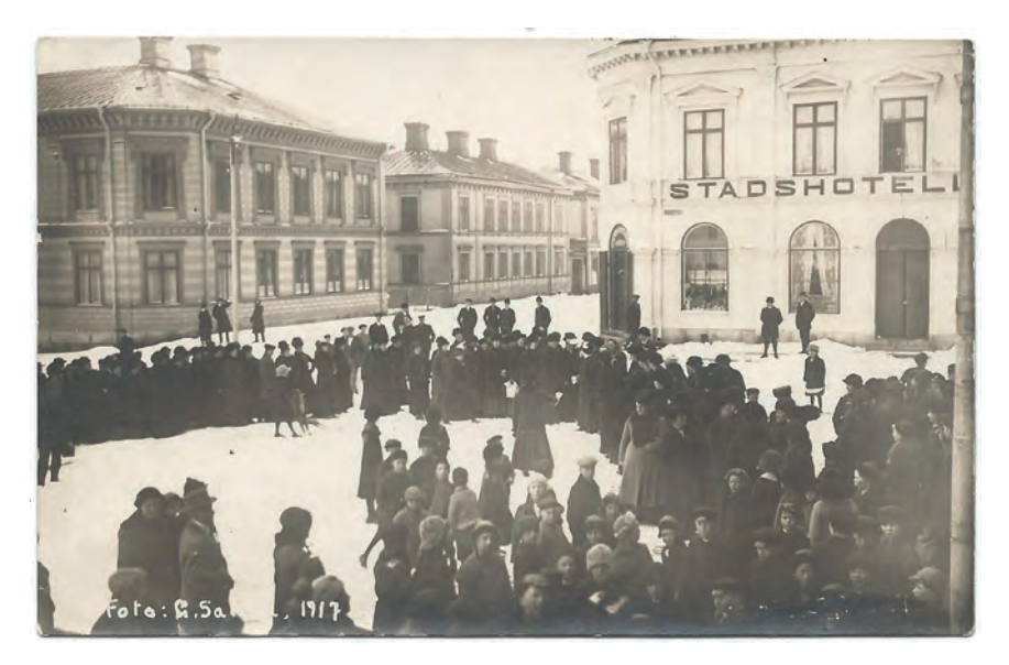
Figure 2.4 The women's hunger protest in Söderhamn, Sweden, on 11 April 1917.

daughters and sons at home on the grounds that there was 'nothing to put in the children's lunch boxes'.<sup>113</sup> The School Board attended a gathering in the public meeting house in the presence of 600 (unnamed) women and three (named) men, where it agreed to the women's demands to change the length of the school day to allow the women to feed the children what little they could before they left home and after they returned. The protocol clearly states that the School Board's agreement to the demands 'was greeted with cheers from the women' in attendance.<sup>114</sup> This example was soon followed by other local communities, and the new school day was soon introduced across the entire region by the regional School Board. Thus the women were actually in charge of events and pushed through proactive social change in Söderhamn for a few weeks during April and May of 1917.<sup>115</sup>