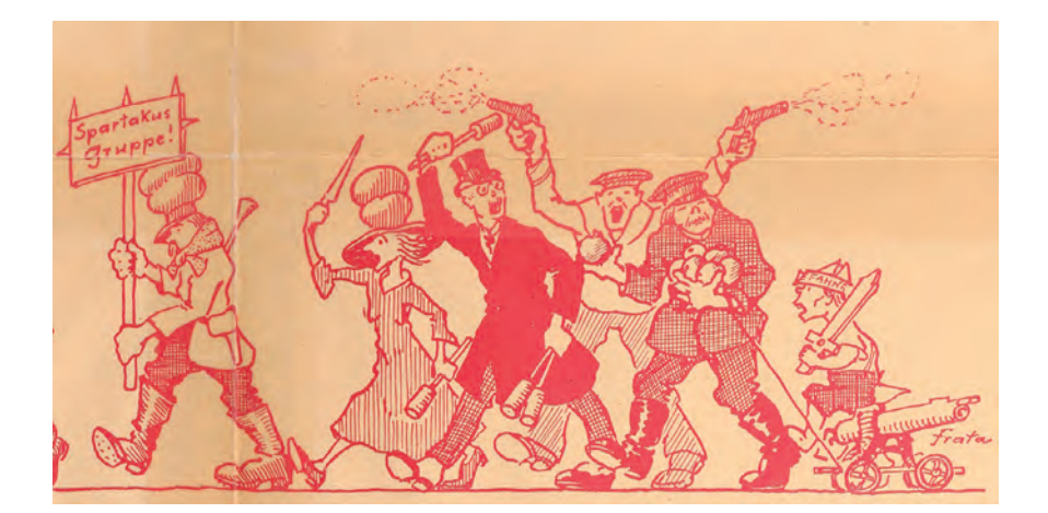
Figure 3.5 'Wen wähle ich?' ('Who do I vote for?'). German propaganda poster, 1919, promoting the Majority Social Democrats while warning against the dangers of the Spartacist movement represented by a dishevelled and armed woman in the front row.

In Germany, a reading of the politically conservative press gives further insight into the different aspects of the phantasma of the revolutionary woman, denying the political nature of feminine involvement. Spartacist women were described as amoral and sexually depraved. They are for example often referred to as prostitutes storing weapons in their homes and participating in looting. Districts under the control of the revolutionary side, like Berlin's Lichtenberg in March 1919, were described as being infested with 'nests' of Spartacists,<sup>114</sup> forming a veritable 'Bolshevik menagerie'.<sup>115</sup> The left-liberal Berliner Tageblatt carried a report on its front page on 19 January 1919 about 'the hustle and bustle of Spartacists [who] celebrated real orgies with women from the surrounding area. [It] was so bad that hardly anyone dared to leave the house afterwards.'<sup>116</sup> On the same day, the Tägliche Rundschau reported how five women were killed at the Silesian railway station<sup>117</sup> because they dared to 'resist to the advances of the Spartacists,<sup>118</sup> hence portraying revolutionaries as sexual predators.<sup>119</sup> These