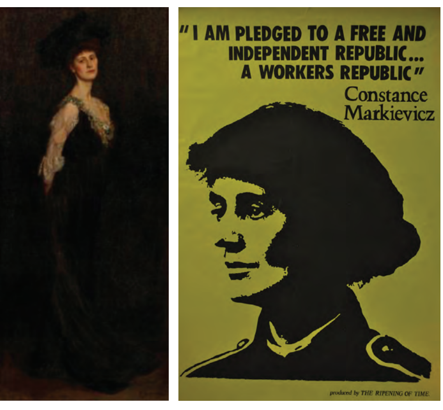
Figure 6.1. Boleslaw von Szankowski's portrait of Countess Constance Markievicz, 1901, reproduced with permission of the Hugh Lane Gallery, Dublin.