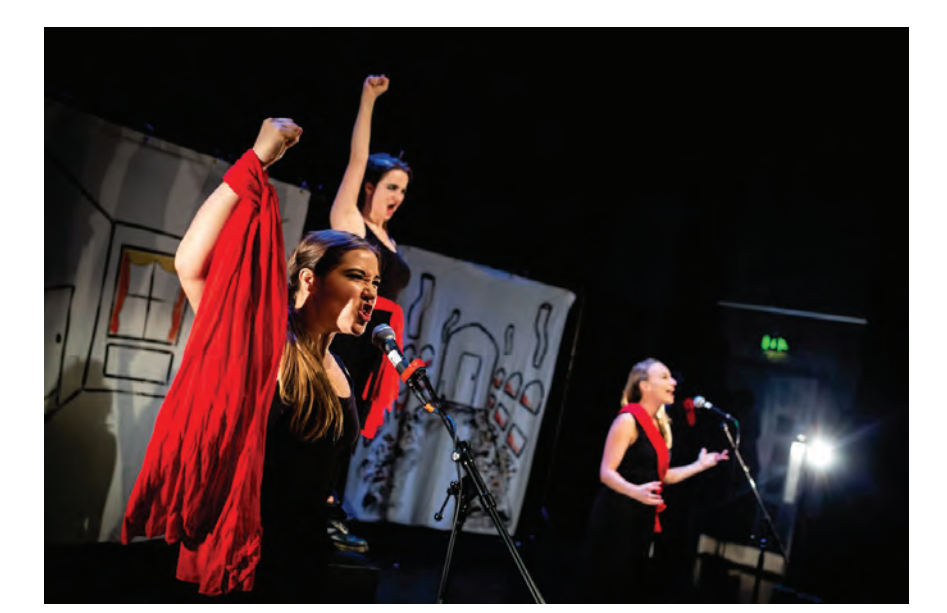
Figure 6.6. Rehearsal image from Women of Aktion by Bent Architect, 2018.