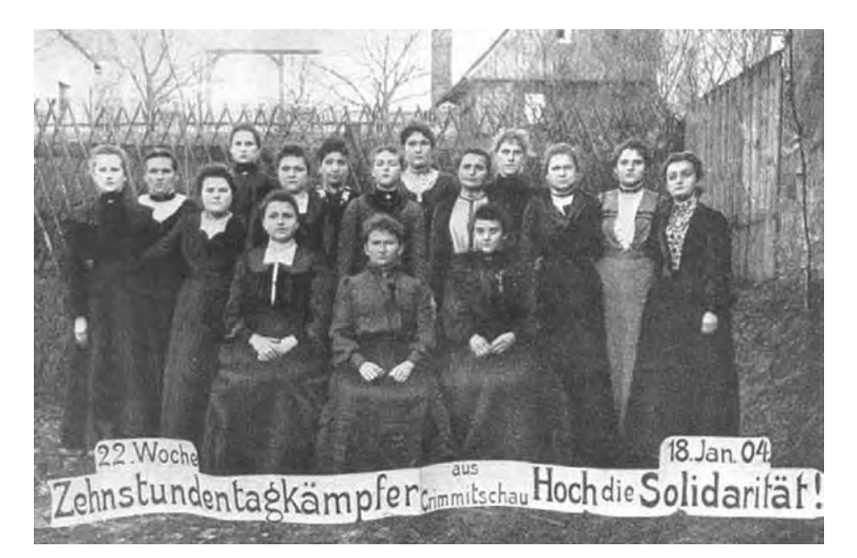
Figure 1.1 Photograph of a group of women campaigners for the ten-hour day in Crimmitschau, Saxony, taken on the final day of the twenty-two-week textile workers' strike of August 1903 to January 1904.