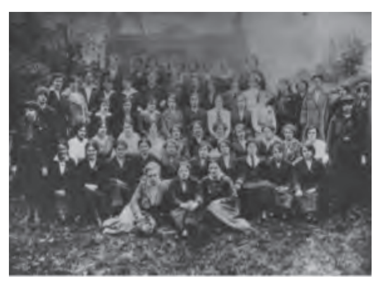
Figure 6.7. Revolutionary women of Easter 1916, Dublin, autumn 1916, reproduced with permission of Kilmainham Gaol Museum.