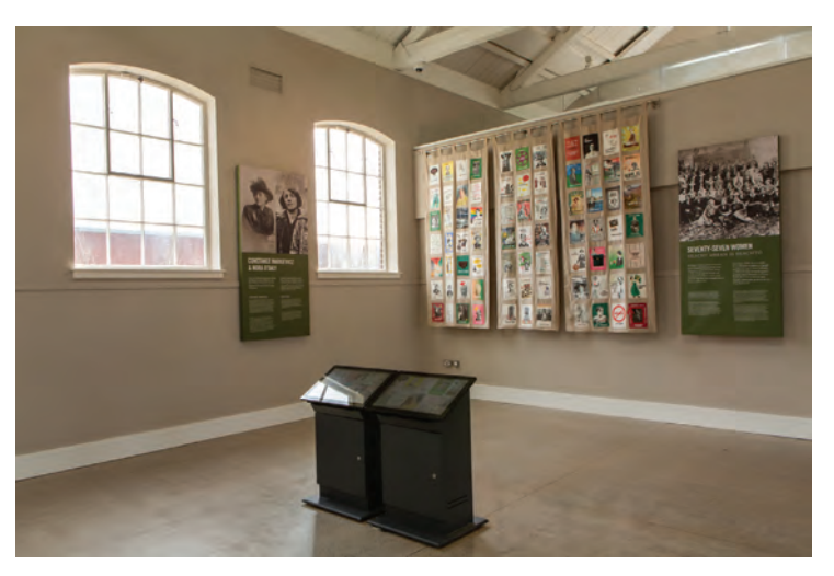
Figure 6.8. The '77 women' of 1916 quilt, Richmond Barracks Exhibition, 2016, reproduced with permission of Richmond Barracks

collaborative effort between a group of feminists, academics, activists and artists who came together as a planning subgroup during the development phase of the Barracks.<sup>105</sup> This subgroup engaged academics to research and write the book on the seventy-seven Easter Rising women, and a local artist to work with seventy-seven local activists to create a commemorative quilt.