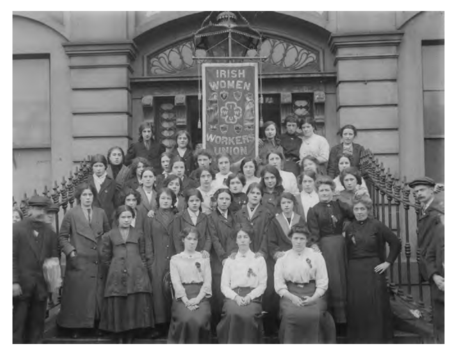
Figure 1.2 Members of the Irish Women Workers' Union on the steps of Liberty Hall, Dublin, during the lock-out strike of 1913–14.

Violent clashes also took place between male and female strikers and the forces of 'order' in Habsburg Trieste during the general strike in February 1902, Barcelona during the 'tragic week' ( Setmana Tràgica ) in July 1909, and the Emilia-Romagna and Marche regions of Italy during the 'Red Week' ( Settimana