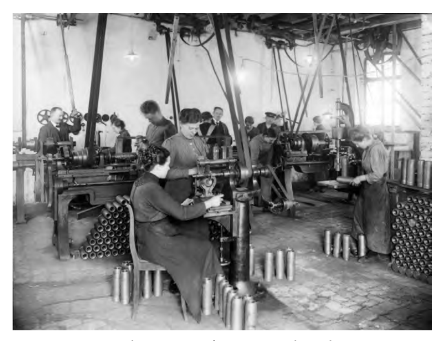
Figure 2.2 Women working in an arms factory, c. 1917, place unknown, Germany.

The image of the war presented here was, on the one hand, of an all-encompassing conflict that suited the interests of capitalists and arms manufacturers in every European country, not just belligerents, and conflicted with the interests of workers everywhere. On the other hand, it was also a view from the edges, laying bare the suffering caused by the war on a smaller scale, particularly as it affected women and children, and channelling the possibility of protest into the specific, the immediate and the everyday. As Toni Sender, one of the German delegates at Bern and a future Social Democratic Reichstag (parliamentary) deputy for the city of Frankfurt am Main, put it, the war had to be stopped and sovereignty