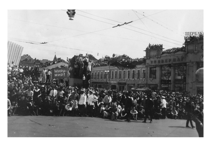
Fig. 12: Almost the whole Moscow had come to welcome the foreign visitors.