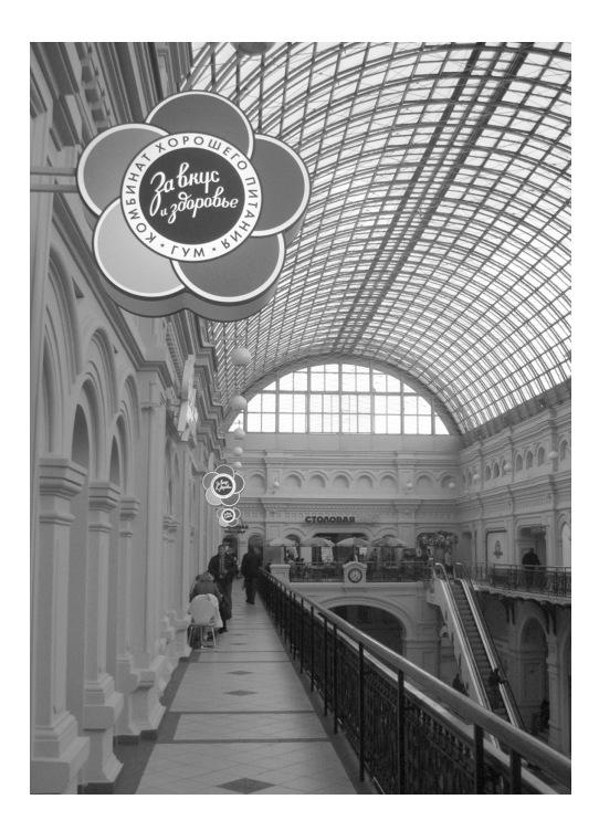
Fig. 20: Café festival'naia at the GUM department store in Moscow.

1957 festival is remembered with enthusiasm and optimism. While the 1957 Youth Festival has continued to attract a degree of media attention ever since, that of 1985 has been largely forgotten in the post-Soviet press. <sup>119</sup> For example, in 2007, the 50<sup>th</sup> anniversary of the 1957 festival was commemorated with an exhibition at the State Historical Museum, a clutch of articles in central newspapers and the establishment of a restaurant complex in GUM, including Café festival'naia (see Figure 20) imitating the visual style of the festival decorations