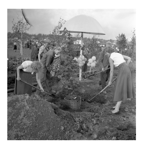
Fig. 14: Planting trees in a Friendship Park.