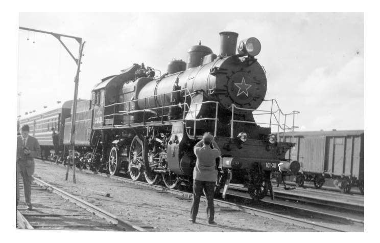
Fig. 17: One of the key themes of the festival trips in young men's home albums were vehicles. A young man photographing the locomotive at the Leningrad Station in Moscow.

explained to have mistaken this for the route to the opening ceremony. The second detention happened at the very same spot, at which time he claimed to have returned to take a souvenir photo of the place where he had been detained the first time. According to The New York Times, he was questioned for five hours but apparently avoided any further consequences.<sup>51</sup> In another case, two Australian delegates were accused of spying during a train trip back home through Siberia. In their report, the train staff and a KGB officer noted that the Australians had photographed bridges, railroads and industrial buildings along the way. The pair insisted they had photographed Siberia to show their friends and then said that they would tell Australian newspapers about the lack of individual freedom in the USSR if their films were taken. In the end, they consented to relinquishing their films, and the episode ended in a "friendly spirit". 52 Whether or not it was the same people, CIA records indicate that an anonymous person (or persons) had included observations and technical information about the Trans-Siberian railway in their report on the Moscow festival.<sup>53</sup>