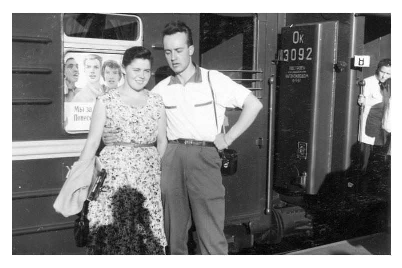
Fig. 19: Festival love? A Finnish man with a local girl.

What is nowadays a part of the romanticized past was then considered a tragedy for inexperienced and unfortunate Soviet girls, said to be "seduced" by exotic foreigners. The journalist Yuri Draichik reminisced that militiamen were ordered to protect Soviet girls from male festival guests, especially "black people". When an officer asked why it was particularly "black people", the militia leaders answered that it was because of the future of these girls. "They make a cohort of chocolate children with our girls, and it is not only a shame for our Soviet moral system, but also for the girl. She will hardly ever find any normal fellow to marry her with a chocolate baby". 103 This candid comment aptly reflected the unfamiliarity of Soviet society with ethnic diversity. Although the Soviet Union was a country with thousands of different ethnic groups, this variety only covered a part of the global spectrum. In the 1950s, there were so few African immigrants in the USSR that a black child would likely have been read as directly symbolizing a girl's promiscuity and would thus mark her out for her apparent sexual looseness. 104 The above quotation also points to the way that some Soviet people thought about otherness in the late 1950s. In the festival's rhetoric, all nations and all people, irrespective of ethnicity, were to be embraced. This, however, applied only to the festival. After the celebration, it was time to return to everyday life and, as the above comment indicates,