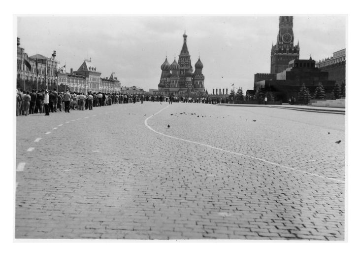
Fig. 16: Queueing to the Lenin-Stalin Mausoleum at the Red Square.