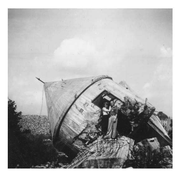
Fig. 4: A Finnish couple posing amid ruins in Berlin in 1951.