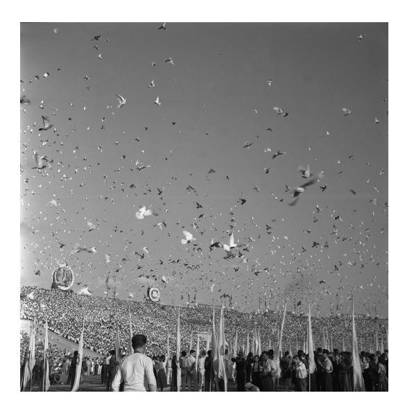
Fig. 1: Releasing doves at the opening ceremony of the Bucharest festival in 1953.

Given that the organizers, the WFDY and the IUS, had their organizational roots in the international communist movement and that most of the representatives in their decision-making bodies were either communists or sympathizers, it is obvious that the World Youth Festival leaned on socialist models of mass celebration. Festivals and other forms of public celebration played an important role in implementing the new Soviet culture and in legitimizing the new rule in the 1920s and 1930s. Public celebrations, as James von Geldern notes, "become particularly meaningful during times of revolutionary change, when societies not only must project themselves into the future but must grapple with the legacy of their past". Soviet public mass festivals embodied myriad ends. On one hand, public celebrations sought to bring the state and its people closer to each other, while on the other, they were used in propagandizing the correct values. The World Youth Festival drew on Soviet mass culture tradition in many respects, yet it also differed from it a great deal. Like the May Day parades, Women's day celebration, International Spartakiads, or the