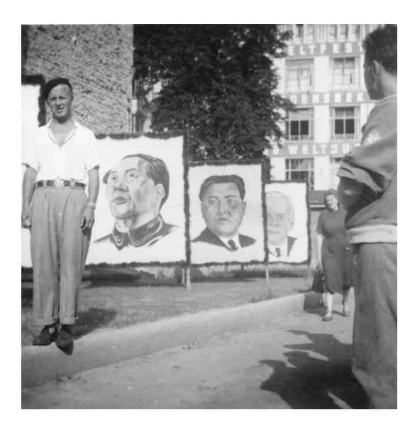
Fig. 3: Posters of political leaders decorated the venues in Eastern Berlin.

With 26,000 official delegates from 104 countries, and around two million East German young people, the Berlin festival became the first among the grandiose celebrations of the 1950s and started a golden age of the festival. 116 During the two-week festivities, peace and friendship symbols covered the centre of Berlin, along with political portraits of communist leaders Stalin, Mao, Kim Il-Sung, and the GDR bosses prime minister Otto Grotewohl, president Wilhelm Pieck, and SED first secretary Walter Ulbricht (see Figure 3). Above all, the Berlin festival