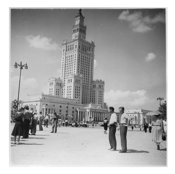
Fig. 8: Palace of Culture and Science served as the central venue for the Warsaw festival.

during the Warsaw festival (see Figure 8). A British participant, songwriter and author of children's books, Leon Rosselson (1934–) recalls that local people did not seem to be very grateful for the gift from the Eastern neighbour. In fact, a local joke circulated among the festival youth, telling that "the best view of Warsaw was from the Palace of Culture because it was the only place in the city from where you couldn't see the Palace of Culture." The controversial Stalinist monument tellingly exemplifies the dilemmas of de-Stalinization in Eastern Europe. Although the Warsaw festival, just like Bucharest one two years earlier, visually represented the post-Stalin era, free from the imagery of political leaders, the existing visual forms in public spaces, such as paintings, statues, buildings and now the Stalin palace, told their own story of the continuation of Soviet power in Poland and across Eastern Europe.