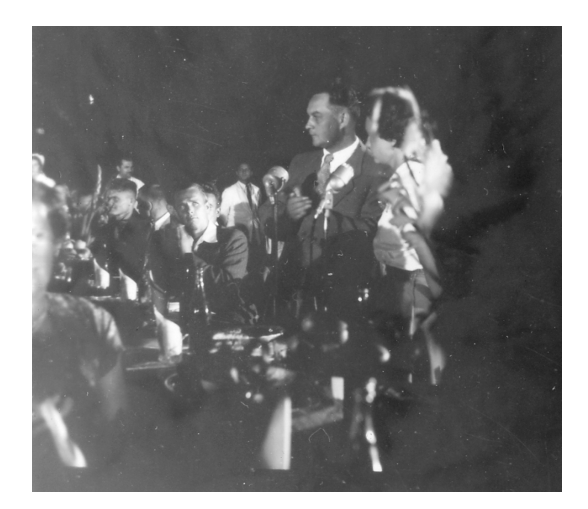
Fig. 9: Aleksandr Shelepin giving speech at the Bucharest festival in 1953.