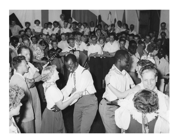
Fig. 7: Dancing at the evening party in the Warsaw festival.

Source: RGANI, f. 5, op. 28, d. 363, ll. 182-184. (O khode festivalia v Varshave, TsK KPSS, 6.10.1955, P. Ponomarenko). For a comparison, see the slightly different figures compiled by Polish organizers in Krzywicki, Andrzej, Poststalinowski karnawał radości. V Światowy Festival Młodzieży i Studentów o Pokój I Przyjaźń, Warszawa 1955 r., Warszawa: Wydawnictwo TRIO, 2009, 63.