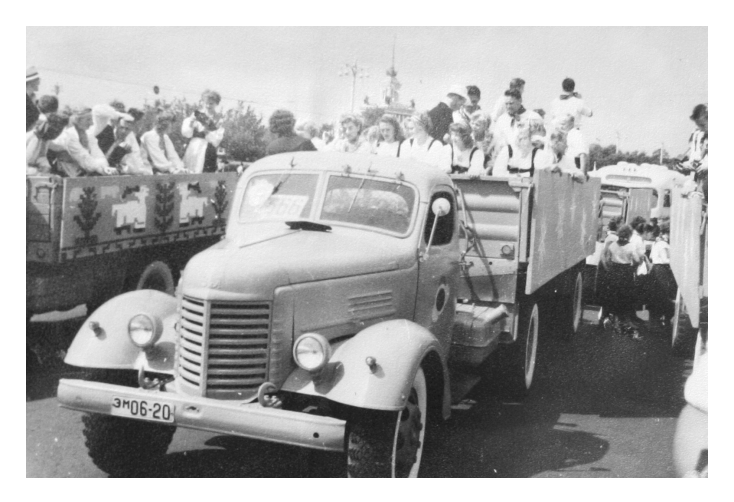
Fig. 11: Festival participants were transported to the Lenin Stadium in trucks.