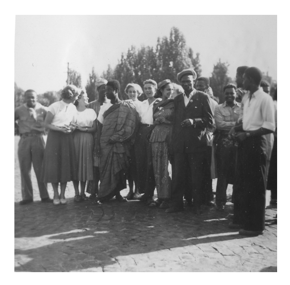
Fig. 2: Finnish participants mingling with new friends at the Bucharest festival in 1953.

the highlight of the "democratic" youth movement, a special forum to perform peace and friendship.<sup>62</sup>