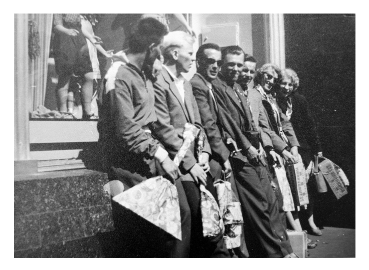
Fig. 18: After some shopping in Moscow.

meet. Black markets, personal networks and other such forms of gaining goods bloomed in the post-war Soviet Union. Although travelling abroad was a rare privilege, some people, like diplomats, athletes and artists were allowed to travel on occasion. Thus, they could acquire Western goods and bring them home for relatives and friends. Another way to procure such things was through foreign tourists: a practice that started emerge in Eastern Europe and the Soviet Union from the 1960s onwards. The festival differed from everyday life, in that those people who could not obtain Western consumer goods through their usual networks had more opportunities to acquire them. When the city was full of foreign youngsters, it was far more difficult to scrutinize every person's every actions.