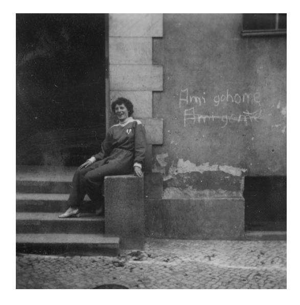
Fig. 5: "Ami go home" was a common response to anti-festival activities at the Berlin festival in 1951.

individual freedoms. Therefore, using exactly these means seemed to confirm the story that Soviet propaganda repeatedly told about suppressive Western governments. According to Jan Myrdal (1927–2020), Swedish communist and journalist of the French edition of World Youth , the picture that Swedish correspondents disseminated about the festival, for example about a cholera epidemic and disputes inside the Swedish delegation, was simply "one big lie". Anni Mikkola laughed at the claims made by Finnish newspapers about rotten meat and noted having shaken her fist to an American helicopter that flew over the sky during a mass demonstration, joining the chant of the festival crowd: "ami go home".