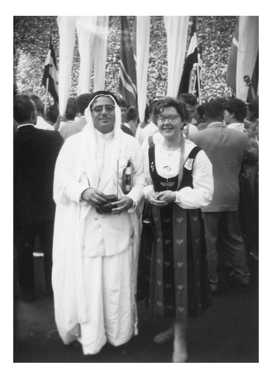
Fig. 15: Posing with a new friend at the Lenin Stadium.

Some of the visitors had a more professional approach to taking pictures of Soviet people, whom many in the West had only seen in Soviet propaganda imagery. A 22-year old Swiss student, Léonard Gianadda (1935-), travelled to Moscow as a photojournalist for the Swiss French-language paper L'Illustré. Gianadda's shots never ended up on public display during the Cold War, since the paper refused to publish the photos, regarding one of them as communist propaganda. Gianadda subsequently left journalism, and his photographs, some of them still undeveloped, eventually found their way to exhibitions displayed in Switzerland and Russia in 2009 and 2010 by a lucky accident. <sup>45</sup> Another photographer with a professional touch was 27-year old American film school graduate Robert Cohen.