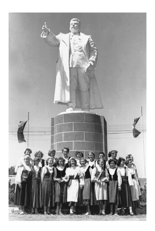
Fig. 6: Finnish youth choir from Helsinki visiting the Stalin Park (later renamed as Herâstrâu Park) in Bucharest in 1953.

national levels". <sup>12</sup> In contrast to the late Stalin period, when internationalism had been for Soviet people a rhetorical tool rather than a real practice, the Bucharest festival report listed concrete measures as to how contacts and interaction with foreign countries could be amplified. The report suggested, for example, that meetings between Soviet and foreign youth groups should be increased and more young people should be invited to the USSR from abroad. <sup>13</sup> This was a clear shift from the Stalin period, when the only foreign groups allowed to visit the Soviet Union were political delegations of communist youth leagues, an indicator that the attitude toward international cultural relations had started to change.