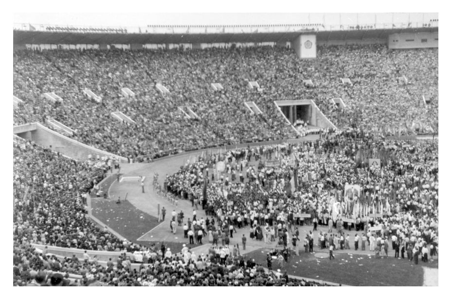
Fig. 13: Participants at the opening ceremony of the Moscow 1957 festival.

had done their utmost to put together an apolitical gathering.<sup>64</sup> Visual reminders about the recent past were seen also in the Moscow cityscape and around the country. The Nicaraguan communist Carlos Fonseca Amador wondered in his travelogue why there were still Stalin statues in the country, but none of Khrushchev, concluding that the continuing presence of representations of Stalin meant that he was still highly regarded and enjoyed wider support than his heirs did.<sup>65</sup>