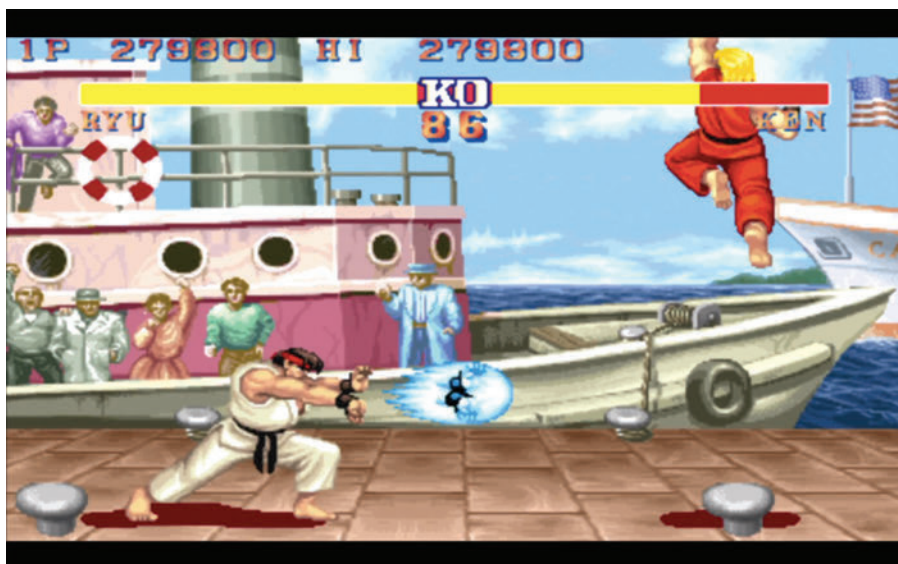
Fig. 2. Large, cartoonish sprites in Street Fighter II , featuring Ryu launching his “palm power” Hadōken fireball as one of his special moves.

standard attacks to be more efficient against different opponents. Capcom had previously used a three-character roster of selectable avatars, each with their own distinct fighting style, in its 1989 beat-em-up Final Fight —initially promoted as a sequel to Street Fighter before its generic distance from a proper fighting game led to Final Fight 's rebranding as a separate series—which was therefore an important inspiration for SFII (Gregersen 2016, 65).