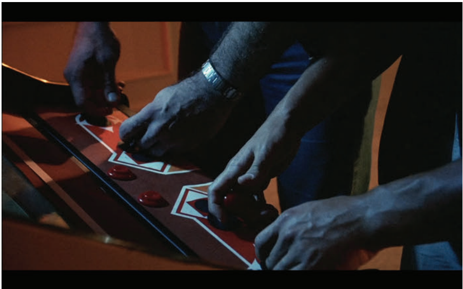
Figs. 13–14. Frank Dux (Jean-Claude Van Damme) proves unexpectedly talented at playing Karate Champ on his way to compete in the Kumite in Bloodsport .