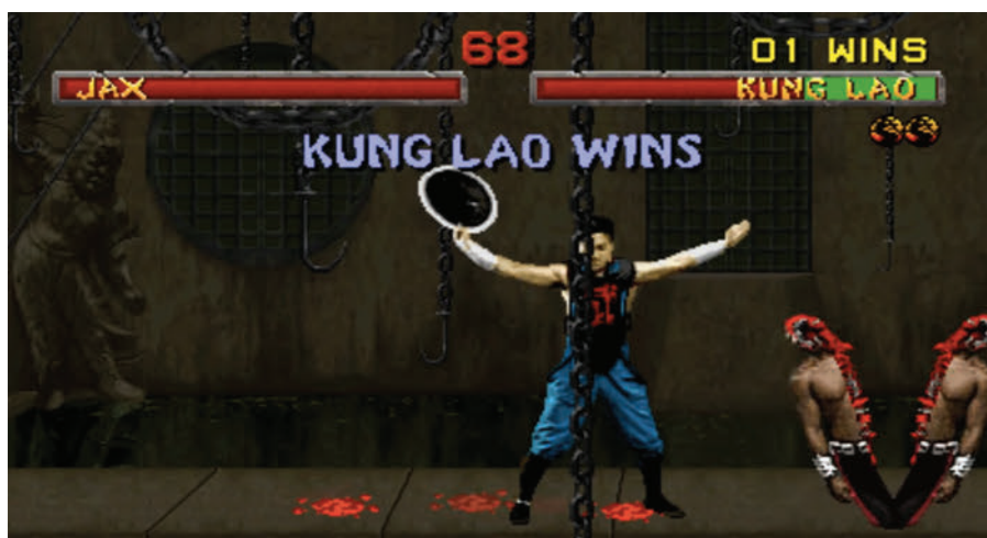
Figs. 7–8. In one of the gorier Mortal Kombat II fatalities, Kung Lao splits Jax down the middle with his razor-rimmed hat, showcasing how digitized character sprites are augmented with hand-drawn blood and gore animation.

CRT (cathode ray tube) screen (Kunkel 1993b, 43). By MKII , however, a larger production budget meant the design team could invest in a twenty-thousand-dollar, broadcast-quality Sony digital camera for higher-quality image capture, a big step up from the consumer-grade analog quality of Hi8 video. They also used a blue-screen process on MKII to more easily and efficiently isolate the images of the live actors, while the digital-to-digital workflow of MKII 's image capture permitted much higher graphi-