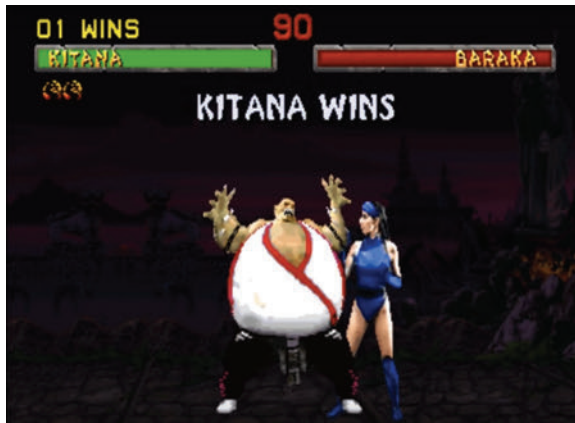
Figs. 11–12. One of the Three Storms blows up like a balloon and explodes in Big Trouble in Little China , much like Kitana’s Kiss of Death fatality in Mortal Kombat II .

is even a moment at the film’s climax where Lo Pan and Egg Shen use “palm power” to conjure battling avatars, connected to their hands by long strings of energy, as if playing their avatars with home console controllers!