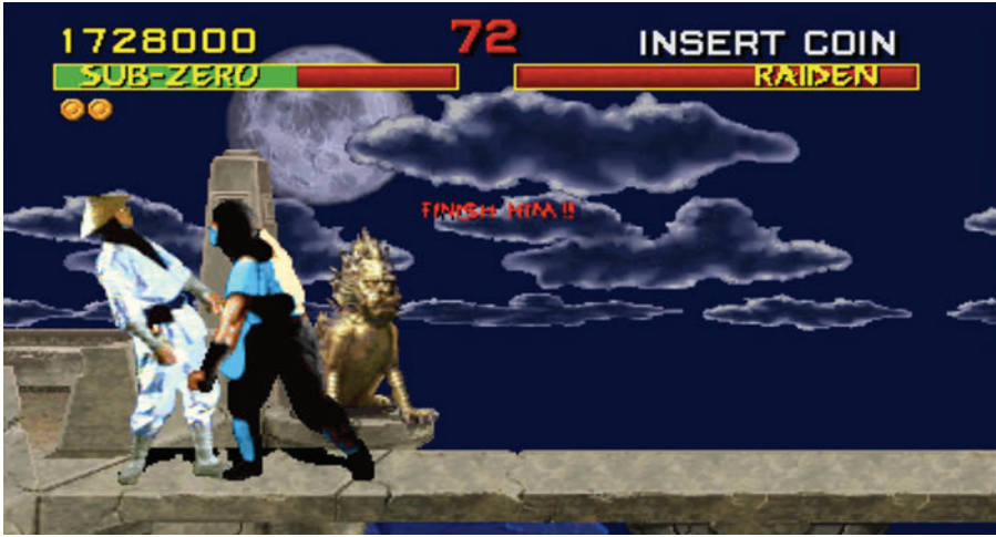
Fig. 4. As an elevated arena, “The Pit” in Mortal Kombat justifies the game’s 2D horizontal gameplay while also allowing players to execute the series’ first “stage fatality” with a simple uppercut, as illustrated here.

ing moves also demonstrate mastery and provide the winner with a brief moment of collective admiration.