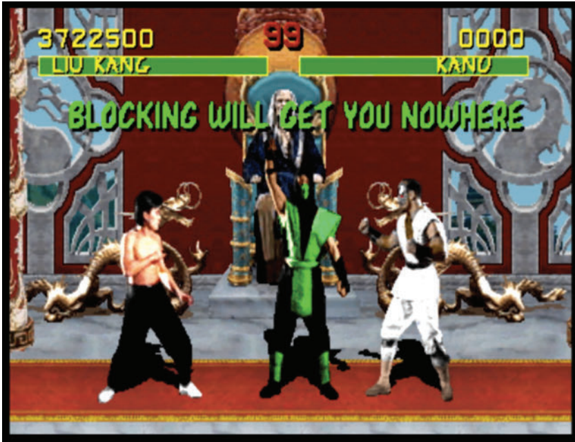
Fig. 5. Hidden fighter Reptile appears at random before a round in Mortal Kombat , providing hints about the multiple steps needed to trigger a match against him.

Transformations” counter in MK3 , to trick players into believing there was a way to unlock characters missing from those sequels—though, again, these rumors would have to travel via word of mouth from an arcade operator with access to the audit menu, which ordinary players could not see. Most of these hidden fighters (e.g., Reptile, Smoke, Noob Saibot, Jade, Ermac, Rain, Chameleon, et al.) are “palette swap” characters of existing sprites, thus allowing “new” characters to be included with a simple color change instead of burdening the arcade board’s limited memory capacity with a whole new set of character sprites. “A lot of the [secret] things aren’t based on the story,” Tobias admitted; “they’re just random events” (Quan 1994b, 29). Indeed, when many of these fighters were later introduced as playable characters in more completist sequels like Ultimate Mortal Kombat 3 (Midway, 1995) and Mortal Kombat Trilogy (Midway, 1996), their gameplay abilities were often poorly balanced and their backstories seem tacked onto the increasingly sprawling story world.