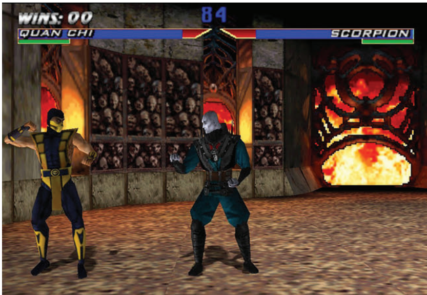
Fig. 18. Mortal Kombat 4 eschews pixilated sprites for polygonal character textures, solely modeled on live actors' movements instead of photographed images.

More blatant was the fact that MK4 was not a true 3D fighting game like Virtua Fighter or Tekken —in which “ring out” wins are made possible by knocking one’s opponent outside a square or circular arena (Harper 2014, 12)—but rather another 2.5D game consisting largely of horizontal gameplay, augmented by the ability to merely sidestep into an adjacent plane and small shifts in camera angle to suggest more 3D spatiality than gameplay actually allowed. Midway had previously tested this function with their coin-op fighting game War Gods (1996), which retained MK3 ’s basic button configuration but replaced the unpopular Run button with a “3D” button for the sidestepping function. Although War Gods was effectively a trial run for MK4 , and was released the same year as Capcom’s similarly middling 2.5D Street Fighter EX (1996), Midway nevertheless committed to 3D with MK4 , while Capcom’s competing 1997 release, Street Fighter III: New Generation , backpedaled into retaining a more familiar 2D aesthetic that further made MK4 ’s design look poorly realized by comparison. Steven Poole (2000, 83) notes that camera shifts in 3D games may seem superficially more “cinematic” in style, but they are typically constrained to maximizing the visibility of relevant gameplay action. Especially successful 3D fighting series like the Tekken , Soulcalibur , and Dead or Alive games embrace their 3D gameplay by privi-