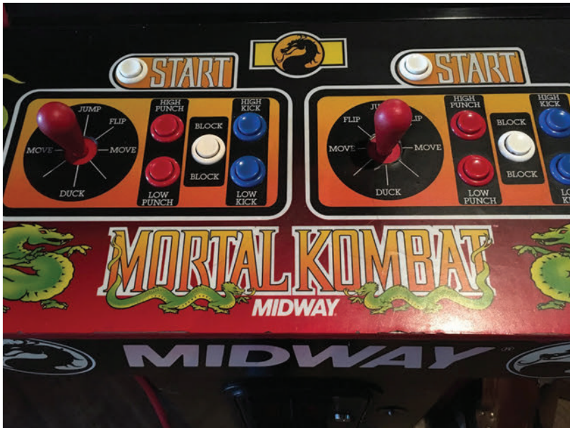
Fig. 3. Five-button control interface for Midway's Mortal Kombat .

dent” during early tests of the game but were refined to “be flexible enough for kids to come up with their own custom combos” and thus deliberately differ from SFII 's gameplay (Quan 1994c, 115). Although the early release version of MKI was criticized for “perpetual juggling in the corner” (Quan 1994d, 46)—a game balance problem that also highlights the arbitrariness of arena boundaries in 2D fighting games— MKII would incorporate more “teleport” moves, allowing one’s avatar to magically jump to the opposite side of the arena, escaping the spatial compression of such arena edges and potentially disorienting one’s opponent by reversing the characters’ left-right orientation. MK3 would introduce double-decker arenas that allow one to uppercut their opponent into the arena above, where the match continues (a feature that also evocatively fleshes out the diegesis by highlighting the spatial connection of seemingly unrelated backgrounds). Knocking characters off their feet might also be done with a so-called cross-up or turnaround punch/kick (a technique introduced in MKII , in which one jumps over one’s opponent and then plants a surprise midair blow on their far side), or with a special move intended to stun one’s opponent (e.g., Scorpion’s spear, Sub-Zero’s ice blast) and set them up for a high-damage hit or