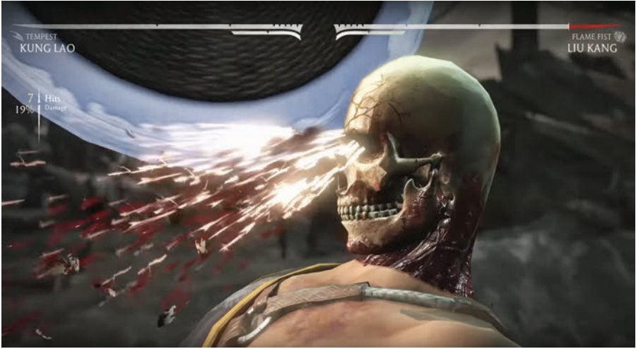
Fig. 19. The game camera zooms in for a mid-round close-up of internal damage from Kung Lao's hat in an "X-ray move" in Mortal Kombat X .