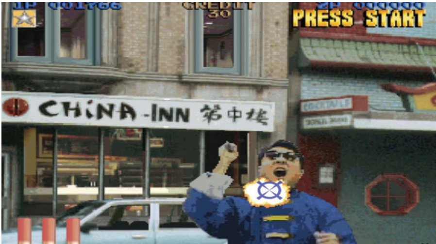
Fig. 15. Simple pixelated sprites, featuring photorealistic images of Asian stereotypes, in the “Chinatown Assault” level of the rail-shooter Lethal Enforcers .

rough-edged law enforcement theme is more consistent with Dirty Harry 's right-wing gun fetishism and reworking of Old West-style justice in a modern guise. “As was the case with Kombat , nobody said a word about the arcade version of the game,” but now it is “guaranteed to be the next big hit on Capitol Hill,” the Washington Post opined (Carter and Carter 1993b). Whereas peripherals like the Lethal Enforcers light gun (“The Justifier”) were once attached to arcade cabinets, now this life-size plastic “weapon” was advertised for SEGA’s home consoles under the tagline “You won’t find a toy like this in any Cracker Jack box”—a shameless appeal to children, according to Herbert Kohl (C-SPAN 1993). Yet, I argue that rail-shooters are more properly “cinematic” than FPS games because players cannot actually control the camera movement as it moves along the predetermined “hard rail” like an amusement park ride, much as movie viewers are passively subject to the changes in angle and perspective determined by the director. With forward momentum along the rail permitted only by successfully clearing the screen of enemies, it is little surprise that the player’s trigger-happy progression seemed to outweigh any potentially redeeming themes of killing bad guys and making quick judgments to avoid shooting innocent civilians.