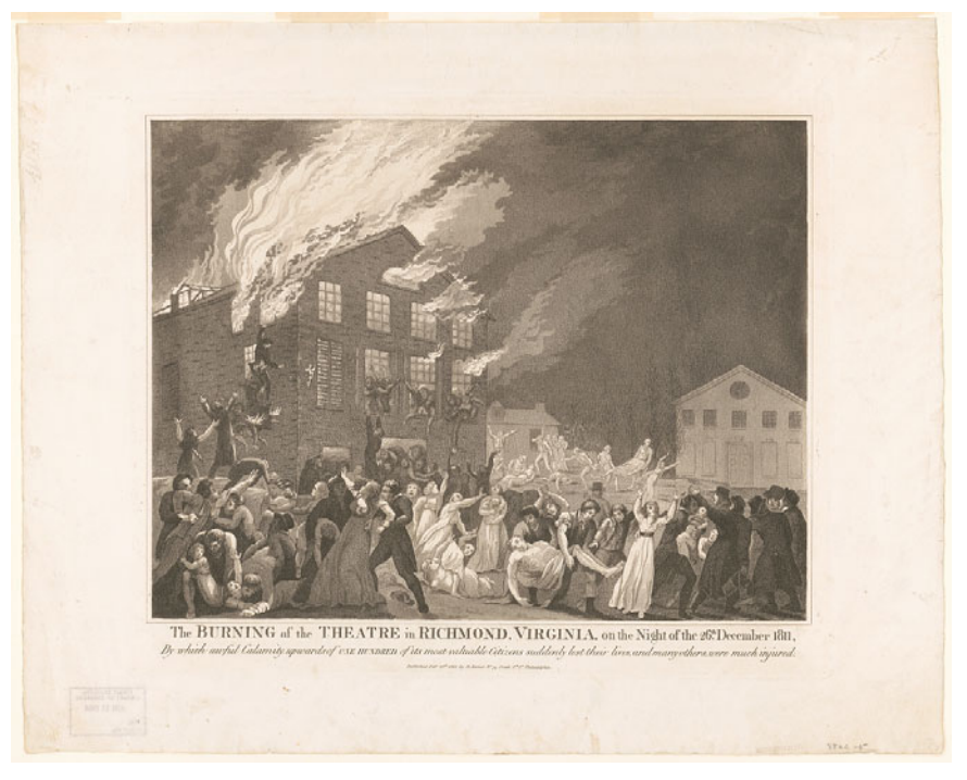
Figure 12.4 John Lossing Benson, The Burning of the Theatre in Richmond, Virginia, on the Night of the 26th. December 1811. Philadelphia: Benjamin Tanner, 25 February 1812.

On the left, a prominent figure faces the building with his arms raised outward, while a child falls in front of him; however, it is difficult to tell if the man is actually catching the girl or has simply fallen out of the window backwards before her. There is no clear scene where anyone is going into the fire or towards the building. Those who are rescuing victims are taking them from the ground in front of the burning structure and moving them towards relative safety.