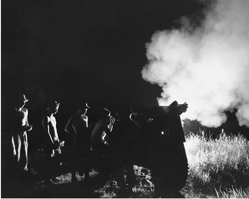
FIGURE 7.3 As part of the Commonwealth war effort during the Malayan Emergency, Australian gunners fire their twenty-five-pounder field gun during a nightly shoot against communist insurgent camps or trails in the jungle.

In Indonesia, the final Dutch tactical publication of the war likewise explicitly stressed the need for heavy weapons to free up manpower (but warned against ammunition wastage because of logistical problems—note that the issue of “collateral damage” did not feature in this warning). 84 In Indochina, Indonesia, Algeria, and to a lesser extent in Malaya, artillery support to the infantry was frequently given and even more often requested. This was also true of air support. 85