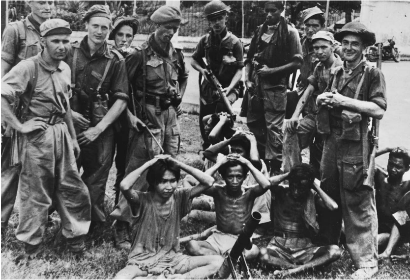
FIGURE 1.3 Dutch troops pose with a captured mortar crew of the Indonesian Republic Army (TNI) in Central Java during the second major Dutch offensive, December 21, 1948.

respective Dutch and British processes of denial, deflecting responsibility, and neutralizing scandals, while organized in different ways, had surprisingly similar outcomes in terms of institutionalizing impunity and thus condoning violence. Thus, while contemporary explanations for extreme violence preferred to place the blame on the aberrant behavior of individuals, a closer study of the evidence concerning what was known at the time and how that knowledge was processed points toward more systemic and structural causes.