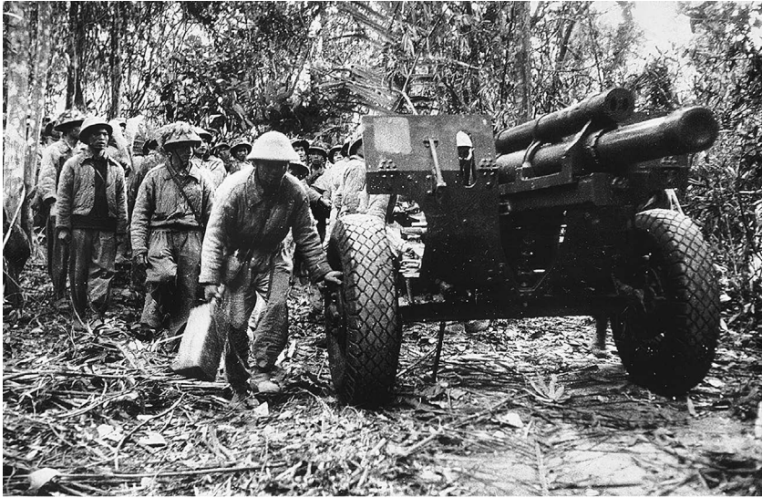
FIGURE 6.1 Vietminh troops move Chinese-built artillery in preparation for the battle of Dien Bien Phu, 1954. The Indochina War was the only war of decolonization in which Western forces were locally matched or trumped in heavy military equipment on the ground.

In Indonesia, the battle of Surabaya taught the belligerents important lessons early in the conflict and paved the way for a different outcome. After the Japanese capitulation on 15 August 1945, followed two days later by the Indonesian Proclamation of Independence, British-Indian troops temporarily occupied several so-called key areas in the archipelago. In Surabaya in November 1945 the heaviest battle of the entire war would take place, in which artillery, air power, tanks, and naval gunfire all played an important part. During the initial stages of the fighting, inadequately armed British-Indian units were overrun by numerically superior Indonesian fighters. British losses ran into the hundreds. After Brigadier Mallaby, commander of the 49th Indian Infantry Brigade, was killed by insurgents on October 30, General Sir Philip Christison (commander of the Indonesian theater) famously threatened “to bring the whole weight of my sea, land and air forces and all the weapons of modern war against them until they are crushed,” a warning that was acted on ten days later, on November 10. 37 The British opened with a naval bombardment by three destroyers, followed by a bombing campaign from the air by RAF Thunderbolts and Mosquitos and from land by the Royal Artillery. After weeks of heavy fighting and thousands of Indonesian