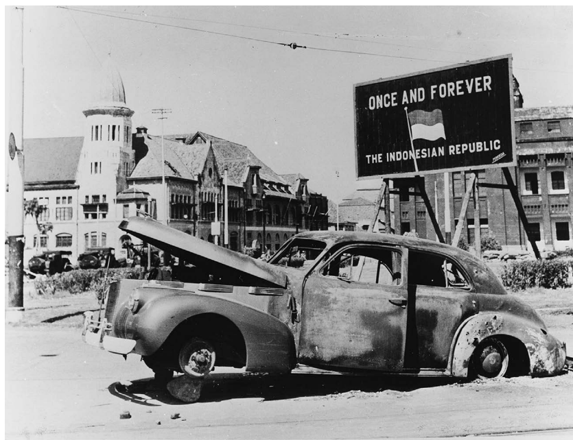
FIGURE 4.2 The burned-out car of British brigadier A. W. S. Mallaby on the spot where he was killed in Surabaya during the partial British occupation of Java, 30 October 1945. This incident further escalated the urban battle between British troops and Indonesian forces in the key city.

would last for three weeks. British determination to punish and destroy the enemy met revolutionary fury and the determination to defend Surabaya at all costs. The battle took the lives of thousands of Indonesian fighters and noncombatants, destroyed most of their military equipment, and devastated the city of Surabaya. Ninety percent of the population fled the city. 66 The battle of Surabaya showed similarities to the French attack on Haiphong one year later. Both cities were destroyed, but the French and British had different motives and drew different conclusions. Whereas the French decided to regain colonial control and saw Haiphong as an example to be replicated, the British had their revenge and were even more eager to leave Java and Sumatra as soon as possible. The restoration of Dutch colonial authority was never a priority to them. The British were only able to leave Java in November 1946 owing to the cumbersome Dutch-Indonesian negotiations and the slow arrival of Dutch troops after they were allowed back starting in March 1946.