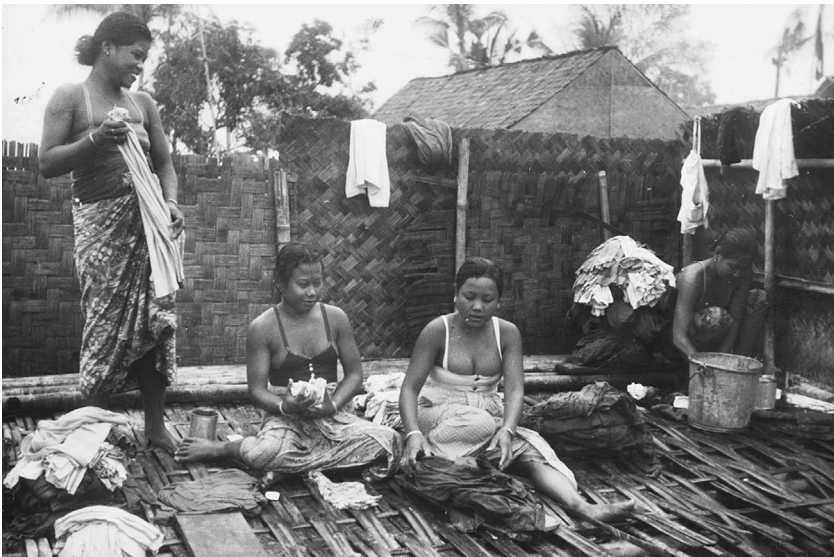
FIGURE 5.2 Four “ baboes ” wash uniforms inside a military encampment in 1949. In Indonesia, unlike in Algeria, such local female workers were common on military bases and smaller posts during colonial times. Dutch military personnel often had intimate relations with these women, but sexual abuse also occurred in this setting.

produced by former members of a Dutch army unit in 1996, one veteran recalls being encouraged by fellow soldiers to have sex with a clearly non-consenting baboe : “At a certain moment, they were getting me drunk or half drunk, and started to offer me one of their many baboes , who luckily said, Tida mau, toean (which means, I don’t want to, sir).” 22 In both these accounts, baboes are not considered individual women with agency, but rather as part of the services of a barracks. In fact, baboes often had the additional informal “task” of providing “sexual relief” to the unit. Local commanders would make such arrangements to prevent their men from contracting venereal diseases when visiting prostitutes (in Algeria, the French army formally created military brothels for the same purpose of “sexual release”). In a diary account, H. van Hoorn describes traveling a long way with a group of men and lodging as guests at an army logistical base in Banjoewangi: “[We] went to town to have some food and went to bed early. We had traveled for 270 miles. At night we were woken by a lot of noise and ado. It turned out to be R. who was after the baboes of our hosts. This is really impolite; one should not behave this way as guest.” 23 This is not to say that all sexual contacts between baboes and Dutch military personnel could be characterized as