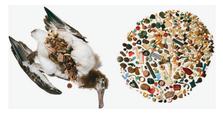
Fig. 3.2 "Shed Bird" (Liittschwager and Middleton 2005, 210–211)

Chris Jordan's photography has a famous precursor: the Shed Bird image (which is often displayed as a singular image comprising two photographs, as below) (Fig. 3.2).