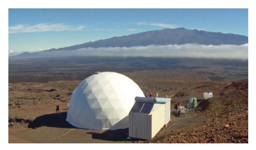
Fig. 7.1 The HI-SEAS (Hawai'i Space Exploration Analog and Simulation) habitat on Mauna Loa on the island of Hawai'i.

on the crew's ability to endure the psychological and emotional stress of the long isolation of NASA's mission to Mars (see Kizzia 2015, 3, 11, 13; Stuster 1996, xii–xiv). Twelve eventful months later, the mission came to a successful end: the twelve Martian colonists proved that human beings were capable of enduring long periods of isolation on the red planet.