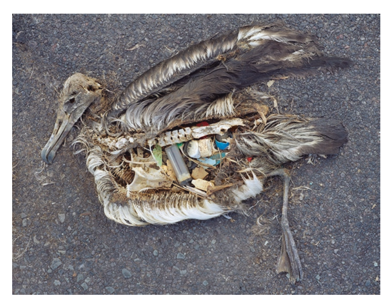
Fig. 3.1 Chris Jordan's "CF000313" (2009) from "Midway: Message from the Gyre" (http://www.chrisjordan.com/gallery/midway/#CF000313%2018x24), © Chris Jordan

It is not that the plastics are inert (far from it—they killed the bird and present an ongoing problem to all kinds of sea-life), nor that plastics themselves are necessarily bad (again far from it—our modern lives are immeasurably better, more diverse, and manifestly abled because of them), but that as litter, their interactions pose material, and thus political and cultural, questions and demands for us. (2012, 209)