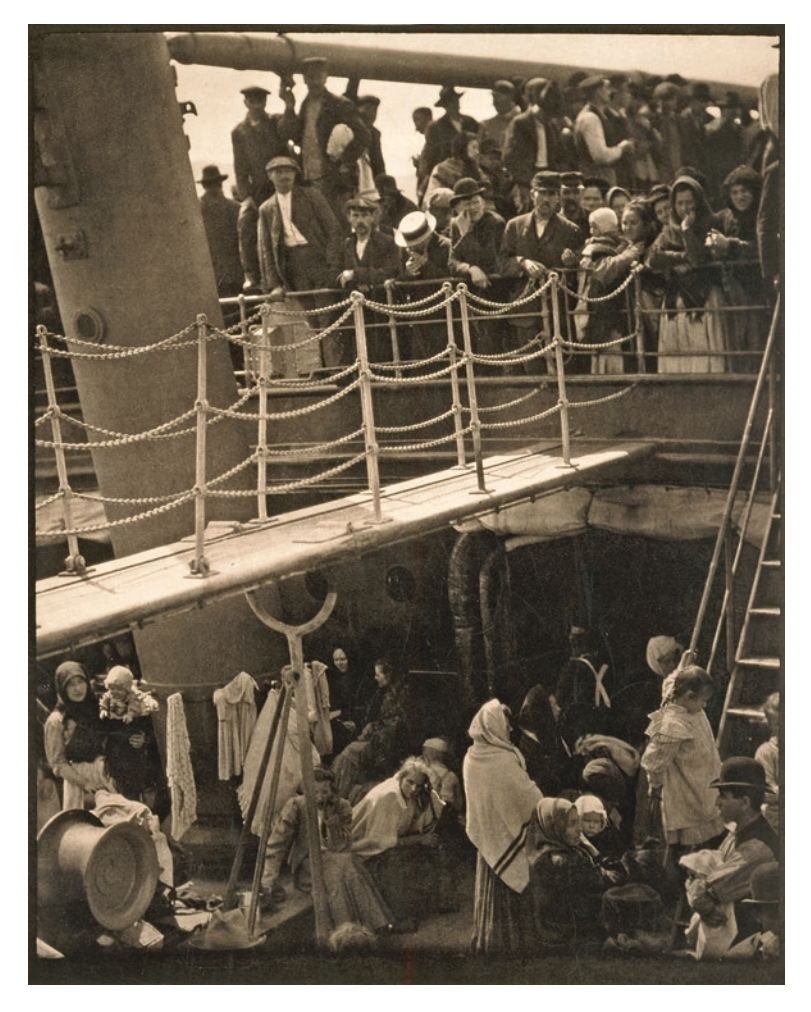
Fig. 8.1 Alfred Stieglitz, The Steerage (1907). Los Angeles County Museum of Art, https://collections.lacma.org/node/195304

In this interpretation, The Steerage no longer stands for a strict twofold class separation—as was often claimed—but instead exemplifies the increasing interconnection of Europe and the United States. After all, at the beginning of the new century, it was not only poor emigrants who crossed the Atlantic for the New World, but also increasingly wealthy