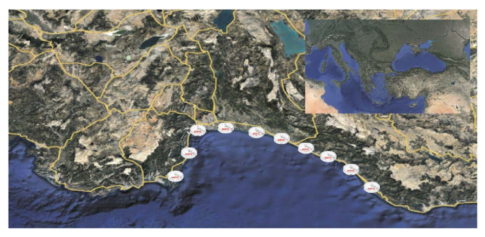
Figure 1 – Study area.

Sludge samples were collected from wastewater treatment plants located around Alanya, Beldibi, Belek, Çamyuva, Göynük, Hurma, Kemer, Serik, Side and Tekirova districts of Antalya province of Türkiye on a monthly basis for one year (Figure 1).