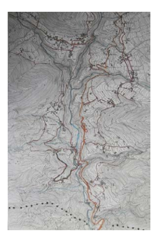
Figure 14 – Amalfi, Scala, Ravello, plan. Figure 15 – Tramonti to Pucara at Polvica, plan.