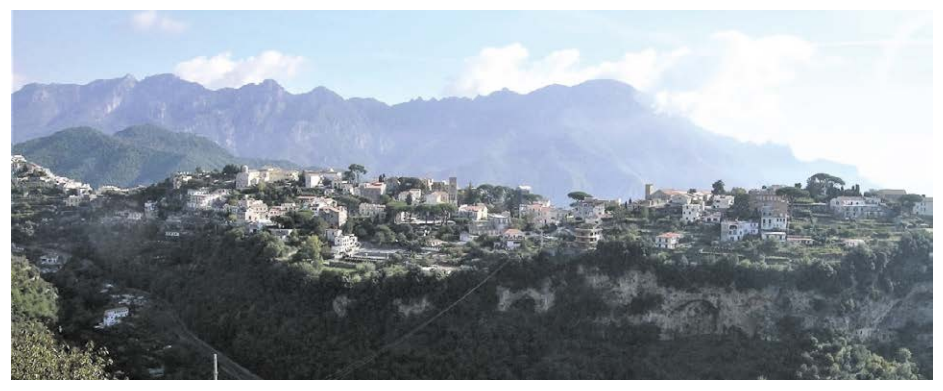
Figure 13 - Ravello.

Tramonti extends into the Reginna basin, north of Maiori, on a vast territory, in which steep parts alternate with others of moderate slope, with a complex and atypical aggregation. It consists of thirteen hamlets, which go from south to north on the two sides of the valley where the river flows with its tributaries, composing small villages around a church, exploiting more or less flat areas and connected by a dense network of streets, today, made almost entirely suitable for vehicles. Running from an altitude of 150 m a.s.l. of Pucara at 650 m of the Chiunzi pass, has extremely varied landscapes, from almost maritime to mountainous, with woods that take over as you go upwards [19].