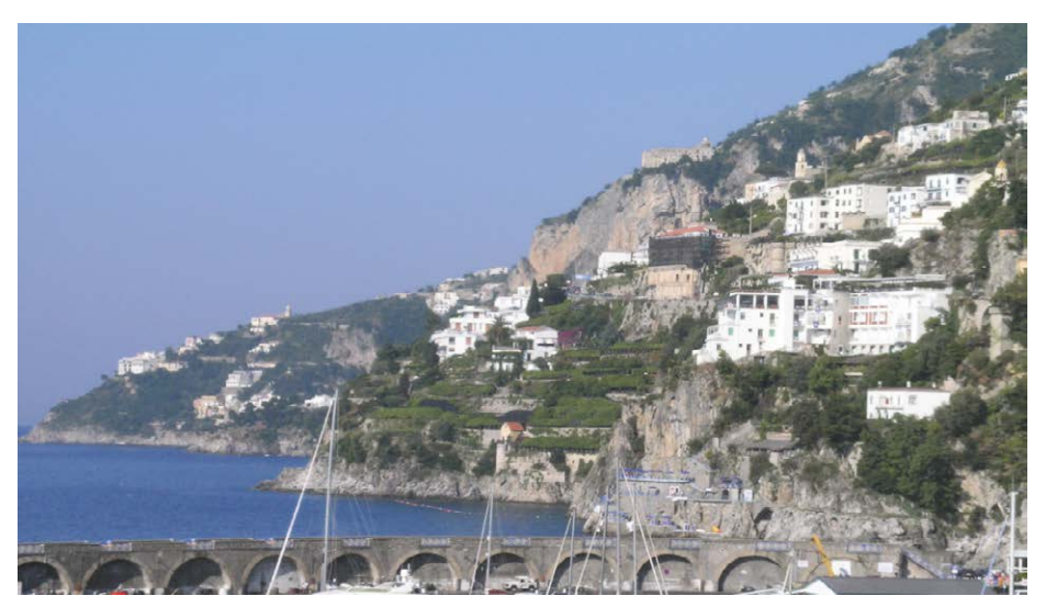
Figure 9 - The coast from Amalfi to Conca dei Marini.

The same condition is found in Conca dei Marini, closed to the north by high rocky walls, to the south by overhanging cliffs and to the east and west by deep gorges.