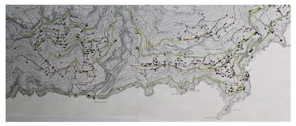
Figure 10 - Furore, Conca dei Marini, Tovere, plan.

Here, in the hospitable areas, small scattered agglomerations and a tiny nucleus were formed near the natural harbor, up to the mid-nineteenth century among the few sheltered landings near Amalfi. The buildings were arranged along the edges of the road - today made suitable for vehicles - which, following the slope, completely crosses the municipal territory from east to west, welcoming from the mountain and valley tiring stairways and touching the three parishes around which they settled in the Middle Ages the urban centers, reaching the border with Furore. About halfway there is the only open space, from which the connection with the larger nucleus started, extended on the promontory of the "Vreca, from where it branched off towards Capo di Conca, with the viceregal tower, and towards the Marina [21].