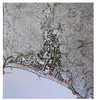
Figure 7 – Maiori, plan. Figure 8 – Vietri sul mare.

The original center is located on the slopes that flank the central flat sector,