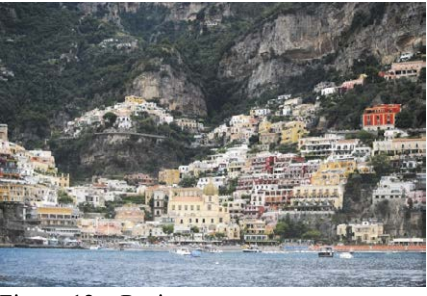
Figure 12 – Positano.

The eastern side, which descends to the "Spiaggia Grande", is gentle, the opposite occupies the sides of the hill that rises between the central beach and that of Fornillo, extending to the top. The primitive structure, even if it is not disturbed by the state road, which surrounds it upstream with a sinuous trend, however, appears to have changed due to the enlargement of some old tracks. Despite this, the ancient road network is still identifiable, which features longitudinal main roads, connected by orthogonal secondary roads that go up the ridges, serving the residences which, leaning against the rocky bank, constantly change orientation [21].