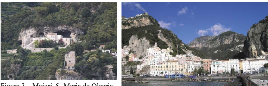
Figure 3 – Maiori, S. Maria de Olearia. Figure 4 – Amalfi from the sea.

Some cases are famous, such as S. Maria de Olearia, installed inside a large cave, near Maiori, with a composite structure including the monastic residence and three superimposed chapels, decorated with important frescoes [1].