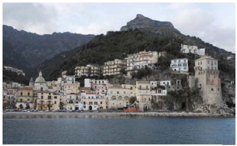
Figure 5 - Atrani.