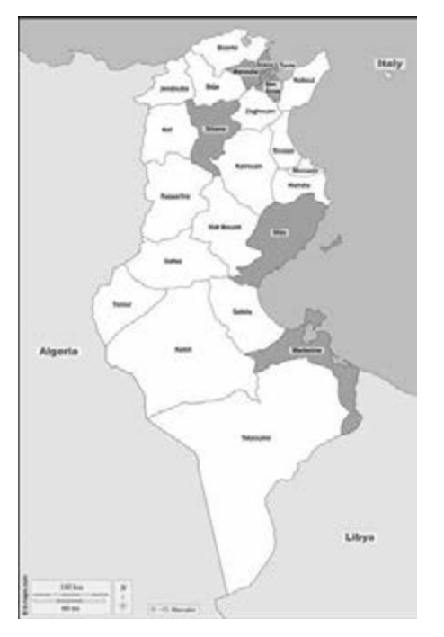
Figure 1 Tunisia governorates and fields of investigation