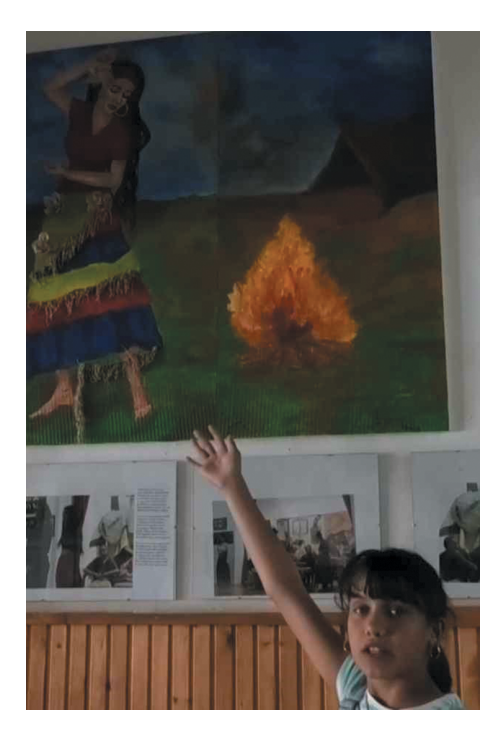
Fig. 5: Pupil verbally interpreting the image.

This cultural aspect is enriching to representatives of other groups as well: to the young girl, this picture comes to life, and people not belonging to Roma communities can't see that dance until then she performs it. That is, group-external people might not access some cultural references that are taken for granted for members of another group, but visual representations as well as related performances make such references accessible, at least partially, to all. In this case, interaction with and about a schoolscape item triggered a short dance performance, that is, an element of Roma dance culture got embodied in the translanguaging space of the school.