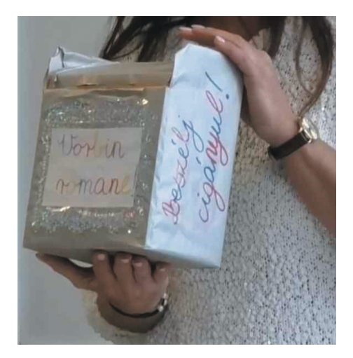
Fig. 3: Teacher holding the "Speak in Romani!" box during classroom discussion (27: 2.04–2.09).