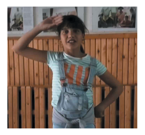
Fig. 6: Pupil contextualising the image through dance performance, first dance movement.