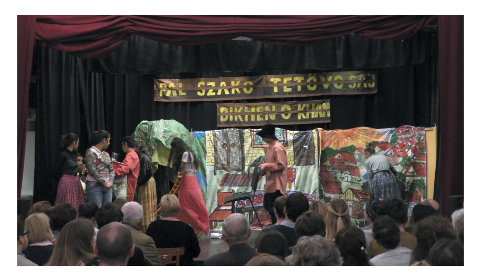
Fig. 1: Scene from the theatre performance in Budapest.

with the participation of learners in 6<sup>th</sup> and 7<sup>th</sup> grade. Other participants included university students, researchers, school teachers, and, in the final stages of the project, a few adults living in the Roma neighbourhood and three former students of Magiszter. The project ran from April to November in 2018. Teachers in Magiszter held weekly theatre workshops, assisted once a month by Budapest-based researchers and teacher trainees. These took place in the Tanoda , a learning centre and community hub in the Roma neighbourhood. Preparatory work during the spring term was followed by a four-day summer school where the text of the performance was memorised. The props and stage design elements were also handmade by the children in the Tanoda with assistance from research team members. Finally, three performances took place in the autumn (Fig. 1).