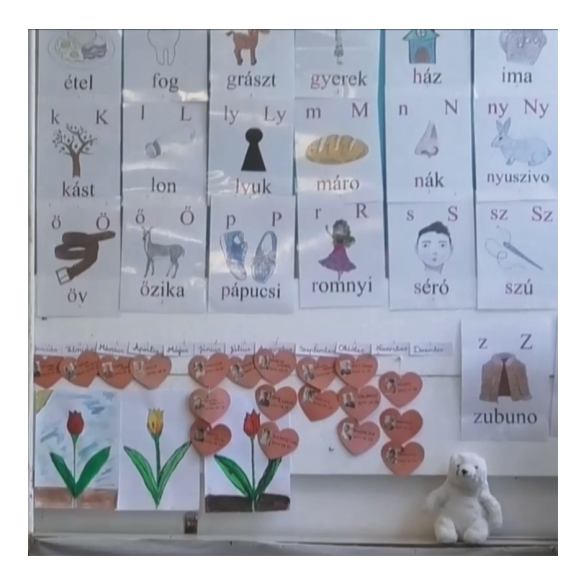
Fig. 2: The "Romani alphabet" displayed on the wall (27: 1.42–1.45).

makes the development of literacy skills easier since the pupils do not need to learn two separate orthographic conventions in parallel. Further, this principally phonemic orthography makes it possible to represent the dialectal characteristics of pupils' speech (for further details, cf. Chapter 13). For example, pupils are free to write down the words according to how they speak and how they hear others speaking.