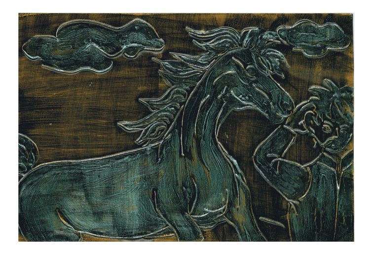
Fig. 1: Copperplate made by a local child for the storybook.