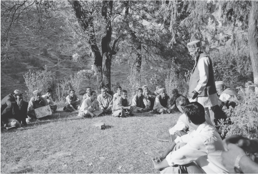
Figure 2.6 A meeting of kardars in Kullu district.