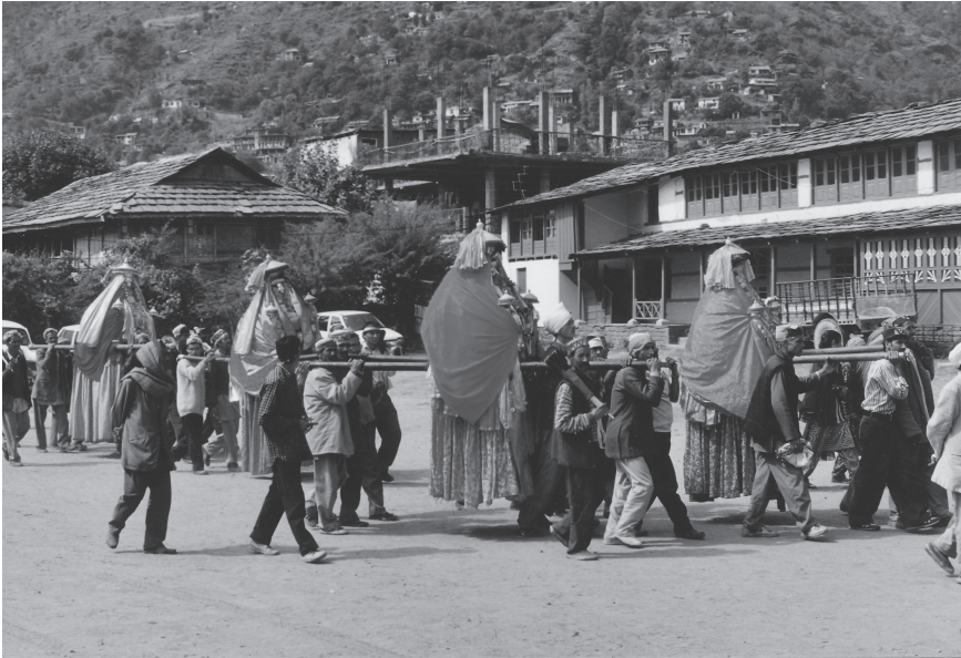
Figure 2.2 Gods' palanquins brought to Kullu for the Dasher festival.