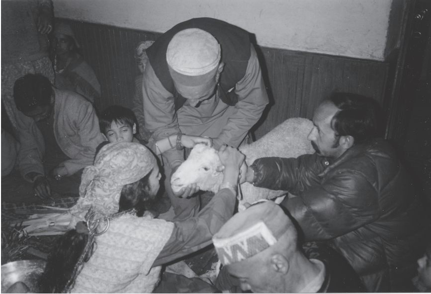
Figure 2.4 Preparing the animal before sacrificing it in order to get rid of a ghost, Kullu district.