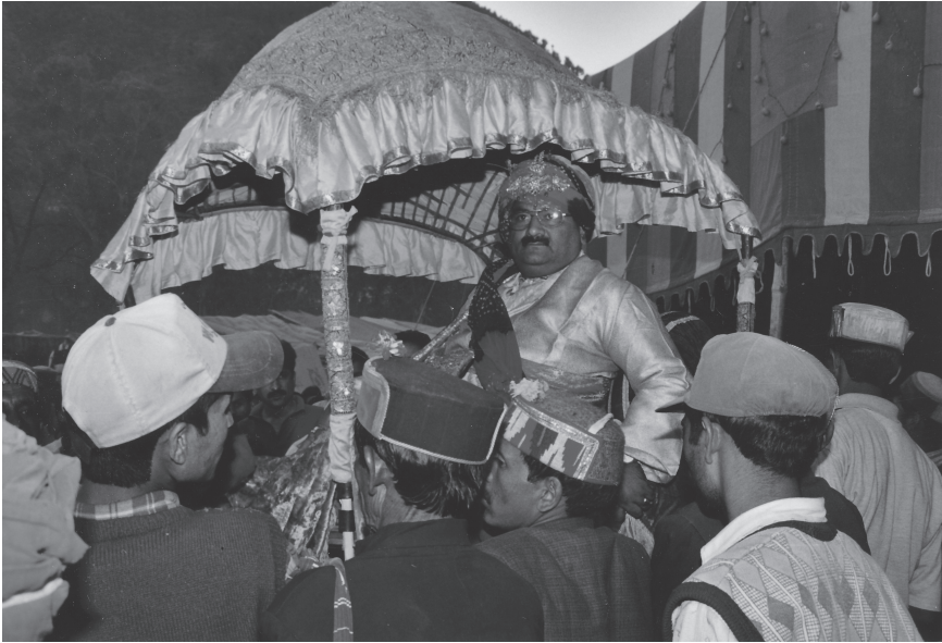
Figure 2.1 Maheshwar Singh, in his royal palanquin, is carried around the town during Kullu Dashera.