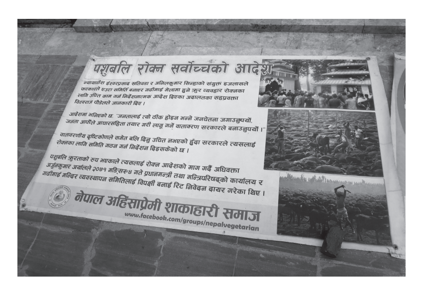
Figure 7.9 The Supreme Court judgment is presented in the banners used during the antisacrifice demonstrations. Pashupatinath Temple, July 2018.