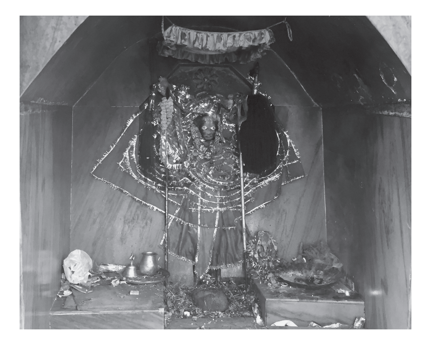
Figure 7.2 The goddess Gaḍhī Māī, March 2017.