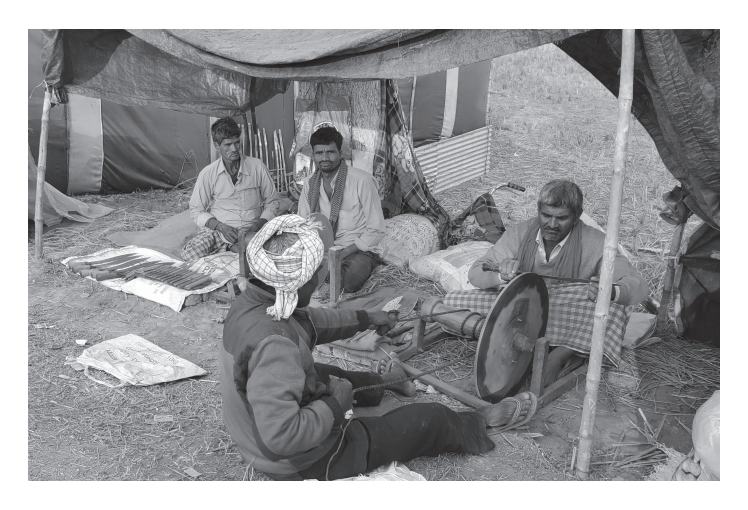
Figure 7.7 Sharpening the sacrificial swords and knives on the eve of the sacrifice, December 2019.