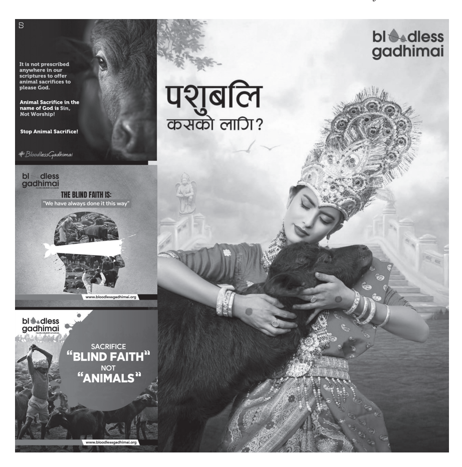
Figure 7.10 Posters from the Facebook public page of the campaign Bloodless Gadhimai 2019.