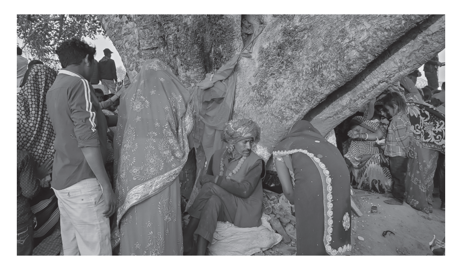
Figure 7.5 The Brahmasthān, place of Brahma/Baram Bābā, at the foot of a ficus tree, December 2019.