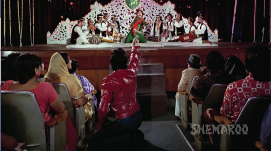
Figure 2.2. View from the audience perspective of Akbar (Rishi Kapoor) and his qawwali party onstage singing “Parda Hai Parda,” Amar Akbar Anthony (dir. Manmohan Desai, 1977).

If the qawwali party is one representation of the broader social world, the diegetic audience is another manifestation thereof. The collective and public nature of the genre—and the publicness of the romance staged in classic qawwalis—is amply evident in the way qawwali audiences are picturized. Unlike most romantic duets, Hindi cinema’s classic qawwalis tend to be set not in empty or remote locales, but in public spaces designated for artistic performances. Whether the venue is a formal theater or a more intimate mehfil , the singers sit on a raised stage or platform and face row on row of guests (see figure 2.2). Frontal and tracking shots establish the spatial relationship between the singers on the dais and the audience. Thus, even when the qawwali seems addressed to a single beloved, there is always a larger group listening in and responding. Like the backup singers onstage, the diegetic audience is active and engaged. Those assembled sway to the music. They smile and nod in appreciation. At times, they interject with an appreciative wah wah! and even join in the singing. By the end of many a performance, the audience is on its feet, cheering and applauding. In short, classic qawwalis presume and gather an eager listening public.