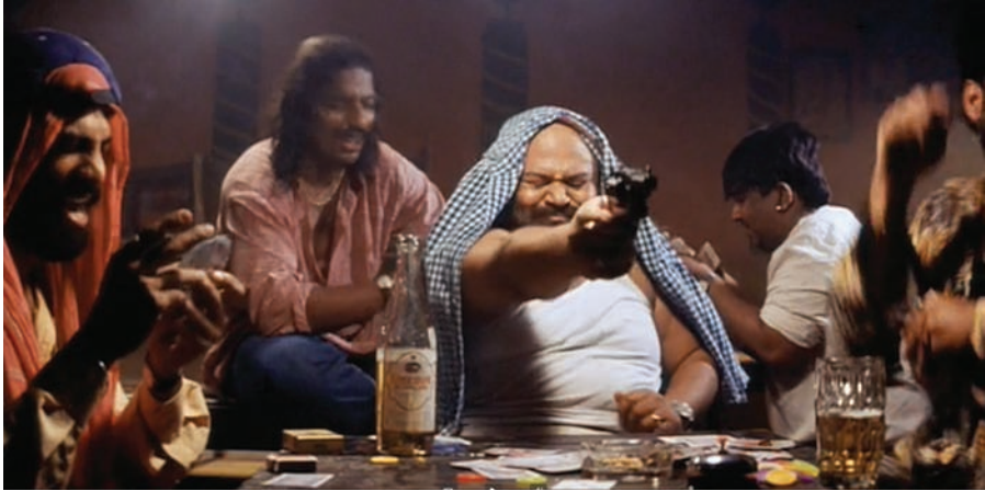
Figure 3.2. Dhichkiaoon! “Goli Maar Bheje Mein,” Satya (dir. Ram Gopal Varma, 1998).

Earlier in this chapter, I argued that Satya mobilizes xenophonic accents that might otherwise seem out of place in Bombay. Notice how the film makes the same point, if in more abstract and playful fashion, with cinematic sounds not usually heard as language. Dhichkiaoon is a sound that is musical—pronouncing this sound effect demands familiarity with its musicality, the ebbs and flows of this arrangement of phonemes. 97 This sound/word/sound effect erases the line between music, speech, and sound. It is, in so many ways, the perfect “aural punctum .” 98 It demonstrates that even words that sound nonsensical (to some) can make sense and speak to our senses. This is particularly true in the cinematic city of Bombay, which Satya takes as its subject. The film reminds us to attend to sounds of all kinds, whether or not they are words voiced by the hero, and whether or not those words are pronounced “correctly.” “Goli Maar” ends with a loud crash. We have no option but to listen.