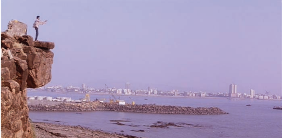
Figure 3.1. “Mumbai ka king kaun?” asks Bhiku Mhatre (Manoj Bajpayee) in Satya (dir. Ram Gopal Varma, 1998).

daughter recites the nursery rhyme “Twinkle twinkle, little star.” Implicit in his laughter is the knowledge that the colonial tongue is a mark of sophistication. Bhiku’s fluency in Marathi and Hindi—and Bumbaiyya—demonstrates his rootedness in Bombay, but it also threatens to mark him and his family as too provincial.