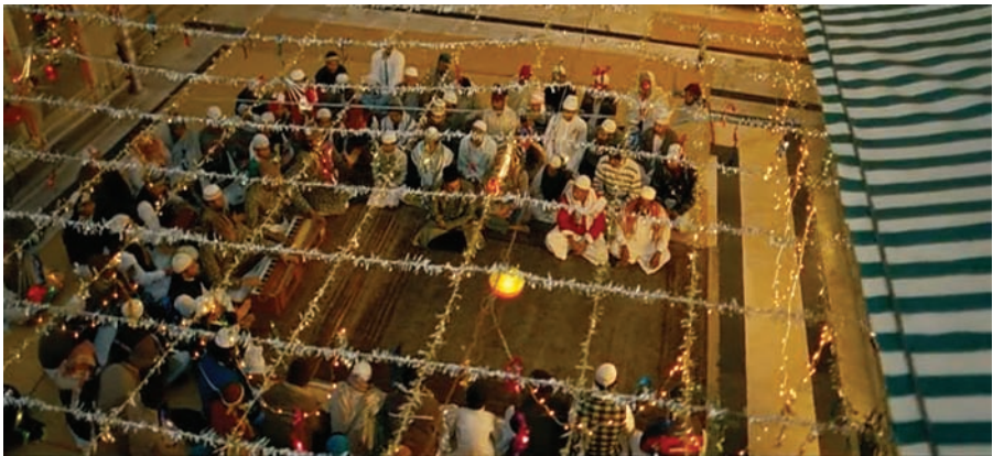
Figure 2.5. God's-eye view of the dargah qawwali “Kun Faya Kun,” Rockstar (dir. Imtiaz Ali, 2011).

indicating a connection between the men and god. As the dervishes rise and start rotating in place, Akbar closes his eyes and tilts his head up; a flash of light in the sky marks the heightened state he reaches in that moment. He then rises and joins the dervishes' whirling. The intensity of Akbar's spiritual experience is thus compared to Jodhaa's bhakti , her devotion to Krishna articulated elsewhere in the film. 165