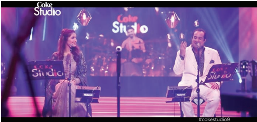
Figure 2.3. Momina Mustehsan looks on as Rahat Fateh Ali Khan sings in the Coke Studio version of “Afreen Afreen” (2016).

frames her as the awestruck one. The camera captures her looking over at her senior colleague, marveling at his voice just like everyone else in the room (see figure 2.3).