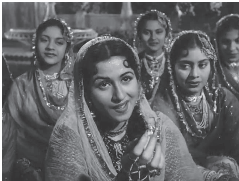
Figure 2.1. Anarkali (Madhubala) singing the qawwali “Teri Mehfil Mein,” Mughal-e-Azam (dir. K. Asif, 1960).