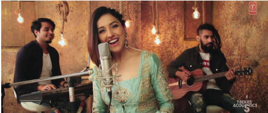
Figure 1.2. Neeti Mohan singing a version of her song “Nainowale Ne,” from Padmaavat (dir. Sanjay Leela Bhansali, 2018), on a music video for the album T-Series Acoustics .

the public sphere. As “Female Singers’ Adda” demonstrates, stardom rests not just on singers’ vocal talents (or their association with particular actors) but also on their visual presence on various media platforms and on audiences’ knowledge of the range of their musical skills. 129 They render songs in music videos; in staged shows; in interviews recorded for television, radio, or YouTube channels; and in making-of videos. This last genre shows singers in recording studios as they practice, and play with, melodic and rhythmic variations on their lines. A quick YouTube search shows us just how widely available still images and video clips of singers performing their hit numbers are. Such paratexts ensure that the musicking body of the singer is no longer invisible. 130 These new kinds of paratexts affect not just clause 4 of the audio-visual contract but clause 2 as well: sound and image now stand in a different, more dynamic relationship to each other than they did in the past. 131