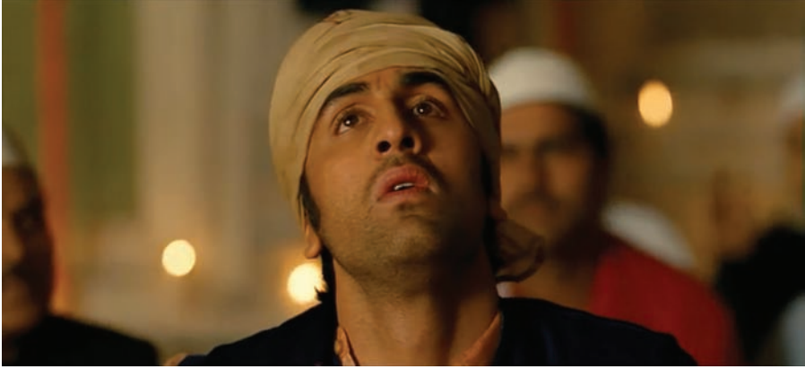
Figure 2.4. Jordan (Ranbir Kapoor) experiencing a spiritual moment during “Kun Faya Kun,” Rockstar (dir. Imtiaz Ali, 2011).