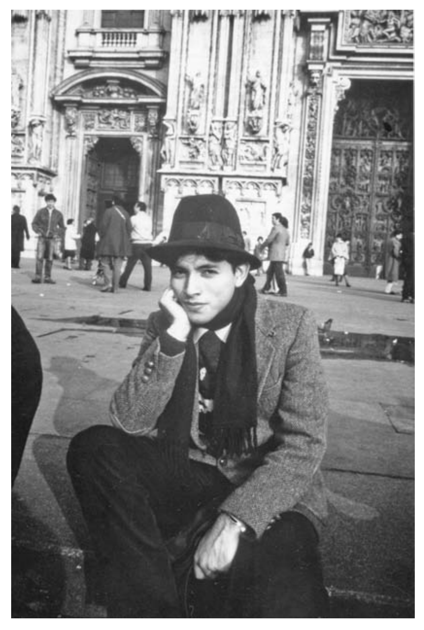
The author wearing fake Versace outside Il Duomo, Milan, Italy, 1982