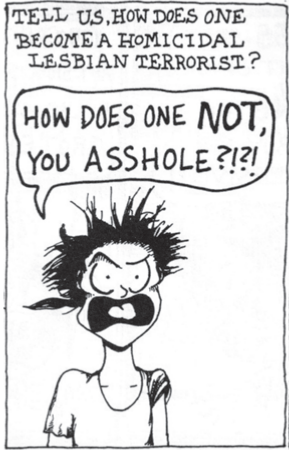
Hothead Paisan: Homicidal Lesbian Terrorist.

projection that she must eliminate not only “the machine” but “the man” as well, Hothead ventures maniacally into the world hell-bent on vengeance, packing a small arsenal and an enormously overinflated ego. Like the Incredible Hulk, her actions are swift, her decisions are final, and her judgment is impaired by a rage of epic proportions.