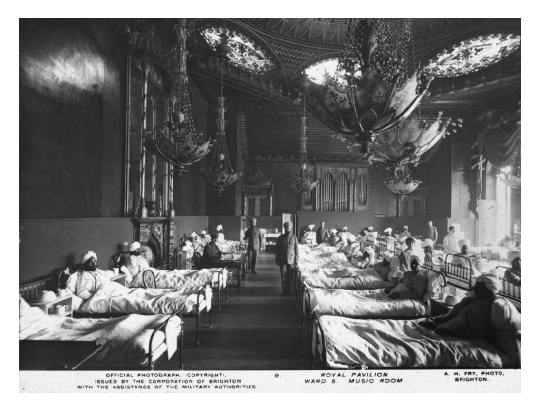
Figure 2.1 Magic lantern slide showing Indian soldiers in beds in the Music Room of the Royal Pavilion during its use as a military hospital, 1915.

designs down into the room. Here we can get an idea of how the men reflected in the chandeliers and mirrors of Borden's casino may have looked. The monochrome of the image is only able to reveal the contrast between the white of the sheets, the patients' clothes and their turbans, and the grey of the rest of the room, when in reality the room is brightly decorated with bold reds, oranges, and gold.