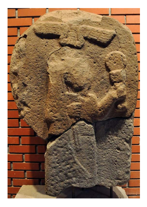
Fig. 5. Stele appearing to represent Kubaba from Domuztepe in Cilicia

The Tabalean Kubaba is known from sources dating to about the second half of the 8<sup>th</sup> century BC. In most cases, the inscriptions are reflective of a Hurro-Luwian cultic tradition, likely a product of the strong presence of the Late Bronze Age cults of Kizzuwatna just beyond the Taurus (Hutter 2017, 116). Kubaba is most often found alongside Tarhunza, sometimes paired with Ea, and occasionally with other traditionally Hurrian gods like Ḥebat, Šarruma, and Alašuwa. She mostly functions as a litigator in curse formulae (KAYSERİ, KARABURUN), in one case through her agent "the ḤASAMI-dog of Kubaba" (KULULU 1), but is also found receiving dedications following a royal building project, perhaps including shrines(?) (ÇİFTLİK; perhaps something similar in KULULU 5), and in a late inscription providing favor to a local ruler (BULGARMADEN). While these examples are suggestive of a primarily Kizzuwatnean tradition behind the local cult of Kubaba, one Tabalean reference to Kubaba of Karkemiš in a curse formula of a subject of Wašušarma is indicative of cultural interaction in the cultic sphere (SULTANHAN), perhaps expressed through a Karkemišean elite transplant or an extension of the Karkemišean cult into the Tabalean population.