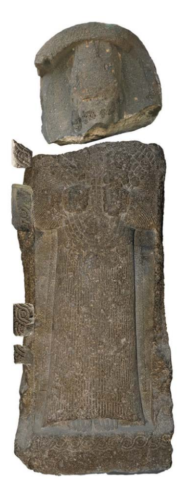
Fig. 2. Stele of Kubaba commissioned by Kamani and discovered at Karkemiš (Marchetti and Peker 2018, 91 Fig. 16)

much the same way as his ancestor; he even suggests a regional importance of Kubaba's cult, justifying his building project as a place for other kings and lords to come worship his tutelary goddess (Stele of Kubaba by Kamani: KA31+A30b1-3; Marchetti and Peker 2018). Likewise, Kamani frequently invokes the divine triad as litigators for his curse formulae, but at this time with a broader range of concerns: not only matters of royal power, but also administrative concerns, such as the sale of homes or estates, or a city charter (CEKKE, KARKAMIŠ A4a, A25b). The remaining references to Kubaba from Karkemiš, mostly dated between the 9<sup>th</sup> and 8<sup>th</sup> centuries BC, all attest to a similar role and position of the deity (KARKAMIŠ A21+A20b, A13a-c, A15e, A18e, A18i-j, ANKARA, KÖRKÜN)<sup>5</sup>. In Karkemiš, Kubaba was a top-tier goddess, who was active in royal legitimation and power and as guarantor of royal proclamations and, in the 8<sup>th</sup> century, in matters of urban administration.