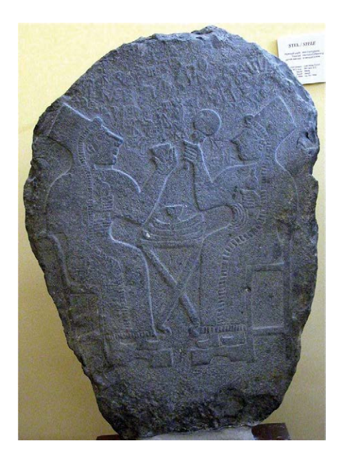
Fig. 3. Funerary stele from Maraš depicting two women with attributes common to Kubaba (Tayfun Bilgin, www.hittitemonuments.com, 1. 77, last visited 02/08/2023)

connected to any specific personal identity (Fig. 3)<sup>8</sup>. Together with the mirror, however, this iconographic assemblage seems to imply some connection with the goddess, perhaps suggesting that Kubaba had some chthonic role at least in the areas where her semiotic markers were attached to the deceased.