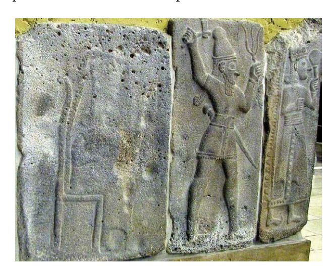
Fig. 6. Orthostats from Zincirli possibly depicting Kubaba flanking a Storm-god