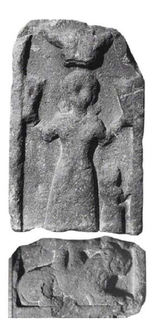
Fig. 7. Funerary stele of Taita (II) of Palastina depicting the Divine Queen of the Land (Hawkins 2000, Pl. 225)