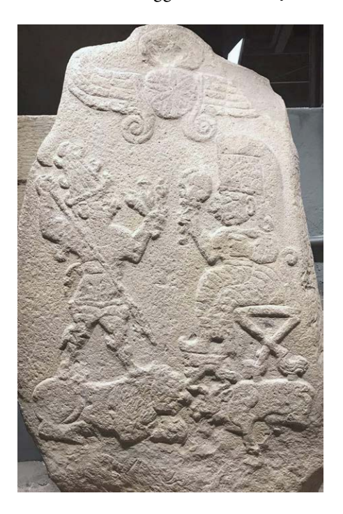
Fig. 4. Stele of Kubaba and Karḥuḥa from Arslantepe

identified as Prince(ss) Tuwati, pours a libation for a goddess before her upon a relief orthostat (Orthmann 1971, A/7; MALATYA 6), while another woman is depicted in at a mortuary repast on a fragmentary monument, unfortunately any object she might have held is lost in a break (Orthmann 1971, B/3; MALATYA 2). These two examples further demonstrate the problem of identifying Kubaba or aspects of her cult: while the former is clearly labeled as a royal figure, the latter appears to have been labeled with a secondary inscription, confusing the matter even more, but perhaps connected to Kubaba through a chthonic role, as suggested in Maraş.