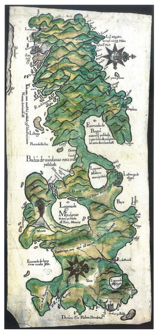
FIGURE 2 Mapa de la isla de Mindanao, donde se fundó el presidio de Zamboanga (Archivo General de Indias MP-Filipinas, 11) WIKIMEDIA COMMONS, PUBLIC DOMAIN