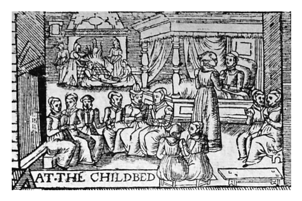
Figure 2.1 "At the Childbed," detail from "The Severall Places Where You May Hear News," c. 1600

in carnivalesque imagery (such as birth-giving deaths, or death-giving births), an imagery that dwelt overwhelmingly on the openings and protrusions of the body—eating, bellies, defecation, and so on—an imagery that Bahktin called "grotesque realism." He described the lower stratum as "the fruitful earth and the womb. It is always conceiving." <sup>50</sup>