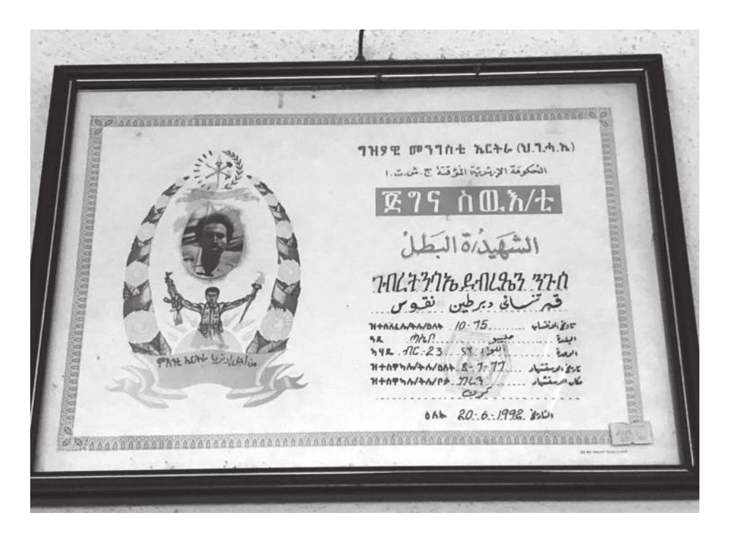
Figure 7.1 Martyr certificate

The critical role of medical expertise in the liberation struggle underscores the scientific authority that makes the martyr certificate possible. The martyr certificate is premised on clinical practices Eritrean doctors and soldiers use to conduct forensic analysis and to thus develop scientific explanations for cause of death. The martyr certificate is made possible by vernacular medical protocols Eritreans developed during the liberation struggle for identifying and documenting cause of death.