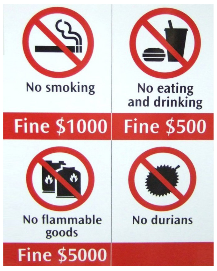
FIGURE 1. A typical sign at a subway station in Singapore, "Singapore MRT Fines." Photo by Steve Bennett, Wikipedia.EN [cropped]. Free to use under a CC BY-SA 3.0 license, https://creativecommons.org/licenses/by-sa/3.0/deed.en.