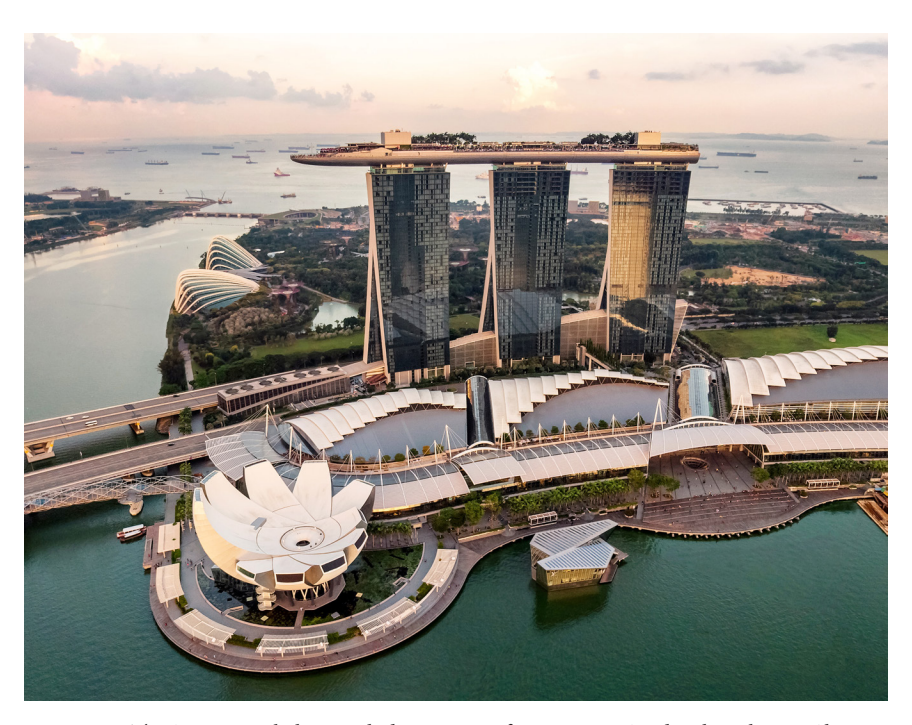
{\tt FIGURE}\, 2. The Singapore skyline, including a view of Marina Bay Sands.

for new forms of labor. The Renaissance City Report , for example, proposed "establish[ing] Singapore as a global arts city . . . and a cultural centre in the globalised world. The idea is to be one of the top cities in the world to live, work and play in, where there is an environment conducive to creative and knowledge-based industries and talent."<sup>22</sup> More than renovating Singapore's image, the economic transition to a knowledge economy would mean making Singapore productive of a "creative class."<sup>23</sup> Achieving such an aspiration, the Renaissance City Report further noted, would mean a reduced role for the state: "Cultural development is a domain in which [the government] is less likely to succeed purely by its control and dominance."<sup>24</sup> Taken together, what we see is that the knowledge economy of Global Asia would require new kinds of economic ideologies and modes of governance.