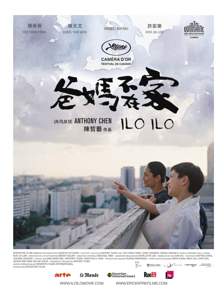
FIGURE 6. An Ilo Ilo poster from the Cannes Film Festival.

Conversations is the low-paying service sector and construction jobs—"unskilled labor," in other words—without which the state's drive to advance its knowledge economy would not be possible. In Mammon Inc. , Singapore's exploitation of unskilled labor is critiqued by Chiah Deng's roommate, Steve, in not very subtle terms: "Your whole economy is built upon the exploitation of the proletariat, and if there's justice in the world, the maids should start a revolution." Although the state relies heavily on such migrant labor to build Singapore's infrastructure, run its service industries, and maintain Singaporean households, such workers are rarely depicted as desirable citizens or residents. Singapore has adopted laws designed to prevent "unskilled labor" from permanent residence, as well as measures that prevent their "mixing" with Singaporeans. The pathways to residency and citizenships for such workers are limited at best, further illustrating the state's privileging of professional-technical labor as well as its efforts to denigrate the forms of labor—domestic or construction workers, for example—that maintain the country's infrastructure or ensure the efficient workings of middle-class and above households.