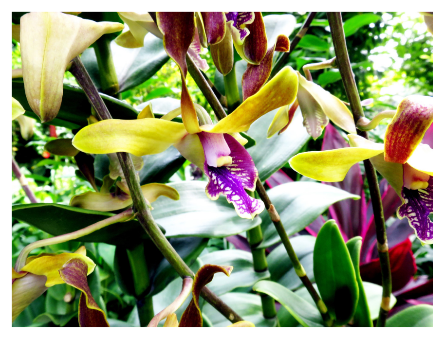
FIGURE 7. Photo of the Dendrobium Barack and Michelle Obama.

minister, Lee Kuan Yew, Lee argued that the liberal, intellectual tradition that flourished in the United States after World War II was causing societal breakdown. Agreeing with the interviewer that he used to admire the United States, Lee went on to say that America's "failed social policies . . . have resulted in people urinating in public, in aggressive begging in the streets, in social breakdown." Lee's comments were made at a time when the Singaporean state performed its national identity through, on the one hand, particularized interpretations of Sino-Confucian values and, on the other, occidentalist logics. Illustrating the latter point, Lee's emphasis on uncontained bodily fluids and invocation of masculinized images of homeless people roaming the street casts the United States as improper and undesirable. Despite the distinct political and economic circumstances in which Prime Ministers Lee Kuan Yew and Lee Hsien Loong were speaking, it is clear from their rhetoric that gender is crucial for comprehending the relations between the two nations.