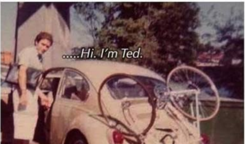
Figure 9. "Hi. I'm Ted."

over that of a man in a fast-food restaurant, with the caption "I don't think there's actually Five Guys in this" (moonlitnitely 2021). There were several very similar images making the same joke. Dahmer's face superimposed onto that of a man sitting on a toilet is captioned "Jeffrey Dahmer dumping his last boyfriend," the deliberately disgusting pun capturing the slide of meaning between dating and digestion (memes4ya 2021). The coincidence of the terms is not entirely random; plenty of words elide sexual and gustatory