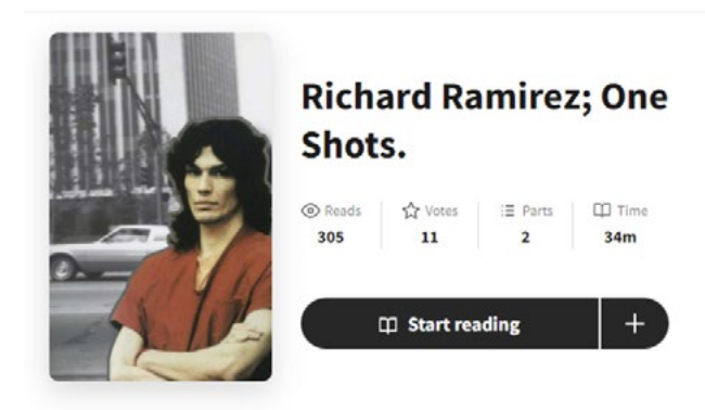
Figure 2. Wattpad story header by richiesshadesofgrey.

Unlike AO3, Wattpad authors frequently integrate images into their title pages and headers. (It is technically possible to integrate images on AO3, but not much practiced as a site norm.) This practice is an illustration of textual poaching via multimedia convergence culture, as well as another form of multimodality. For example, see figure 2 for the header on richies-shadesofgrey's "Richard Ramirez: One Shots" (2022).