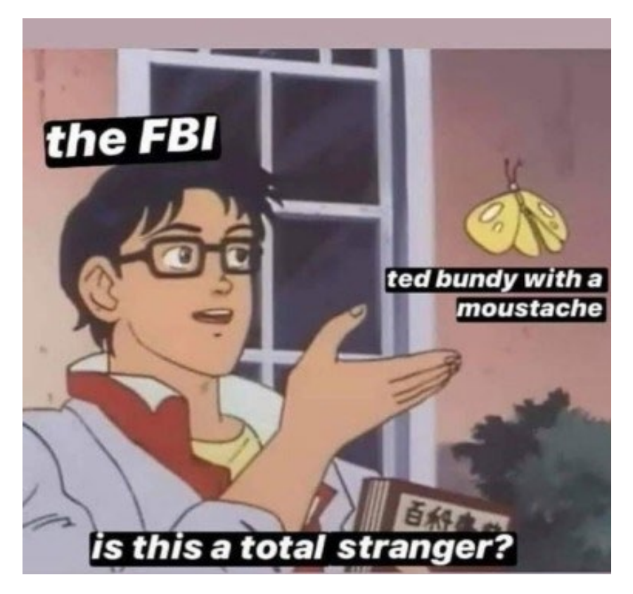
Figure 8. "Is this a total stranger?"

much like the sort of roleplay fans engage in for fictional murderers, mixing properties of the self with properties of the character one is performing. The practice was nowhere near as common on Tumblr as on TikTok (see below). I would describe these practices as simple "identity roleplay," the assumption of a media-created mask for a form of online play that combines known characteristics of the killer with the fan's own personality (cf. Booth 2016, 116). In this way, the roleplay is a key example of Phillips and Milner's ambivalence, tied to a (terrible) reality, one within living memory for some people alive today, yet self-consciously "not real," as the references to one's "dash[board]" illustrate. The real killers would not be making reference to the affordance of their Tumblr account. Besides which, most of them are dead.