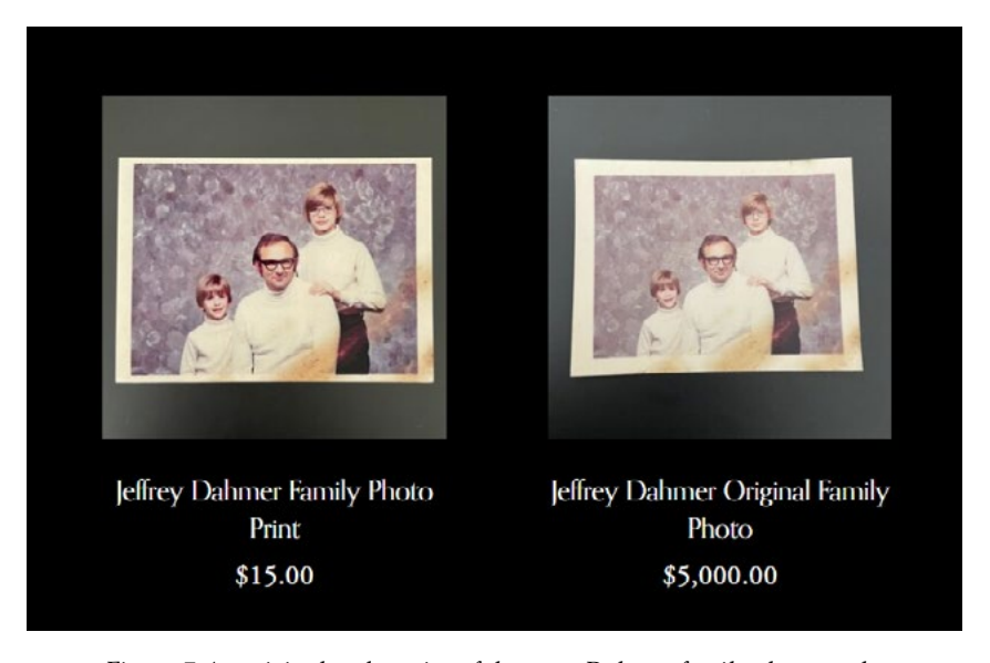
Figure 7. An original and reprint of the same Dahmer family photograph, priced $5,000 and $15 respectively.

about $1,400 (Supernaught) and real courtroom sketches in the high hundreds (Serial Killers Ink). Toward the bottom of the price range, I found the cheap, mass-produced collectibles, like a Bundy "collectors card" for $35 (Supernaught), and the replicas, like a reproduction of Dahmer's seventh grade yearbook photograph for $10 (Supernaught). The difference in value between replicas and originals is neatly demonstrated by figure 7, from Cult Collectibles. This is an original and a reprint of the same Dahmer family photograph, priced $5,000 and $15, respectively: