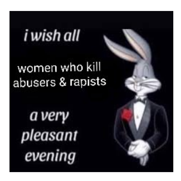
Figure 6. Death justified for abusive men (radykalny-feminizm 2022, originally posted by male-to-catgirl).

Though not explicitly tagged with Wuornos, this post circulates in her fan blogs and is clearly a reference to her. Here is another example of how capital recirculates on Tumblr rather than accruing to particular users. As it circulates, its meaning is inflected, and capital from one field can be "translated" into another. I prefer to use the term "translated," rather than, say, "exchanged," because this is not a one-to-one relation: The informational posts carry weight over from more traditional true crime fandom, but become inflected by fannish affects. Statements on the necessity of retaliatory violence against men cross over from radical feminism, and become inflected with particular fannish appreciation for a woman who killed violent men. Thus I would argue that the theory of subcultural capital can be usefully applied to serial killer fandom on Tumblr—to an extent. It needs to be quite radically modified to account for the relative anonymity of users and the practices of circulation and recirculation that accrue capital to posts more readily than to users (though, as the ranking of search results shows, whole blogs can gain it in some sense). The theory also needs to be modified to account for those instances where capital moved between and across fields, and the practice