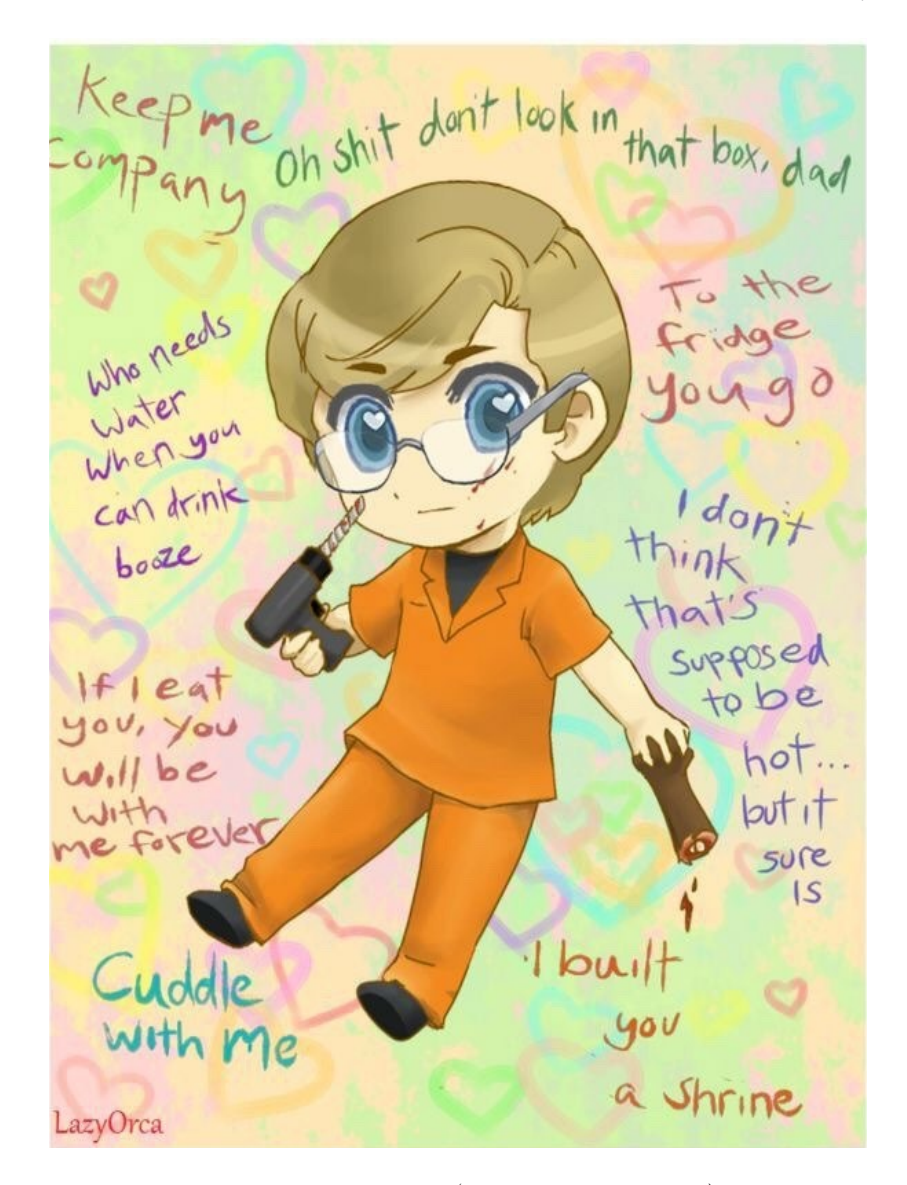
Figure 4. Dahmer fanart (datingdahmer-blog 2017a).