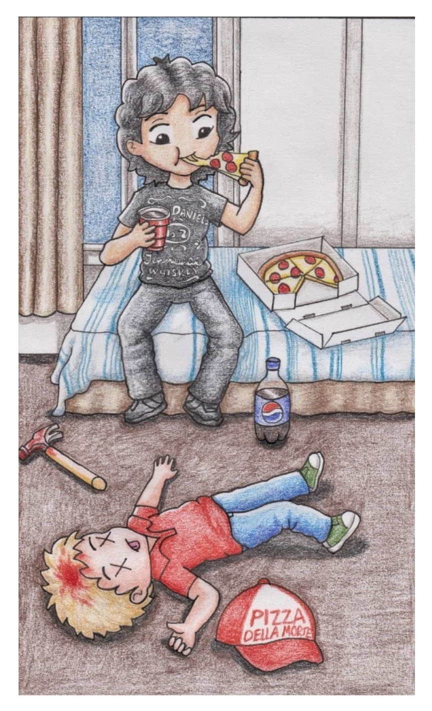
Figure 3. Ramirez fanart (nightst4lkerxx 2021a).