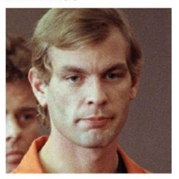
Figure 5. Jeffrey Dahmer "identification card" (datingdahmer-blog 2017c).

with the URL slug "ted-bundy-is-my-sugar-daddy" contained nothing related to Ted Bundy, just a range of images from films with a bleak aesthetic and jokes about depression. The troll/joke category plays up the absurdity broached in the cuteifying theme more explicitly, with more obvious irony and cynical humor. One example is the circulation of some sort of killer "identification cards," as in figure 5. The juxtaposition of "causes feels" and "ate people" is obviously humorous (although—it should be noted—objectively true). This again perhaps says more about media culture than it does about killer fandom specifically. Impositions of cartoon characters and puns over serial killers are commonplace. Bundy pontificating in court is captioned: "Not only do I feel ya—I necrophilia" (sick-girl-666 2021b); and a news story on a typo that briefly legalized cannibalism instead of cannabis in Ottawa is juxtaposed with an image of Dahmer edited with glowing laser eyes, a meme convention to convey intense interest and enthusiasm (sick-girl-666 2021c). Atrocity and tragedy humor is fairly widespread; these texts are rendered fannish primarily by their inclusion in fannish blogs and by the expressions of affection contained within the jokes. For this reason, I would still consider them an act of textual poaching, intended for circulation by and within a