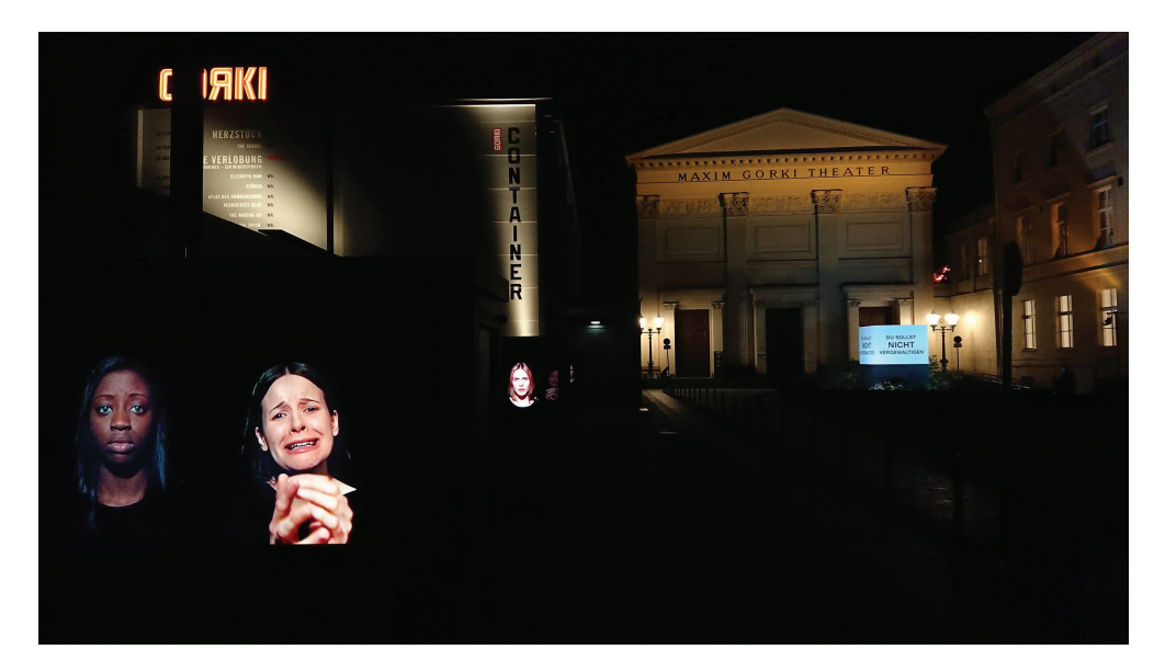
Figure 4.3 Atom Egoyan, Auroras , 2007. Video installation in public space, 4th Berliner Herbstsalon, 2019. To reach the Gorki Container and the Gorki Theatre, visitors had to walk along Egoyan's four-screen video installation in which seven 'Auroras' recited texts from the book Ravished Armenia by Aurora Mardiganian, a survivor of the Armenian Genocide in 1915.

venue, one sign seemingly commenting on the historical root and cause of the abusive remark in Kamerić's Bosnian Girl : it's 'Patriarchatsmüll' ('patriarchal rubbish'). Before reaching the theatre entrance, visitors would pass between a repetition of the salon's agitational call for de-heimatization, painted in huge capital letters on the wall of the Gorki