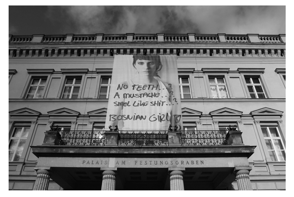
Figure 4.4 Šejla Kamerić's photographic banner Bosnian Girl , 2003. Public project based on black and white photograph, materials and dimensions variable. Installed above the entrance to Palais am Festungsgraben, the main venue of the art exhibition of the 4th Berliner Herbstsalon, 2019. © Galerie Tanja Wagner, Berlin. Photograph: Lutz Knospe.