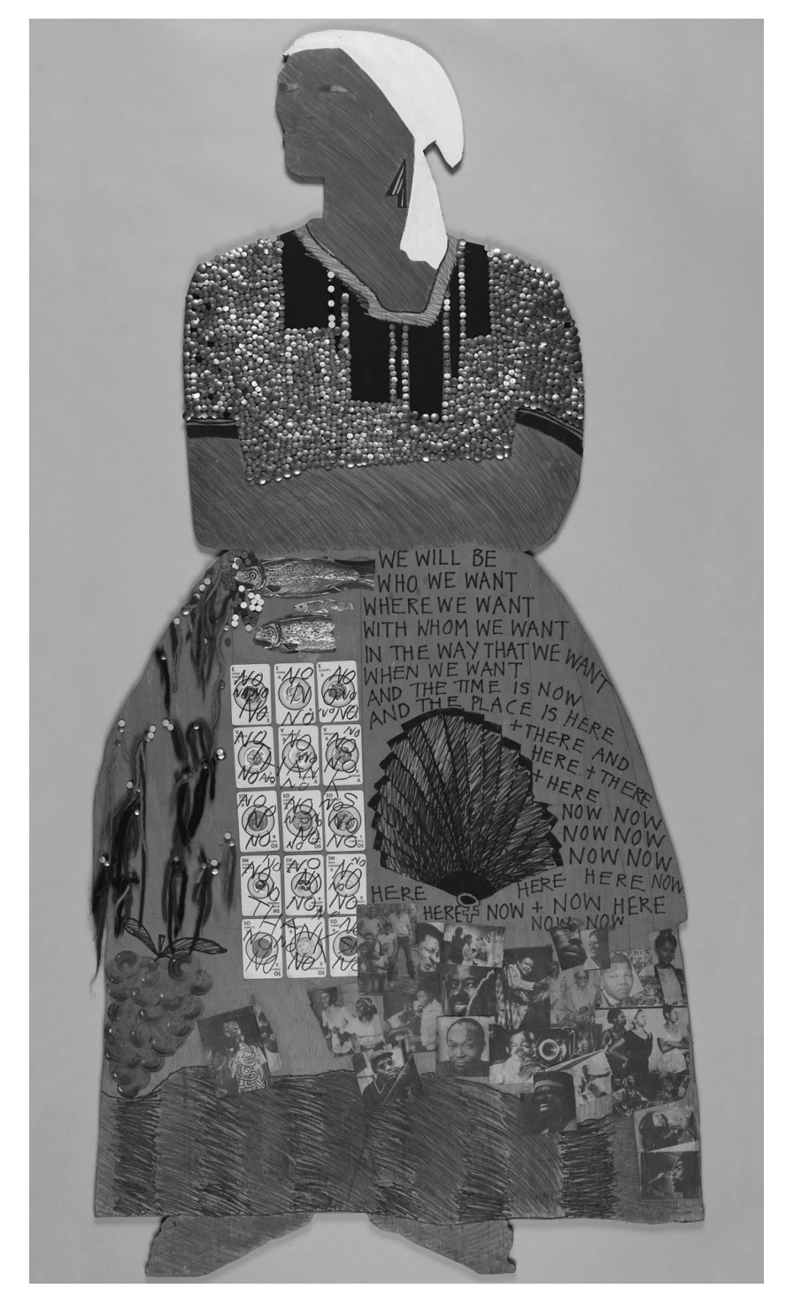
Figure 0.2 Lubaina Himid, We Will Be, 1985. Newsprint, marker pen, paper, drawing pins, watercolour, crayon, pencil, yarn, foil and playing cards on plywood, 182 × 89 × 10.5 cm. National Museums Liverpool, Walker Art Gallery, Liverpool.