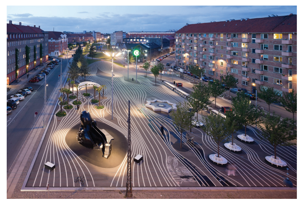
Figure 6.2 Superkilen , 2012. Urban park in Copenhagen. Det sorte marked ('The Black Market'). Commissioned by the City of Copenhagen and Realdania. Developed by Superflex in close collaboration with Bjarke Ingels Group (BIG) and Topotek 1.

different migrant and non-migrant backgrounds were asked to nominate specific city objects, such as benches, bins, trees, playgrounds, manhole covers and signage, from other countries. The project group sought to engage as many people as possible in proposing objects through posters in libraries, a call on the Internet and a catalogue of objects that could inspire local residents to think about specific objects instead of mere functions (such as playgrounds, benches and more light and green areas).