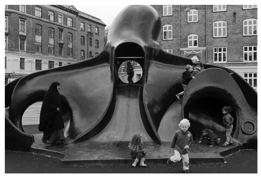
Figure 6.4 Superkilen , 2012. Octopus from Tokyo, Det sorte Marked ('The Black Market'). Commissioned by the City of Copenhagen and Realdania. Developed by Superflex in close collaboration with Bjarke Ingels Group (BIG) and Topotek 1.

Zooming in on the Den røde plads (see Figures 6.3 and 6.5), this area is designed for various types of physical and social activity, such as boxing, basketball, resting on swings or simply passing through the area on foot or bicycle. The selection of urban objects is variegated and contradictory, giving visual and spatial expression to the demographic heterogeneity of the neighbourhood. Overall, the aesthetics of the square could be described as deliberately pursuing a lack of aesthetic uniformity.<sup>21</sup> As Martin Rein-Cano of Topotek 1 has explained: