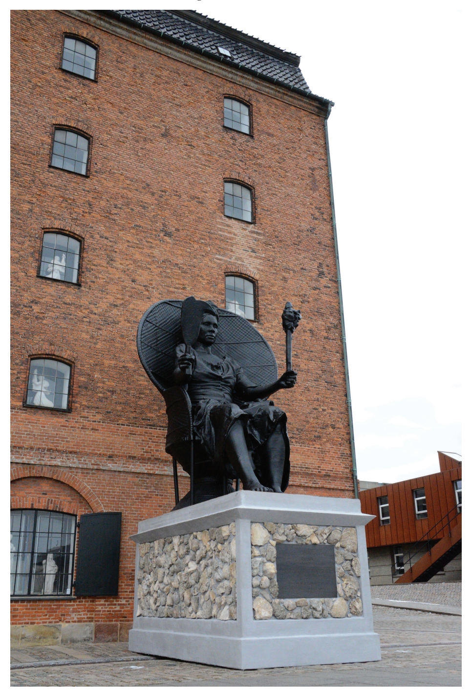
Figure 5.4 La Vaughn Belle and Jeannette Ehlers, I Am Queen Mary , 2018. Polystyrene, coral stones and concrete, height 7 metres, depth 3.89 metres. Harbour Front outside the West Indian Warehouse, Copenhagen Harbour.