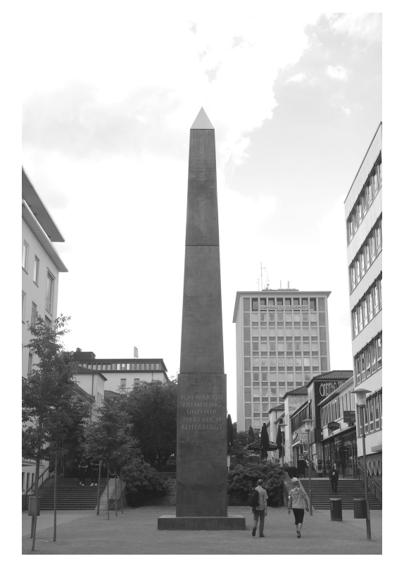
Figure 5.3 Olu Oguibe, Das Fremdlinge und Flüchtlinge Monument ('Monument for Strangers and Refugees'), 2017. Concrete. 3 × 3 × 16.3 metres. Shown here in its permanent location in Treppenstraße, Kassel.

about newcomers is a natural and legitimate reaction. It is an awareness of the fact that 'charity is an act of faith' and that even though newcomers bring new skills and culture that enrich the community, 'you take a risk when you take people in'.<sup>50</sup> Consequently, host anxiety cannot simply be reduced to xenophobia. Notably, Oguibe explains this point without making any concessions to anti-immigration sentiment, as he refers to the pertinent historical example of immigration to the Americas: European colonizers and settlers were strangers who brought a lot of pain, and not only good things. And they did not bring peace. Oguibe's own pro-refugee position becomes clear, however, when he repeatedly declares that the principles of hospitality and gratitude are a 'natural law' that he himself learnt about in early childhood in the late 1960s when his family was forcibly displaced as a consequence of the Nigerian-Biafran War.<sup>51</sup>