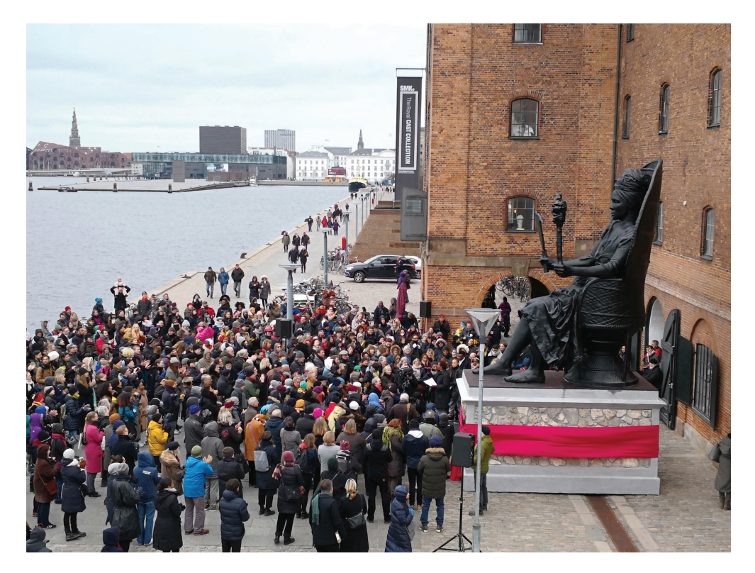
Figure 5.1 La Vaughn Belle and Jeannette Ehlers, I Am Queen Mary. Polystyrene, coral stones and concrete, height 7 metres, depth 3.89 metres. Inauguration on March 31, 2018, on the Copenhagen Harbour front, outside the West Indian Warehouse. Photograph: Thorsten Altmann-Krueger. © Courtesy of the artists.

I Am Queen Mary is the first monument in the country to critically commemorate Danish colonialism and complicity in the transatlantic slave trade. It drew extraordinary national and international media attention when it was inaugurated in 2018 (see Figure 5.1). The fact that I Am Queen Mary was marked on Google Maps<sup>3</sup> - when the nearby latemodernist sculpture by Søren Georg Jensen (1976-1979) is not, but Jacques-François-Joseph Saly's famous equestrian statue of King Frederik V (1753-1774) on Amalienborg Palace Square, at the heart of Frederiksstaden, is – is indicative that I Am Queen Mary, in a remarkably short time span, became a public attraction and gained a reputation as a seminal contribution to postcolonial counter-memorialization. Belle and Ehlers's memorial thus provides me with an opportunity to explore the important intersection of postmigrant and postcolonial perspectives in art. In this Copenhagen context, the postcolonial perspective is understood to be a critical lens through which Europe is seen as a product of its own colonial legacy. I introduce the concept of re-memorialization along with some thoughts on what distinguishes postmigrant re-memorialization before I turn to a series of recent monuments and some of the struggles over monuments and other markers in urban space. I will also look at examples from both American and European contexts to describe more accurately the differences between re-commemoration on