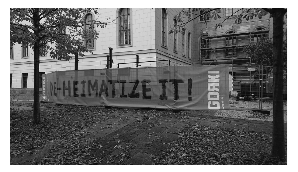
Figure 4.1 The Maxim Gorki Theatre's banner announcing the 4th Berliner Herbstsalon's title and battle cry'DE-HEIMATIZE IT!', 2019.

In what follows, I will focus on the Maxim Gorki Theatre's 4. Berliner Herbstsalon ('4th Berlin Autumn Salon') in 2019 in order to dig deeper into the question of how makers of critical artistic and social form can offer imaginaries of transition that may alter the infrastructures of sociality.<sup>18</sup> I have chosen this event because it explicitly interrogated the preservationist perception of Heimat , as suggested by its headline 'DE-HEIMATIZE IT!' The event offered a platform for discussing the role played by Heimat as an infrastructure of the German social imaginary, manifesting itself in both society and politics (see Figure 4.1). My case study pursues three different but interconnected avenues. First, it explores how the Gorki Theatre sought to challenge the discourse on Heimat by articulating a counter-discourse on 'de-heimatization' and multiple belonging; second, it considers the ways in which the organizers and participants communicated their social critique by