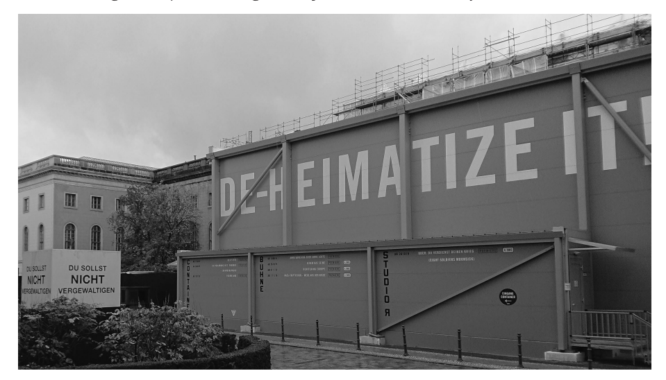
Figure 4.2 The square in front of the Maxim Gorki Theatre used for public art and to communicate the idea of 'de-heimatization' during the 4th Berliner Herbstsalon, 2019.