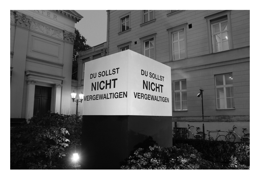
Figure 4.5 Regina José Galindo, No violarás ('Thou shall not rape'), 2013. Cubic light box installation in public space, 4th Berliner Herbstsalon 2019. Photograph: Lutz Knospe.

Figure 4.4 Šejla Kamerić's photographic banner Bosnian Girl , 2003. Public project based on black and white photograph, materials and dimensions variable. Installed above the entrance to Palais am Festungsgraben, the main venue of the art exhibition of the 4th Berliner Herbstsalon, 2019. © Galerie Tanja Wagner, Berlin. Photograph: Lutz Knospe.