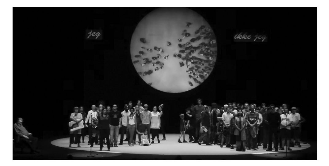
Figure 0.1 100% København ('100% Copenhagen'), 2013. Theatre production by Rimini Protokoll in collaboration with Metropolis/Copenhagen International Theatre and the Royal Danish Theatre. Screenshot from the video documenting the performance published on YouTube.

Thus, a core strategy of 100% City was to portray the participants alternately as a visually mediated community and as individuals and groups differing from and among one another.<sup>52</sup> By having these one hundred Copenhageners enact a series of statistical groupings of the answers – like a giant pie chart brought to life on stage – 100%