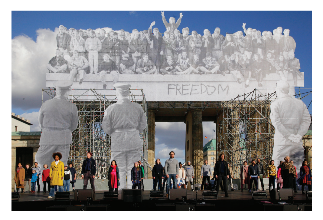
Figure 0.3 Marta Górnicka, Grundgesetz ('Basic Law'). Production of the Maxim Gorki Theatre premiered on October 3, 2018, at the Brandenburg Gate, Berlin.

This question was articulated by the artistic form of Grundgesetz , with its combination of a collective performance by a diverse cast – expressing themselves through recital, singing and choreography – and a political intervention in a public space rich in history and symbolic meaning, a very special place associated with both unity and division: the division of Germany into two states, that is, two social and ideological systems, after the