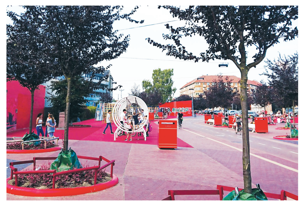
Figure 6.5 Superkilen , 2012. Swings from Bagdad, Den røde plads ('The Red Square'). Developed by Superflex in close collaboration with Bjarke Ingels Group (BIG) and Topotek 1.

visible that Nørrebro is a conflictual and culturally heterogeneous area with a history of battles over urban space, such as the struggle over the children's playground Byggeren (a pet name derivative of Building Site) in 1980 and the battle over Ungdomshuset ('The Youth House') at Jagtvej 69.23 The young squatters and other regulars who had claimed the right to use the building as a venue for social and cultural activities were evicted in 2007 when the Faderhuset evangelical free church ('The House of The Father') bought the property and had the building demolished. This conflict with the church and the municipality engendered fierce protests from left-wing groups, in combination with riots in the streets. The protests were rekindled from time to time, most vigorously in 2011. Seemingly oblivious to the open wound of the local conflict, the American street artist Shephard Fairey decorated a gable end facing the vacant plot with a mural painting of a white dove entitled Peace. Fairey's mural started a veritable war of images, as Peace was vandalized with graffiti. Fairey eventually agreed to collaborate with former members of the 69 Youth House on redecorating the lower half of the mural with images of riot police and explosions, together with the combative slogan of the protesters: 'Nothing forgotten, nothing forgiven'.24