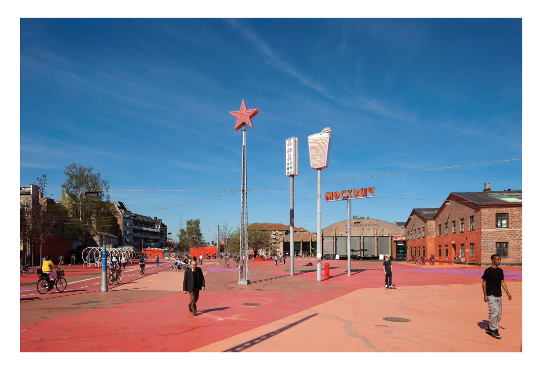
Figure 6.3 Superkilen , 2012. Urban park in Copenhagen. Den røde plads ('The Red Square'). Commissioned by the City of Copenhagen and Realdania. Developed by Superflex in close collaboration with Bjarke Ingels Group (BIG) and Topotek 1.

It is not surprising that Daly reaches the conclusion that many of the objects fail to facilitate intercultural encounter in a satisfactory manner, considering that he completely overlooks that visual artists have played a leading role in the project group's initiative to integrate objects from other countries, and that it was never a criterion that all objects should enable practical bodily use and initiate social interaction in and of themselves. Symptomatically, Daly's study does not even mention Superflex, or Topotek 1 for that matter, nor does it consider the intercultural participatory process through which the project group selected the objects. Only the architects BIG are credited as creators. Due to his disregard for 'art', Daly overlooks the 'unserviceable' function of the objects as signifiers with a potential to anchor collective and individual memories. Moreover, by considering the individual objects separately, he overlooks their significance as an ensemble of objects comprising a plurality of symbols that can stimulate individual affective identifications while also 'identifying' the neighbourhood as plural and inclusive. It is telling that Daly refers to the people living in the area as 'residents' or 'locals', and when they interact with the objects of Superkilen they are designated 'users' and not 'citizens' or 'viewers'. His choice of words thus plays down the role of visual sensory experience