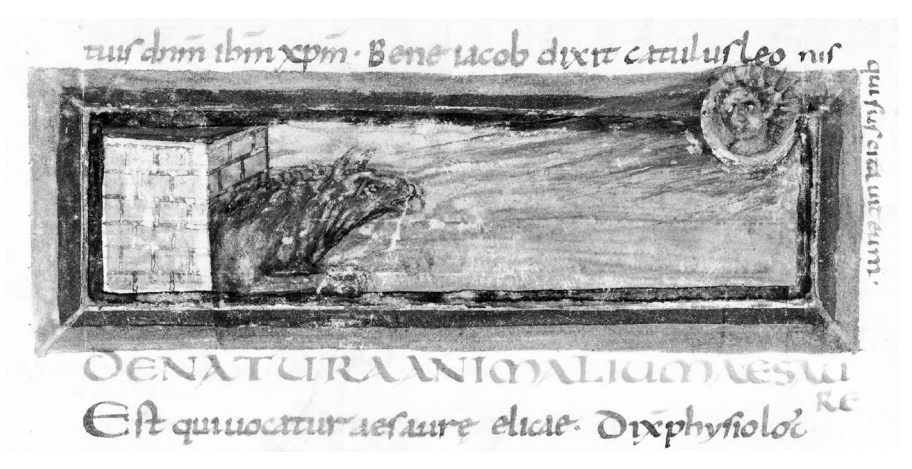
Figure 4.5. Haecpertus completes the text by writing around the miniature. Bern, Burgerbibliothek, MS 318, fol. 8v. Used with permission.

and of painting framed miniatures. (It is clear from occasional overlaps that the drawings were added after the pages were ruled but before the text. One such overlap is evident in the last line on fol. 8v, where the loop of the g in "intellegibilis" extends into the red border of a miniature.) Moreover, the creator of the Bern Physiologus needed to be a master manuscript-maker, not only skilled in the arts of brush and pen, but also trained in the kind of project management ability demanded by the complex mise-en page evident here. The manuscript is principally the work of a single scribe, probably the Haecpertus named in the colophon on fol. 130r.<sup>28</sup> I suggest that Haecpertus must have been not only the scribe but also the principal artist and master-maker of the Physiologus .