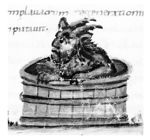
Figure 4.3. The bathing devil in Bern, Burgerbibliothek, MS 318, fol. 17v. Used with permission.

The Bern Physiologus also contains one other drawing that distinguishes it from other manuscripts and may not have been copied from a pre-existing model: the illustration that seems to accompany the chapter on the salamander on fol. 17v. This chapter is entitled De natura animalis qui dicitur salamandra and lists the characteristics of the animal: if it enters a furnace it extinguishes the flame; if it enters a warm bath, the entire bathroom grows cold. The Physiologus compares this behaviour with the biblical parable of the three boys who were thrown into a furnace, where the power of Christ protected them and induced the flames to attack their enemies instead. Just before the chapter's incipit is the small painting in question, without an enclosing frame, depicting a small, hairy, man-like figure with slightly curving horns, sitting in a round wooden bathtub surrounded by grass and plants (Figure 4.3). His prominent lower lip gives him a comically mournful air.