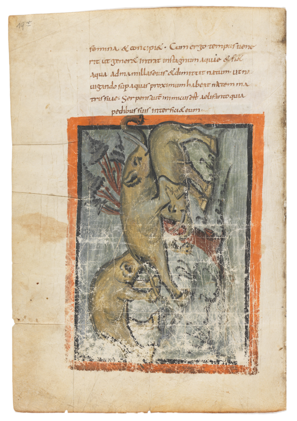
Figure 4.4. The falling elephant in Bern, Burgerbibliothek, MS 318, fol. 19v. Used with permission.