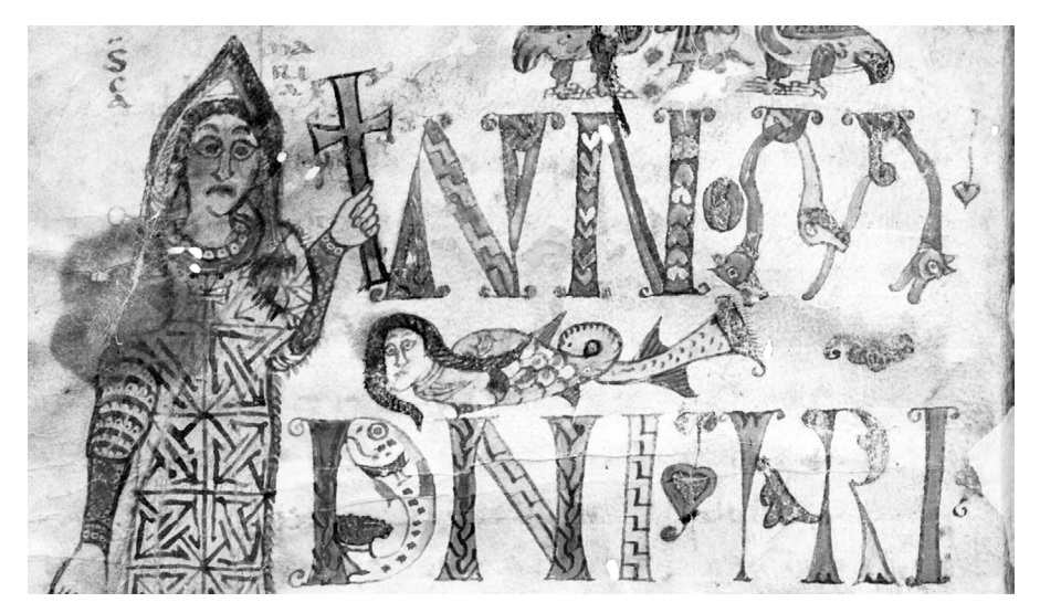
Figure 5.1. Siren. Paris, Bibliothèque nationale de France, MS lat. 12048 (the Gellone Sacramentary), fol. 1v.

were later executed.<sup>51</sup> In such an unrestricted context, could the illustrator have been responding not only to the Physiologus , but also to the glossae collectae ?