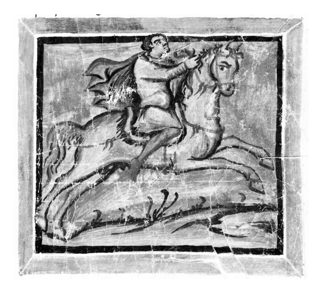
Figure 4.2. Caballus , the horse, with its rider. Bern, Burgerbibliothek, MS 318, fol. 22r. Used with permission.

The second is Caballus , the horse, taken from Isidore's Etymologiae XII.1.42–8.<sup>22</sup> The Galli cantus image shows three birds, two of which may be singing, perched on a beam, with three archways in the background (Figure 4.1). Caballus depicts a man on a galloping horse (Figure 4.2). It is possible that they represent an original ninth-century addition to this manuscript.