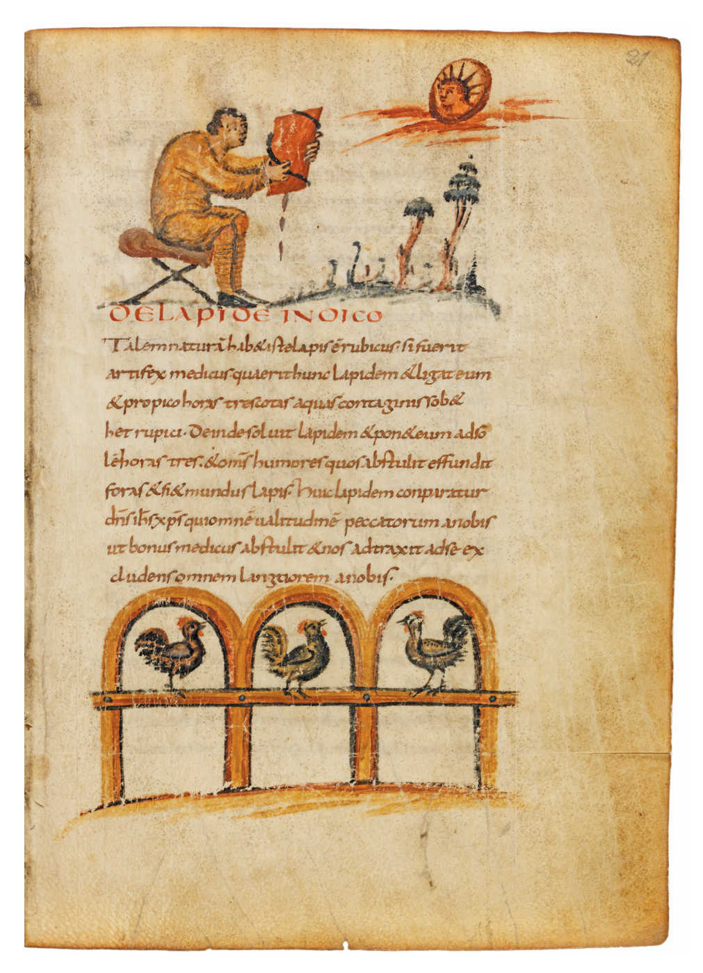
Figure 4.1. Galli cantus , the singing cockerel, beneath the illustration for the Indian stone. Bern, Burgerbibliothek, MS 318, fol. 21r. Used with permission.