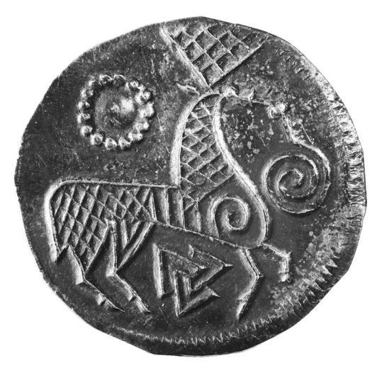
Figure 2.1. Viking-age sceatta (reverse) depicting a stag apparently kissing a snake. Ribe, Sydvestjyske Museer Denmark, catalogue no. NM FP 14603.1. Available under CC-BY-SA licence.

Aldhelm and Hwaetberht's riddles, the Exeter Book and the Peterborough booklist demonstrate that the Physio logus was known to Insular writers from at least the second half of the seventh century. Some early medieval English coins may also have been influenced by the Physiologus in their animal depictions.<sup>38</sup> We can only speculate, given the lack of sources, about the spread of the text in the seventh