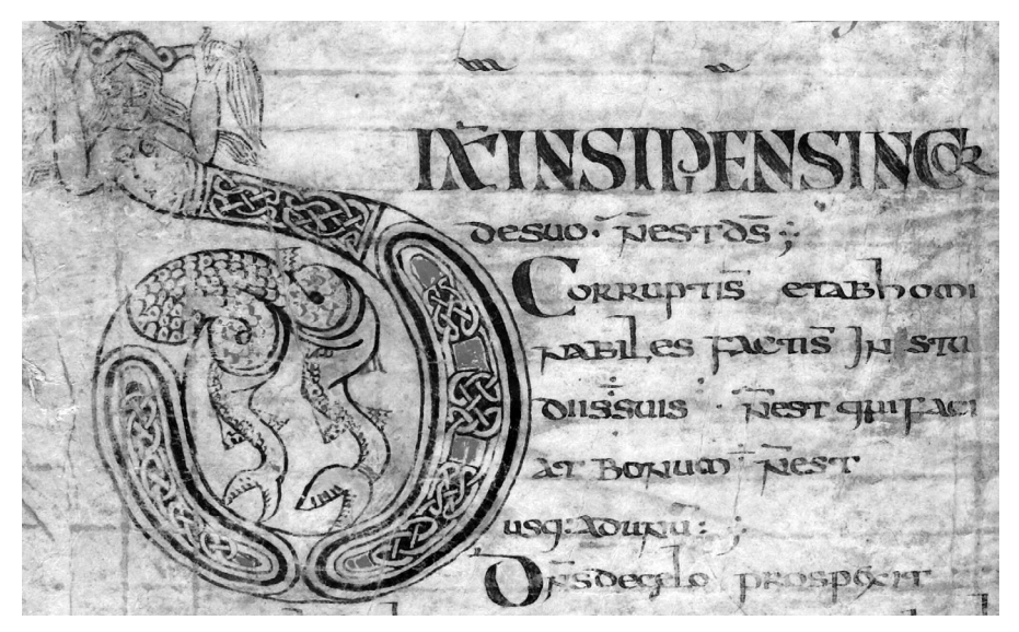
Figure 5.2. Zoomorphic initial D. Paris, Bibliothèque nationale de France, MS lat. 13159, fol. 13v.

A similar mermaid appears in a late eighth-century psalter as a zoomorphic initial D (Figure 5.2). The earliest known fish-siren is described in the seventh-century Liber monstrorum de diuersis generibus , in which the storyteller paints "a little picture of a sea-girl or siren, which if it has a head of reason is followed by all kinds of shaggy and scaly tales."<sup>53</sup> Fish-tailed beings proliferated in antiquity, but it remains unclear how the early medieval siren went from bird to fish.<sup>54</sup>