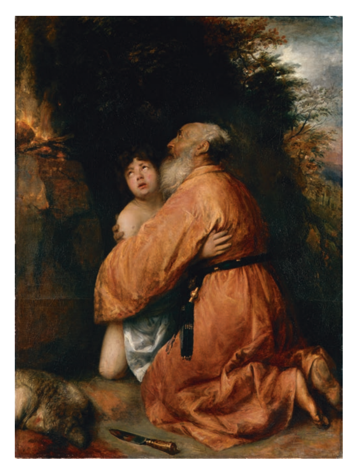
Fig. 16.1 Jan Lievens, The Sacrifice of Isaac, c. 1638, Herzog Anton Ulrich Museum Braunschweig

now also relinquishes her gender, her body, and daylight. First, the vet notices "that you were dusking between a boy and a girl, and that you became increasingly preoccupied with 'dear boys' in the swimming pool" (183). He is not sure whether she wants to be with boys or become a boy. In effect, she is in a process of what Donna Haraway calls "becoming with," seeking connections and encounters that distract her from the vet's sphere of influence (2008, 27). Then, the girl stops eating, becoming so