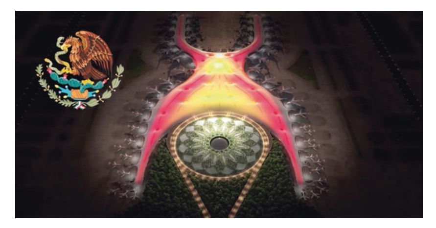
Fig. 6.1 Rendering of Foster and Romero's airport project. Screenshot from a promotional video produced by the Mexican government. YouTube . https://www.youtube.com/watch?v=jwsJnNd_1I

in September 2015, and with it started the production of a new kind of hinterland.