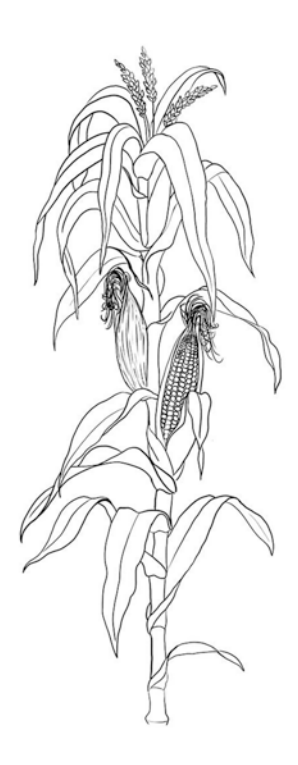
Fig. 18.2 Illustration of a maize plant. © Shaifali Bramdev, 2022

Farming practices that are kinder to soils are at odds with the mechanized monocropping of Johannesburg's Maize Triangle. This area extends