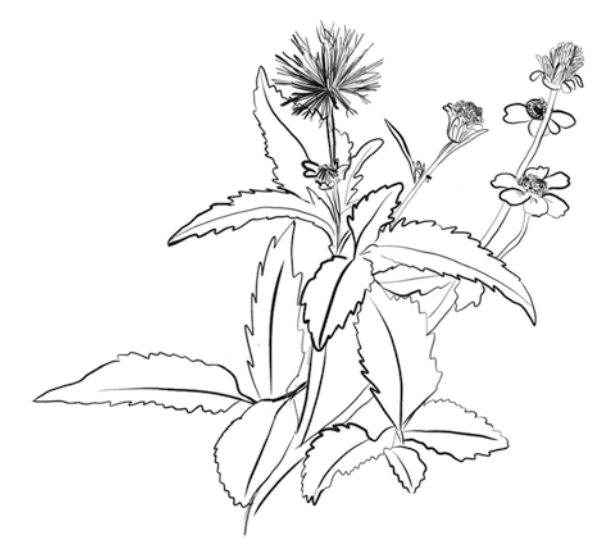
Fig. 18.1 Illustration of a blackjack plant. © Shalifali Bramdev, 2022

Any visit to the Greenhouse Project results in having to remove a layer of prickles from shoes and clothing. Blackjack springs up in fertile beds as well as from the disturbed, shallow soil of cracked pavements. This hardy daisy family member has sharp burrs that spread seed at the rate of 30,000 per plant. Pedestrians walking on any overgrown paths will always find themselves unwilling participants in their propagation. Blackjacks take root in the Greenhouse Project as well as in the poorly maintained streets outside, growing up to 60 centimeters high (Fig. 18.1).