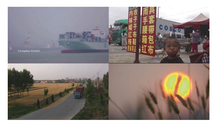
Fig. 2.1 a-d Screenshots from Plastic China

China. The film's setting feels neither urban nor rural in a classic sense. After an opening shot of a toddler playing in a cave of plastic, the film moves to the industrial loading docks of Qingdao (Tsingtao) Harbor. The camera follows the slow, smooth movement of a cargo ship as it enters the port (Fig. 2.1a). Echoing the Germanic etymology and original definition of hinterland as that which is behind the (often colonial) port (the city and harbor of Qingdao were built as a concession to German forces in 1898, during the European "scramble for concessions" in China), viewers are invited to travel with the containers as they are lowered onto truck beds and move beyond the dock, through small market towns and villages (Fig. 2.1b-c). The containers soon shed their shells, revealing sacks of waste as they move against the backdrop of idyllic sun-lit wheat fields (Fig. 2.1d). The pairing of radiant green and gold fields with the industrial aesthetics of container trucks and global garbage sets the scene for a sense of matter out of place and, if we follow Bakhtin (1981), also out of timethe cyclical, repetitive temporality evoked by the rural idyll, in which human rhythms and natural rhythms move in harmony, is intruded upon by capitalist modes of abstraction and mechanized labor. At last, one of the trucks arrives at its destination: the small family-owned plastic waste processing factory where most of the film will take place.