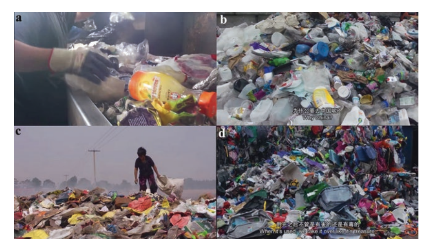
Fig. 2.5 a-d Screenshots from Plastic China (media version); top two images set in the US (California) and bottom two images set in China (Shandong)

knowledge about what will happen with the materials they sort after they are shipped off to China.