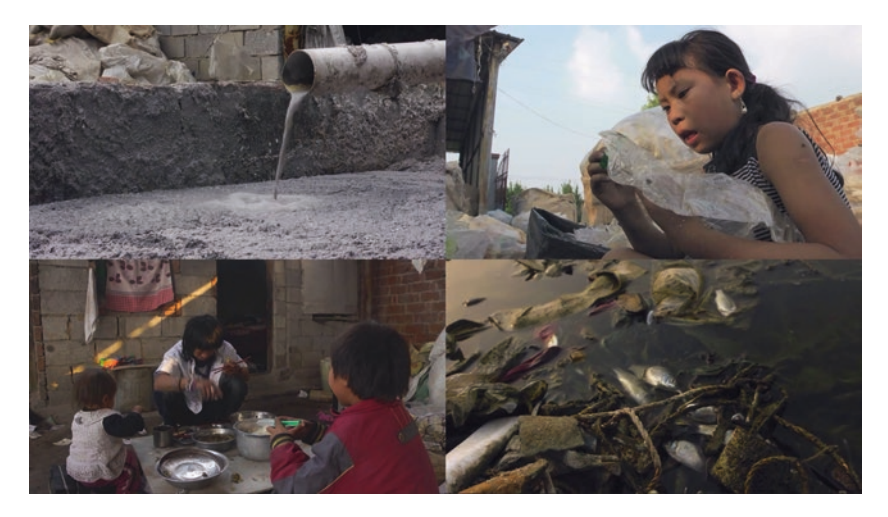
Fig. 2.3 a-d Screenshots from Plastic China

gleaming, semi-translucent visuality and crunch of which seem to counterpose itself to the green and brown organicity associated with nature and with rurality. Indeed, in shots that focus on the children living at the family factory, the composition is such that the whiteness of the plastic begins overwhelming the children in visual proportions, nearing the top edge of the frame or exceeding the frame altogether—a sea of plastic with seemingly no end (Figs. 2.2b–d and 2.4a–b). This sense of grandeur, paired with concerns over environmental pollution, is described by Jennifer Peeples (2011) in terms of the "toxic sublime" in her analysis of post-1970s ecological photography in the US, especially that of Edward Burtynsky. Drawing on Kant's and Edmund Burke's characterizations of the sublime as that which is vast, magnificent, infinite, and unfathomable and moves the mind toward a form of negative contemplation, Peeples points to the simultaneous sense of revulsion and awe captured by the toxic sublime, whose contemplation can offer impetus for change.