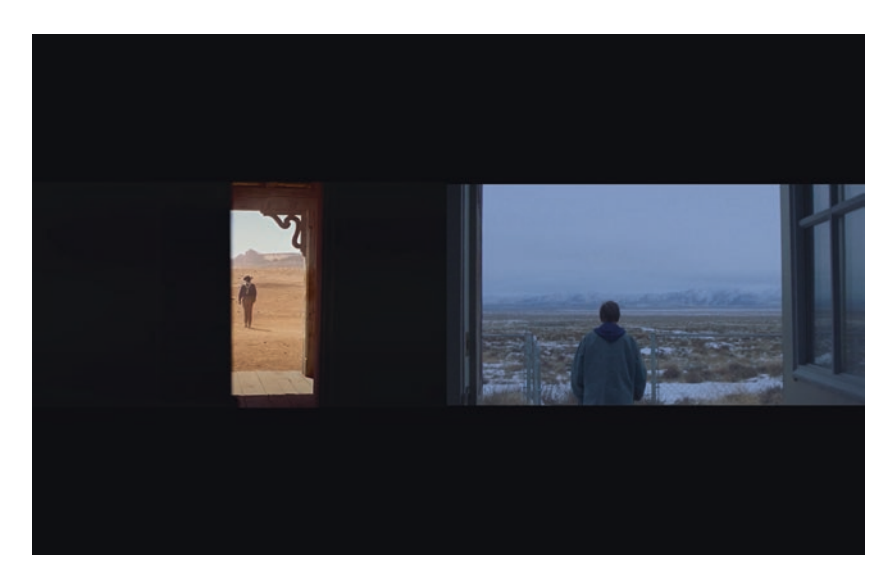
Fig. 10.3 Ethan Edwards and Fern walking away from, respectively, the secured ranch and the lost home. Screenshots from The Searchers and Nomadland

In the following shot, Nomadland explicitly references the closing images of The Searchers (Fig. 10.3). After eradicating the threat of indigenous presence and restoring the white heterofamilial space of domestic property, Ethan Edwards turns away from the ranch and walks into the endless and transcendental sprawl of the western landscape. The door of the ranch closes behind him. In this way, The Searchers ensures the safeguarding of the white family and nation, while Ethan/John Wayne is immortalized as the rugged free individual and righteous colonial subject who continues his journey toward endless American expansion and progress. In Nomadland , Fern also walks away from her former property. The landscape, however, is encumbered by a heavy layer of clouds that foreclose visions of transcendence associated with settler colonial teleology. The backdoor stays open, and as the shot widens, the viewer sees Fern exit