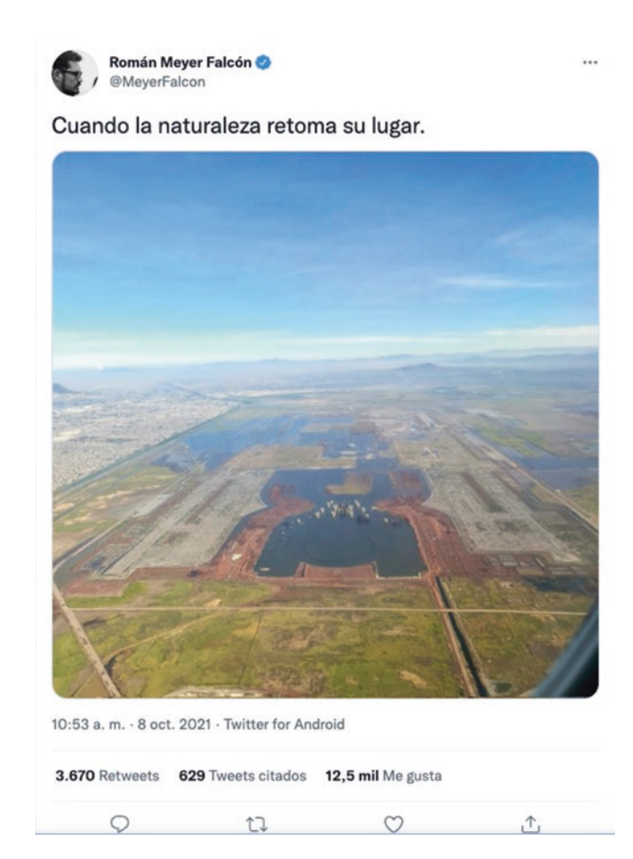
Fig. 6.2 Post on Twitter by Román Meyer Falcón, Minister of Agrarian, Territorial and Urban Development, 8 October 2021. Twitter.com

(in reference to the word funnel). They were one of the central elements of his design and would serve to support the roof of the X-shaped terminal building, allowing for large openings, and helping ventilation, capturing rain and letting in natural light (Juárez 2018).