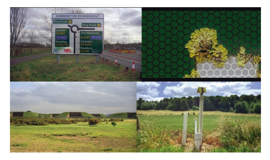
Fig. 13.1 Road sign to Newbury (a); Lichens on road sign to Newbury (b); Greenham Common (c); GPSS marker with yellow top (d). Screenshots from Robinson in Ruins

One crucial theme running through the film is the threat of global warming. Redgrave quotes Robinson's reading of the famous sentences from Frederic Jameson's The Seeds of Time : "it seems to be easier for us to imagine today the thoroughgoing deterioration of the earth and of nature than the break-down of late capitalism." Over the course of the film, Redgrave delivers three reports about the climate crisis, all indicating that excess uses of carbon dioxide will have devastating consequences for life on earth. Following Jameson's quote, turning the tide requires finding alternatives to late capitalism. The lichens point Robinson in the direction of Newbury, which witnessed the 1795 Settlement Act, legislation addressing the exploitation of local workers.