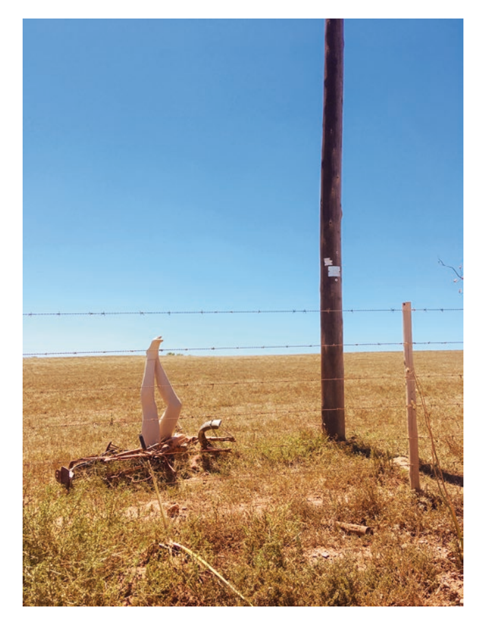
Fig. 8.1

Africa's hinterlands could be places of insight for neglected sites ready for critique and relational comparison<sup>10</sup>; for reading self and other; for seeing deeply historic human, land, plant, and animal, and sensorial connections and entanglements; and for gathering spots for a range of source materials that includes non-fiction writing, photography, and other mediums as forms of the expressive. Such experimental hinterlands awash with intense