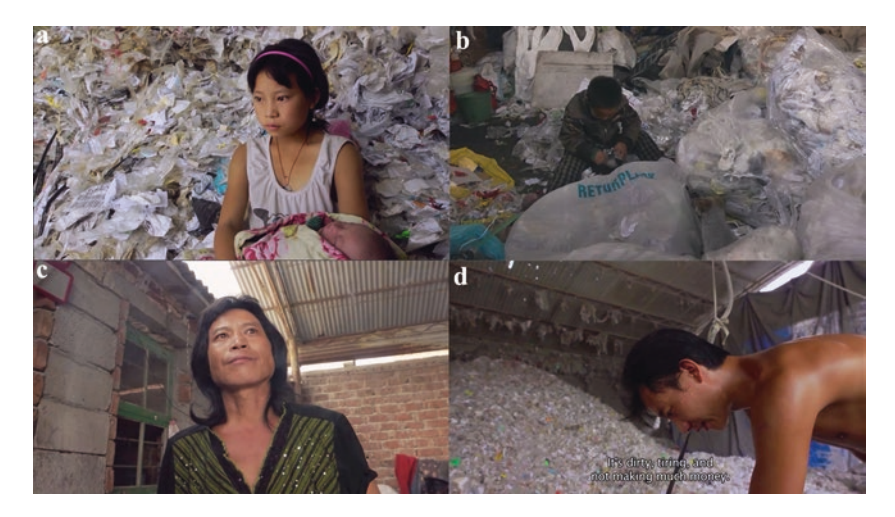
Fig. 2.4 a-b Screenshots from Plastic China

multiplicity of white as color and the common sensibility toward plastic as inorganic and never-decomposing together conjure a time out of time, an inertness that points at once to human finitude and a plastic eternity—all while evoking both innocence and mourning. Such paradoxes of aesthetic attraction and aversion are precisely what Peeples describes in the potential effect of the toxic sublime, which aims to produce a moment of hesitation and contemplation, specifically of one's own complicity with the state of affairs.<sup>5</sup>