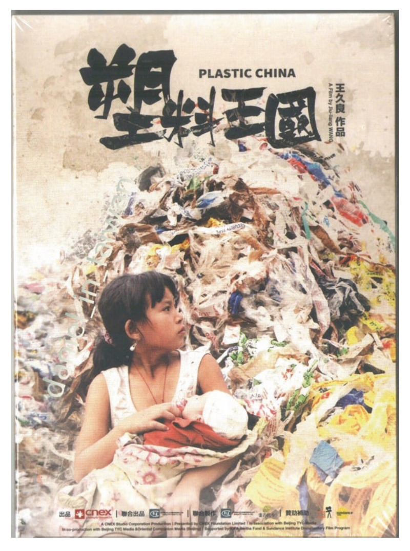
Fig. 2.6 Plastic China DVD cover

production of affects, simultaneously reproduces an image of China as a site of unfreedom and authoritarian paternalism—reminiscent of Cold War imagery of lost childhood on the other side of the iron curtain,